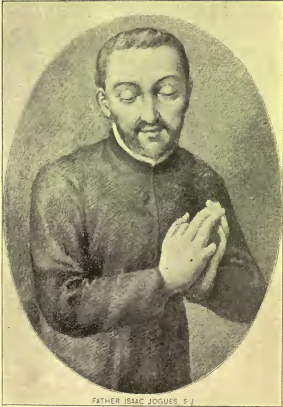
FATHER ISAAC JOGUES, S. J.