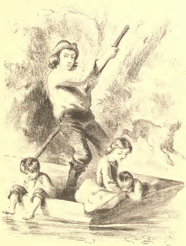
Illustration of a woman in a boat with children and a dog.