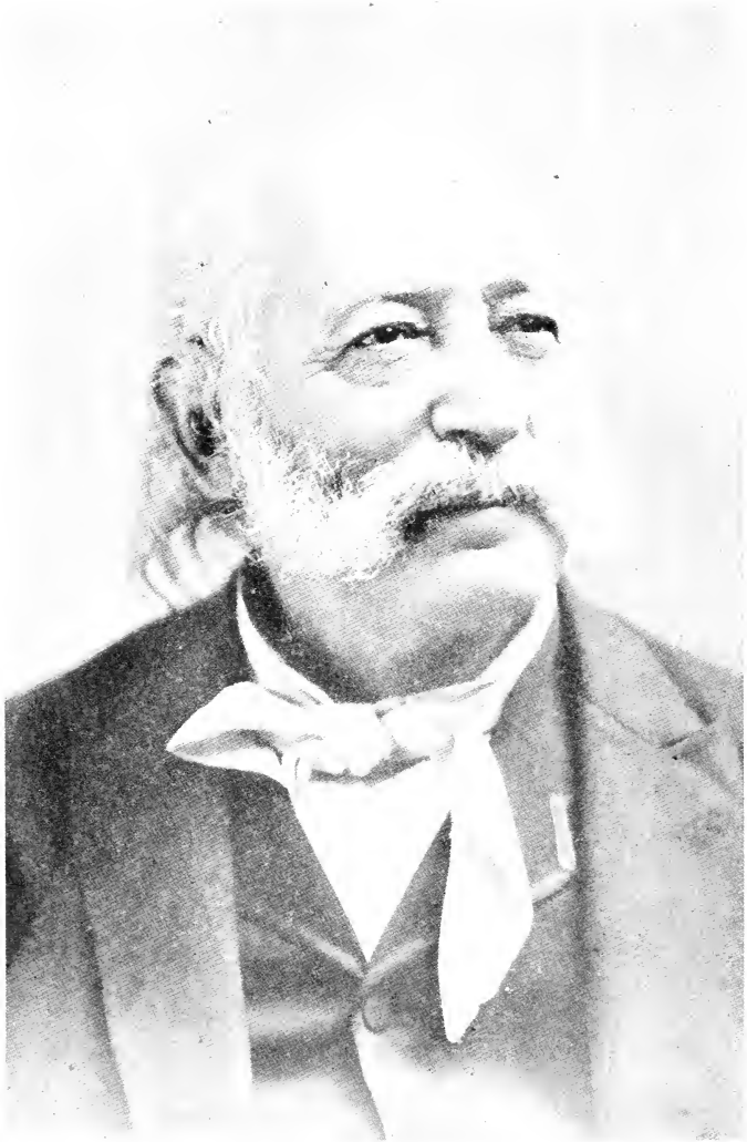
ISAAC M. WISE