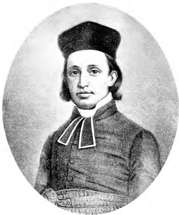
ISAAC M. WISE