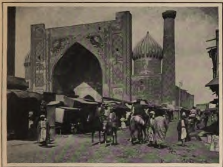
Mosque at Samarkand, Central Asia