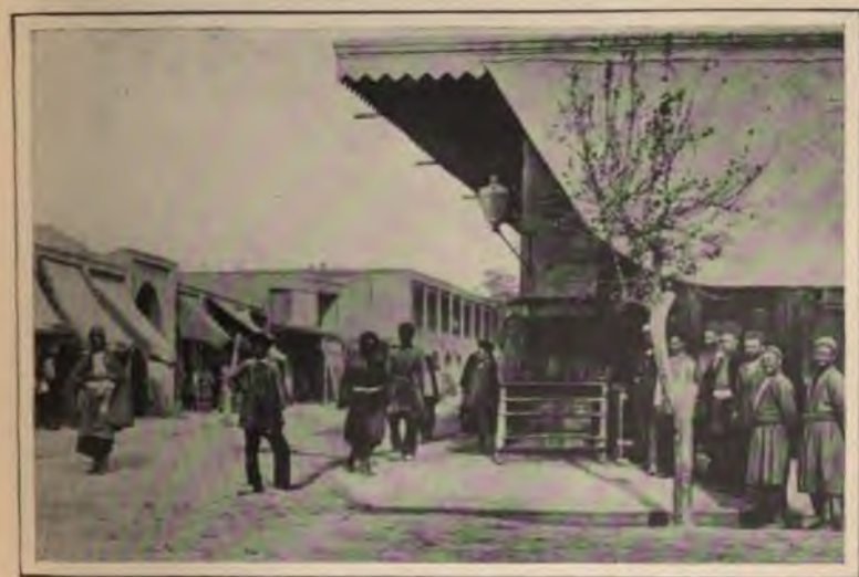
Street in Askabad