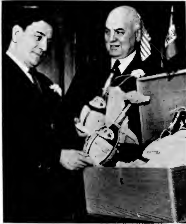
Bonfort's Wine and Spirit Circular

Mayor Rossi of San Francisco presents Tito Schipa, the famous tenor, with a case of California Tipo Wines