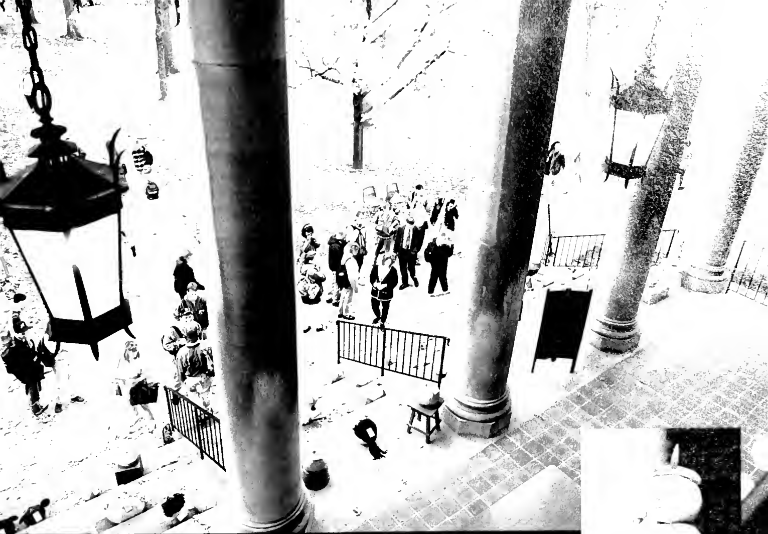
Above. Oak Grove passersby admire the fruit display.