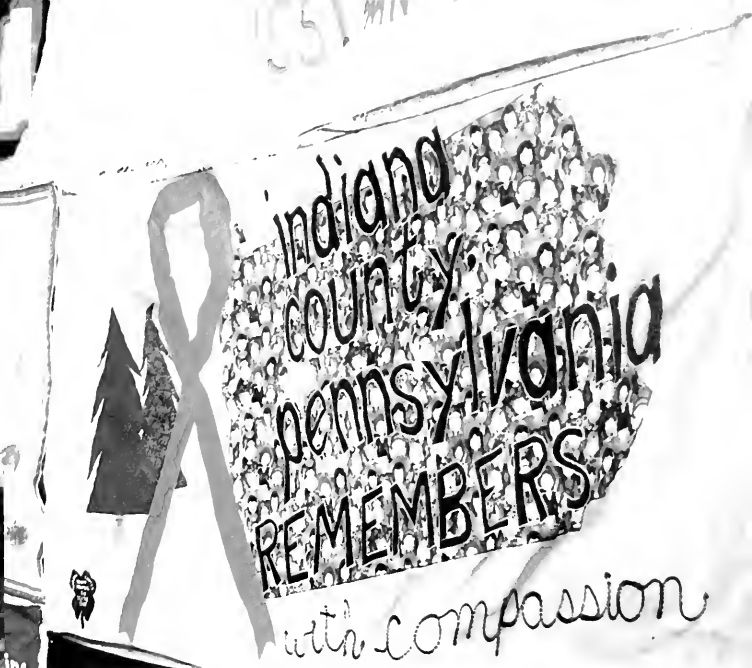
The Names Project Revisits: For a second time, sections of the Names Project AIDS Memorial Quilt were displayed on campus. Myriad campus and community groups sponsored the quilt's three-day stay in the multipurpose room of the Hadley Union Building. This panel, created by the 4-H Helping Hands group of Marion Center to represent Indiana County, recently was donated to the Names Project. IUP donated its own panel back in 1991.