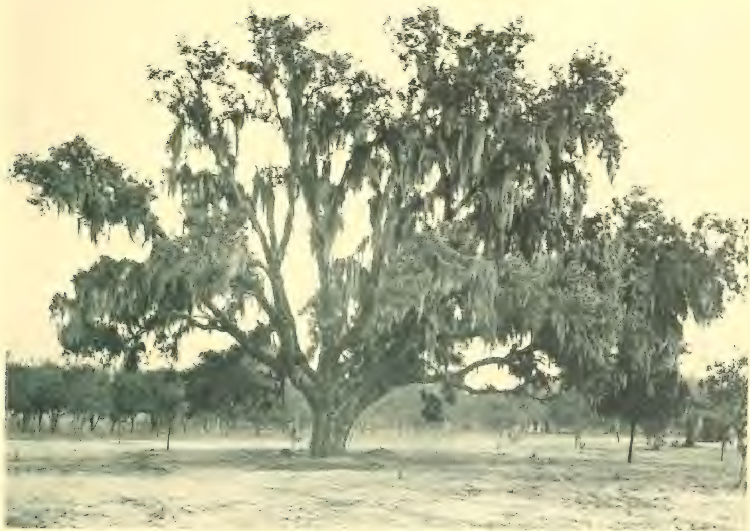
THE SPANISH MOSS TREE