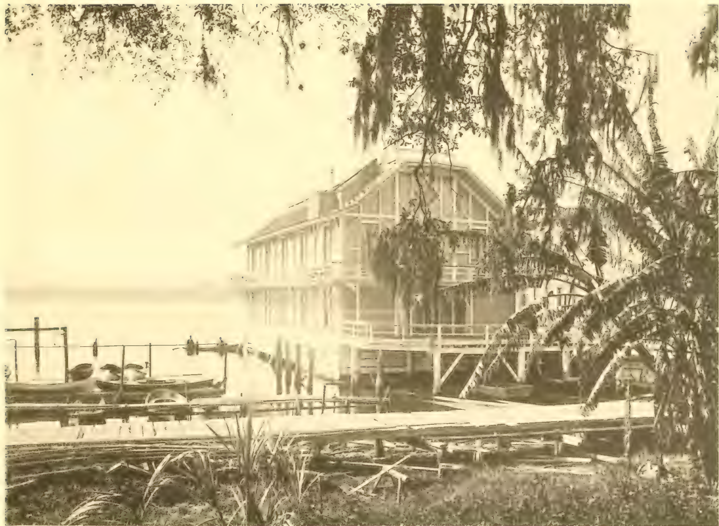
WOODS HOUSE & DOCK