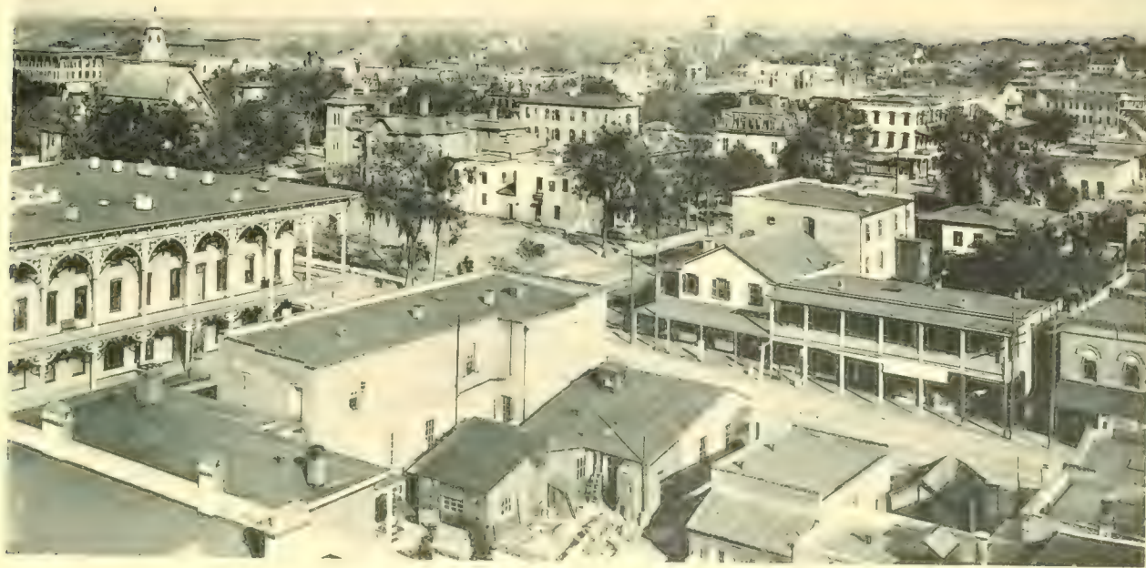
JACKSONVILLE - NORTH EAST OF THE E