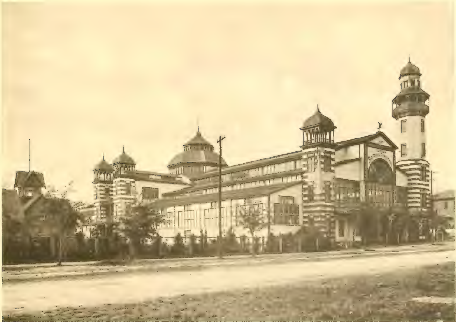
THE FLORIDA STATE CAPITOL