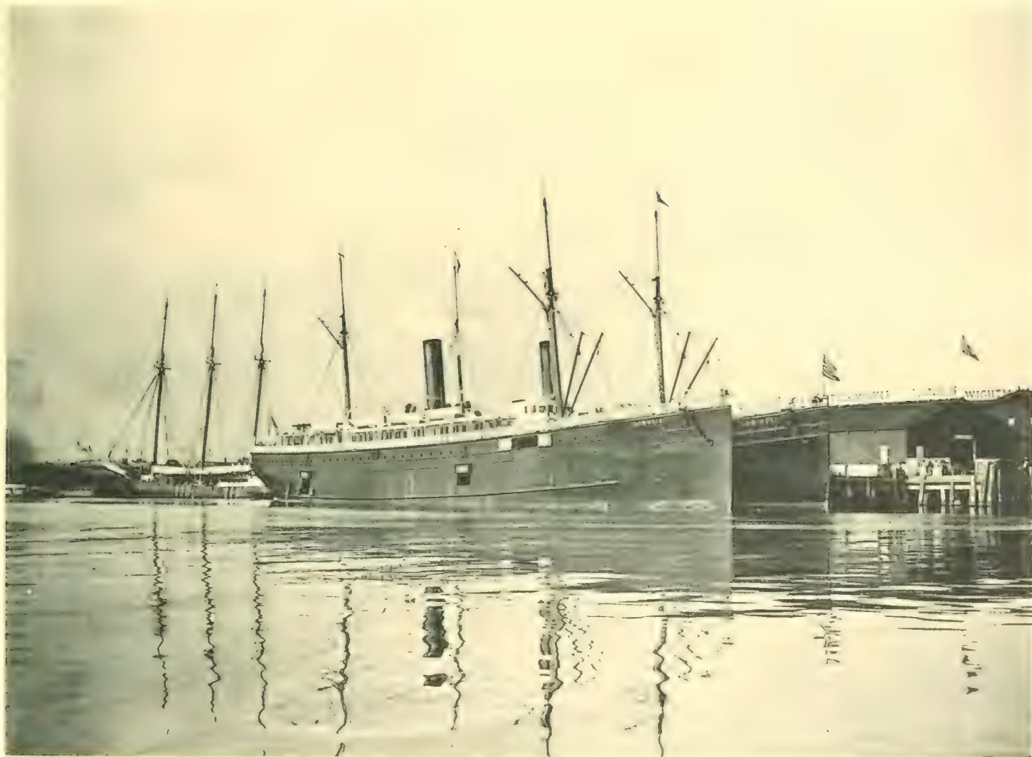
CLYDE LINE STEAMERS IROQUOIS AND SEMINO