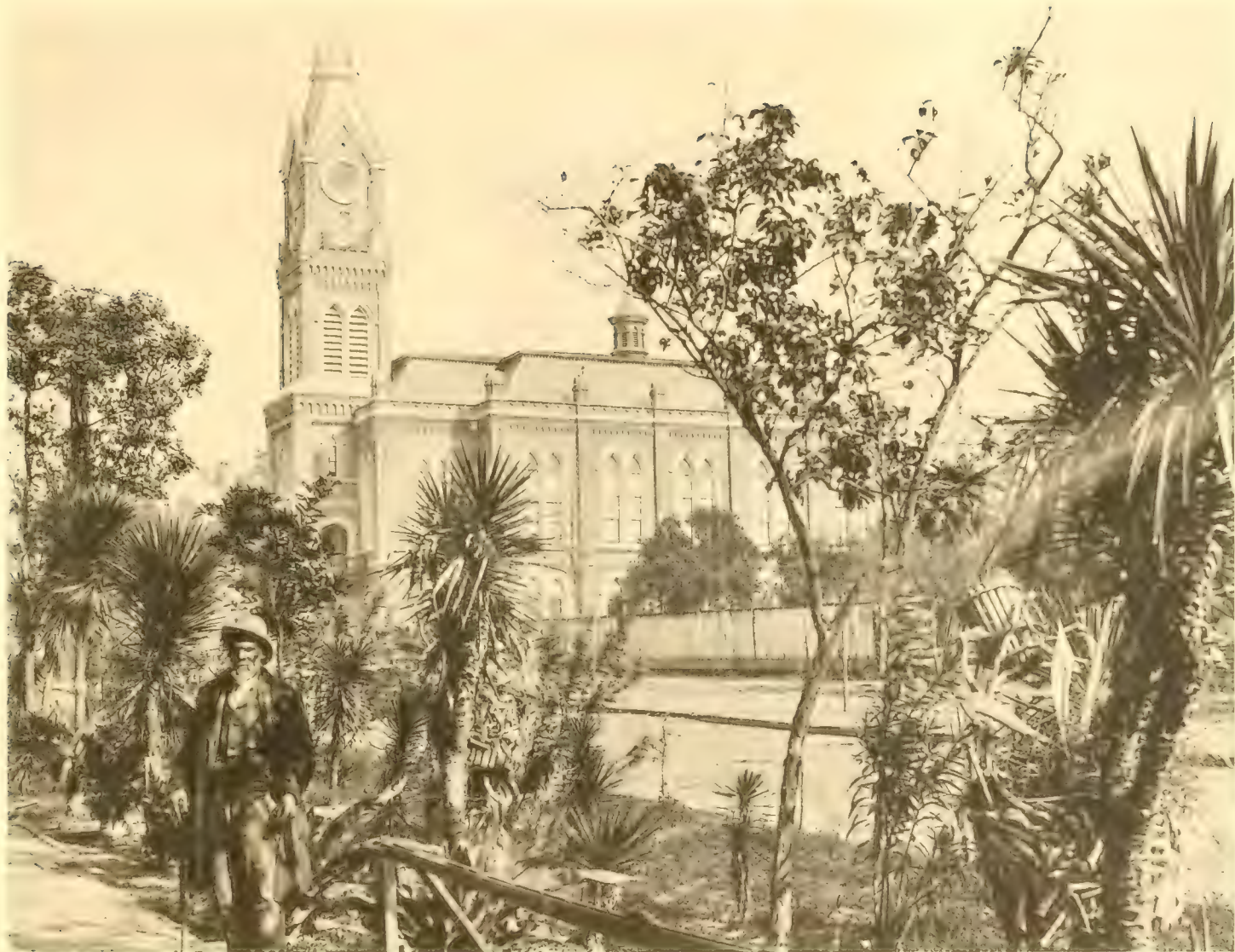
VIEW OF THE CHURCH FROM THE GARDEN