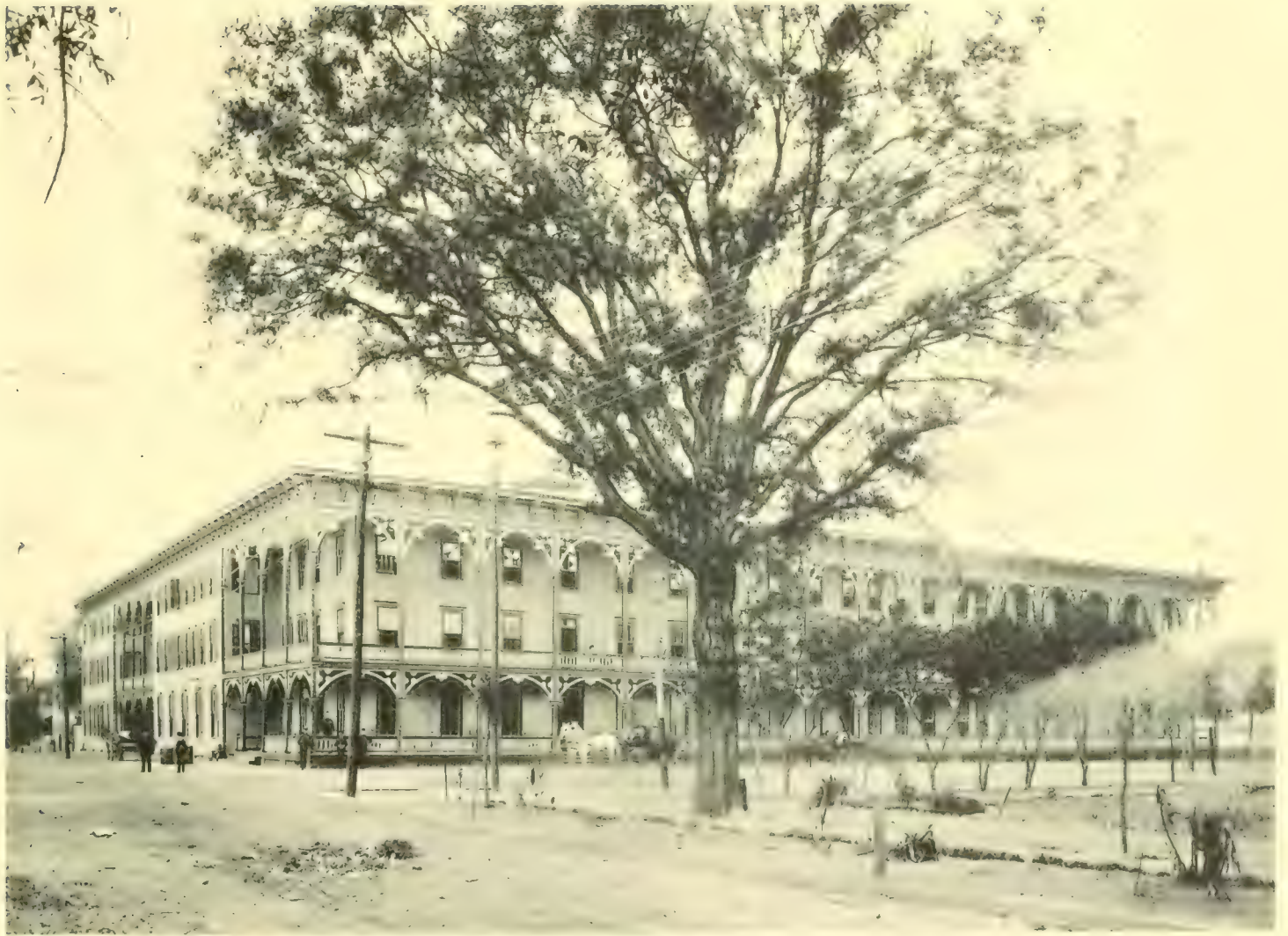
THE HOTEL DE LA CROIX