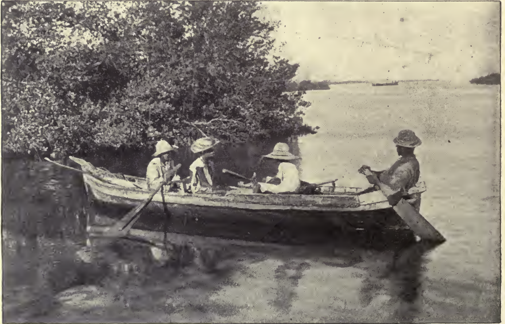
A NATIVE FISHING BOAT.

The track is oval in shape and just one mile in length. On the western side is an iron grand stand, underneath which are bar rooms, weighing rooms and other offices, with a railed enclosure in front. Flanking this, a strip of garden north and south divides the course from the road.