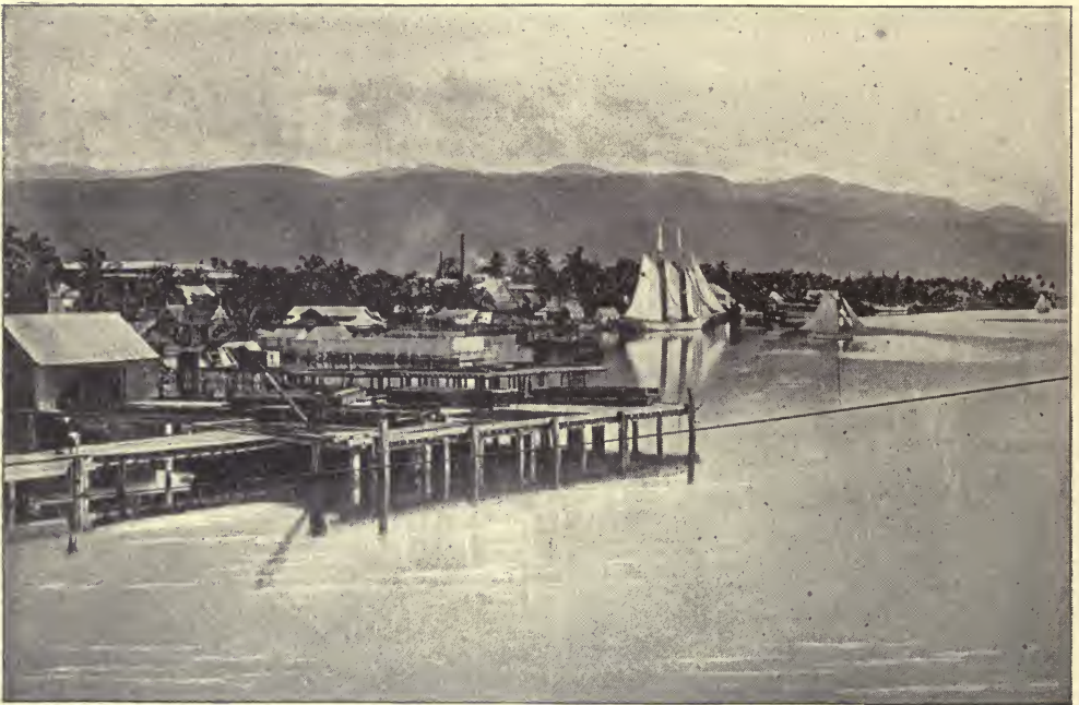
KINGSTON FROM HARBOUR.

Various religious sects have their places of worship in Kingston, but none of them claim to be grand or great specimens of ecclesiastical architecture. The Presbyterian Kirk in East Queen Street and the Wesleyan Chapel adjoining it, and known as the Coke Chapel, in memory of Dr. Coke, an eminent and honored Methodist missionary a hundred years ago, are perhaps the best and most complete to look at. The Roman Catholic Church, or pro-cathedral, is undergoing enlargement and, when finished, will be a handsome structure.