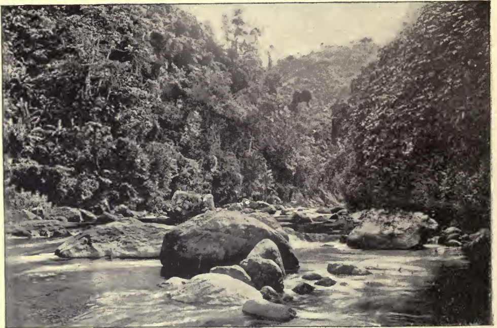
ON THE WAG WATER AT CASTLETON.

The glory has departed from Bath, as from many another Jamaica town. But the mineral waters, to which it owes its existence, are still there. They are worth visiting on account of the natural beauty of their situation, and the sufferer from