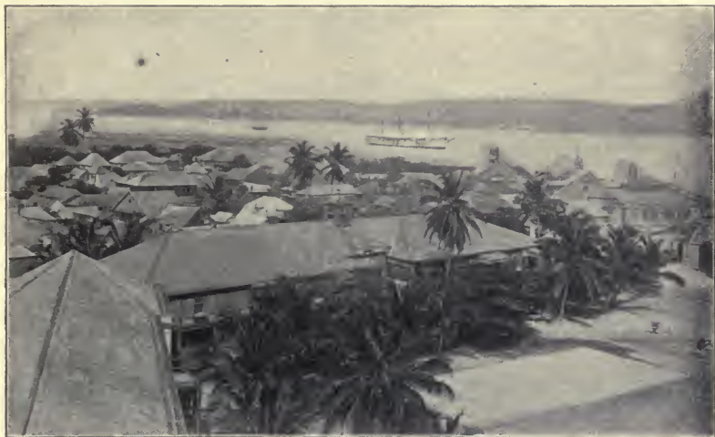
PORT ROYAL FROM CLOCK TOWER.

sweeping over the ruined and sunken town, complete the devastation. But this was not the end; for many days after, mutilated corpses floated up and down the harbour, or lay unburied on the shore, and the pestilence, which generated from these putrefying corpses, claimed almost as many victims as had the earthquake shocks. Nor was the destruction confined to Port Royal, for nearly every district in the Island suffered, some more seriously than others, but all to an extent which seems incredible. One familiar, and we believe fully-substantiated, case of extraordinary escape must not be omitted from any record of this dreadful visitation. At Green Bay, on the opposite shore to Port Royal, is the tomb of Lewis Galdy who died in 1739. The inscription on the tomb records that Galdy was swallowed down by one earthquake shock, and that, before life was extinct, a second shock cast him up again into the sea, whence he escaped by swimming to a boat. He lived for nearly a half a century after this adventure, was a member of Assembly and a respected merchant in Port Royal.