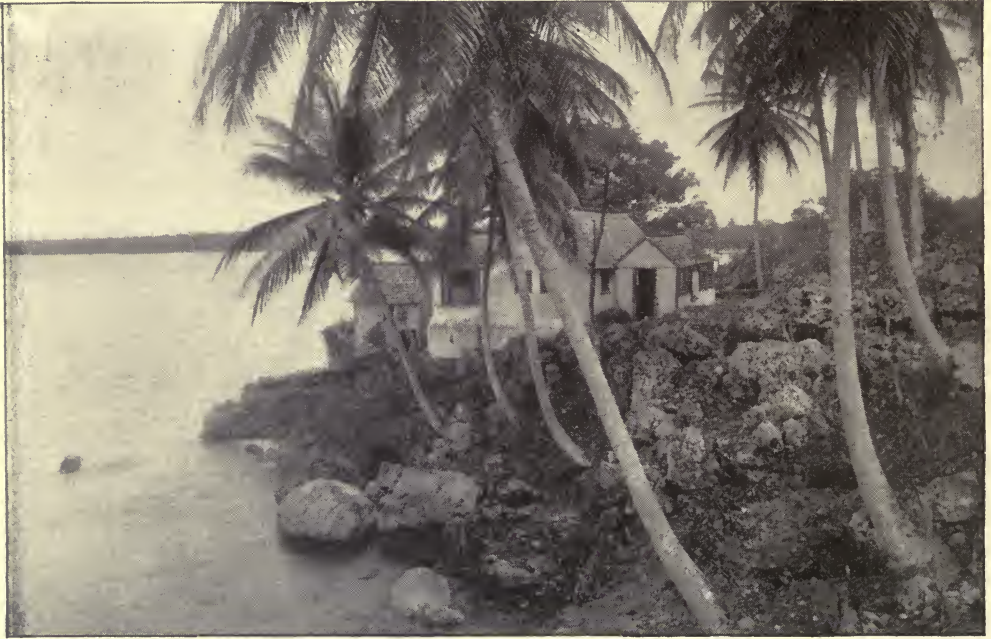
AT DRY HARBOUR.

The mountains among which this place lies were the scene of a long and