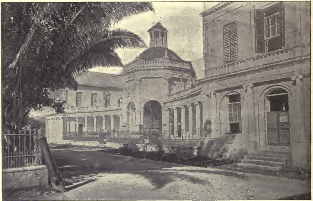
RODNEY MONUMENT, SPANISH TOWN.

Acts were passed with the professed object of ameliorating and modifying the conditions of slavery. The first important step, after the suppression of the Trade, was the compulsory Registration of slaves, the intention of which was to make it impossible to secretly revive the slave Trade by clandestine importations. Amid much opposition and a good deal of undignified protest on the part of the Assembly, this Act was passed, care being taken on the part of the Government to assure the Assembly that the measure was not meant to be a step towards Emancipation. Whether intended or not, it was such a step. Although the actual Emancipation was opposed point by point, and step by step, by the planting body in Jamaica and in England, yet every one knew that it was merely a matter of time, the length or shortness of which depended