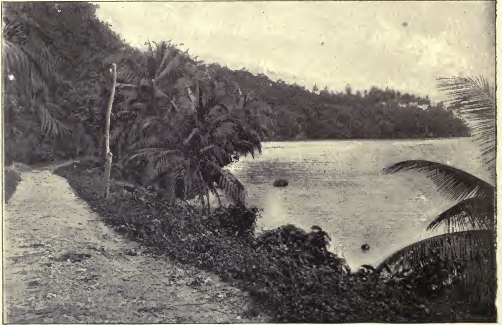
ON THE NORTH COAST ROAD.

The Blue Mountain forests teem with wild hogs, but the hunting of these is a vocation which demands a special training. The professional hog hunters