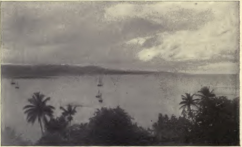
MONTEGO BAY. (MOONLIGHT.)

To inquire minutely into all the causes which lead to the acquisition of Jamaica by Great Britain, would necessitate a close review of the relations between England and Spain during the first half century of the Stuart dynasty. It is enough here to state that James I. and Charles I. had both given way too tamely and too timidly to Spanish claims and pretensions, and that the honour of England, the protection of her commerce and the safety of her subjects made it imperative on Cromwell's Government to protect British interests