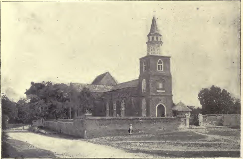
SPANISH TOWN CATHEDRAL.

The conquest, or re-conquest, of Jamaica being thus complete, its history for many years is mainly a record of the various steps which, in spite of fre-