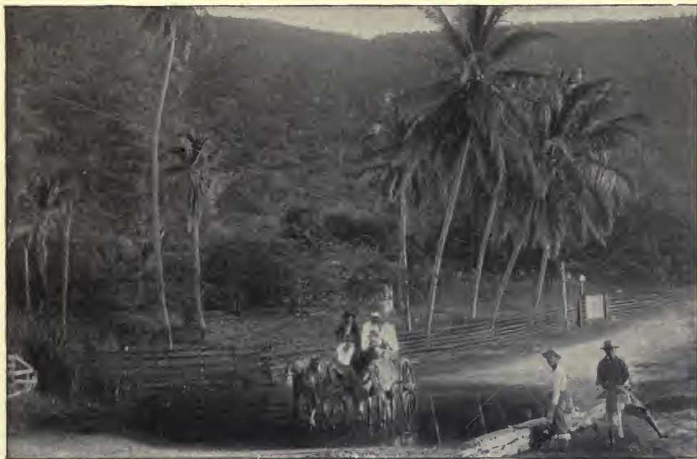
CROSSING A RIVER.

But although that is the case, the winner of the Queen's Purse, a three-mile race, is generally regarded as having carried off the "blue riband" of the