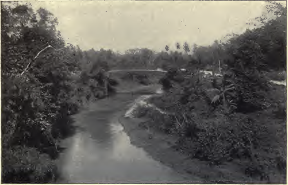
BRIDGE ON RIO COBRE RIVER.

Turning now from the original inhabitants to the first conquerors of Jamaica, the actual remains at the present day of the Spanish occupation are almost entirely confined to a few names and a few stones. The site of the first capital of the Island, Sevilla Nueva, founded by Diego Columbus, son of the discoverer, is marked only by a few stones on the estate of Seville, near St. Ann's Bay. In the town of Porus, we have perpetuated the name of the two