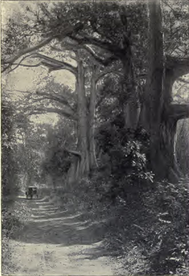
AVENUE OF COTTON TREES.

There are two principal rainy seasons, namely in May and October, but there is usually more or less rain all through the summer months. In the winter months in the neighbourhood of Kingston the precipitation is very light. The rain usually comes in heavy showers of only a few hours' duration, and the days during which the sun does not shine at all are very rare. It is almost always possible to predict when the rain is coming as it can be seen, quite a while