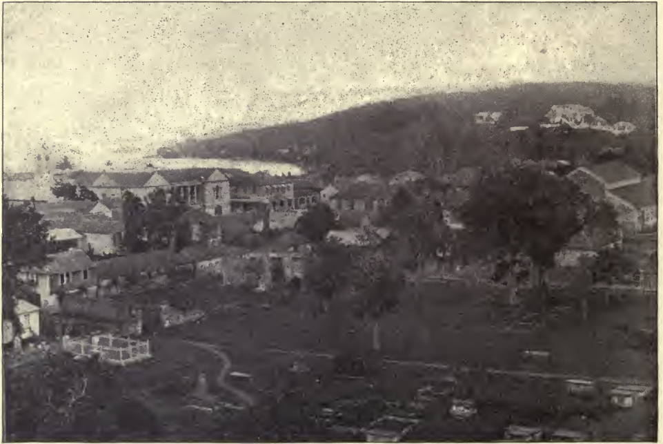
MONTEGO BAY FROM CHURCH TOWER.