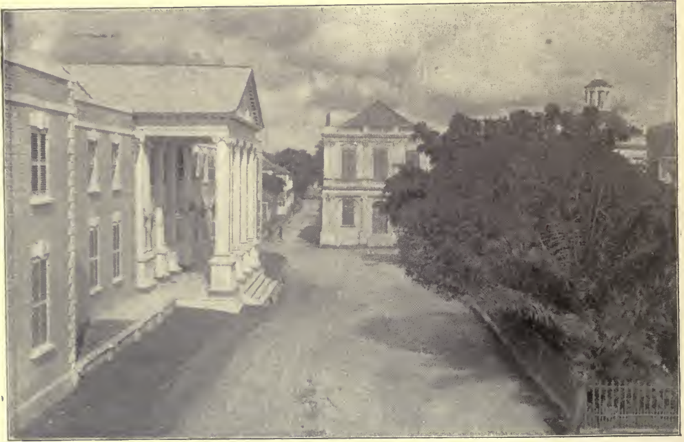
KING'S HOUSE, SPANISH TOWN.

Other places of interest in the Parish of St. Andrew are the King's House, the official residence of the Governor, the grounds of which are beautifully laid out, and the Up-Park Camp Barracks, about one and one-half miles north of Kingston, the head-quarters of the West Indian Regiment. The military band plays once a week' in the evening and occasionally in the afternoon, and the Camp is a favourite resort for lovers of music.