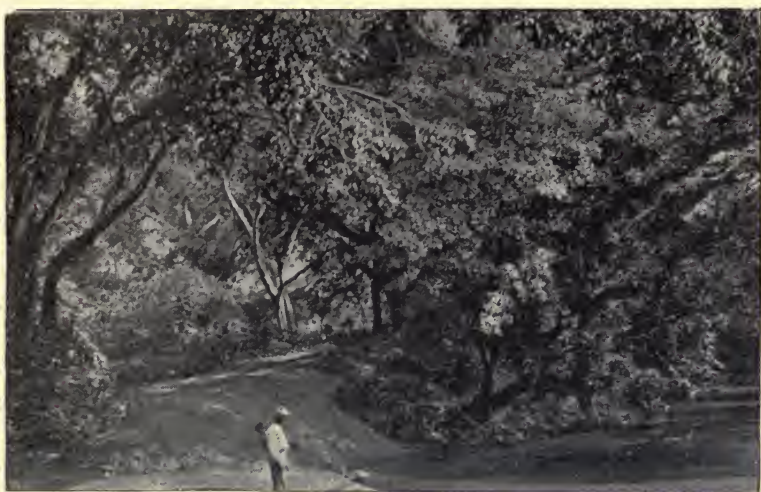
SPANISH TOWN RIVER.

The best time for shooting is in the grey dawn of the morning, and for a couple of hours after sunrise, for then the birds leave the roost and fly off to the feeding grounds in the case of pigeons, and the ducks and teal come out of the sedges and disport themselves in the open spaces on the ponds and marshes.