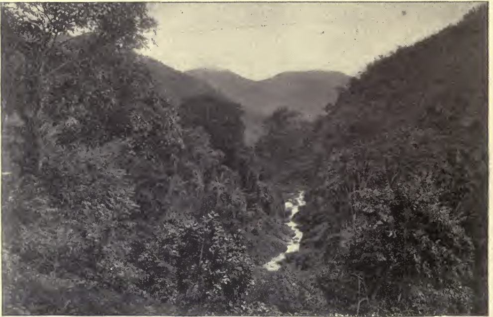
ON THE ROAD TO GORDON TOWN.

The first town reached is Annotto Bay, the situation of which is suggestive of moisture and malaria, owing to the fact that three or four rivers here find their way into the sea. Judging, however, from official statistics, Annotto Bay is by no means so unhealthy as might be expected. It is a prosperous little town and a growing centre of the fruit trade.