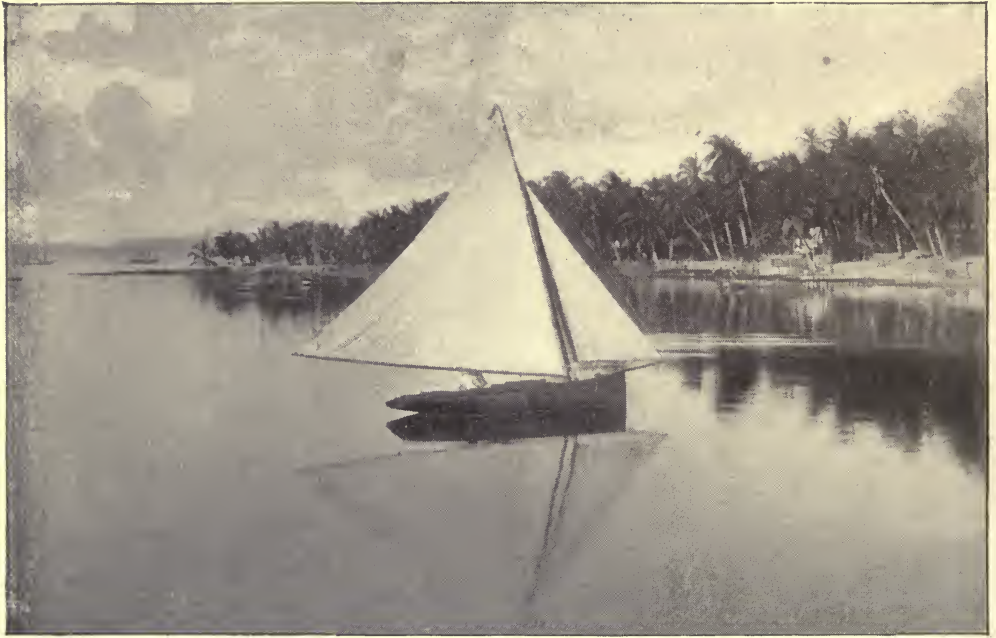
A BIT OF KINGSTON HARBOUR.

their beauty and varied charms as are to be seen anywhere in or out of the tropics. There are the rock-bound shore, the level beach, plains running down to the sea, gloomy lagoons and thick jungles of vegetable growth, broken here and there by river courses or dry ravines, while in the back-ground are to be seen mountains and hills differing in height from the modest hillock by the beach to the stately Blue Mountain Peak in the distant centre of the Island, the whole covered either with careful cultivation or with the reckless luxuriance of tropical life. Passing Morant Bay, the scene of the unhappy disturbances in 1865, he catches a glimpse of sugar estates, notable among which is that of Albion, with its waving sugar-canes, its feathery palms, its little Coolie colony;