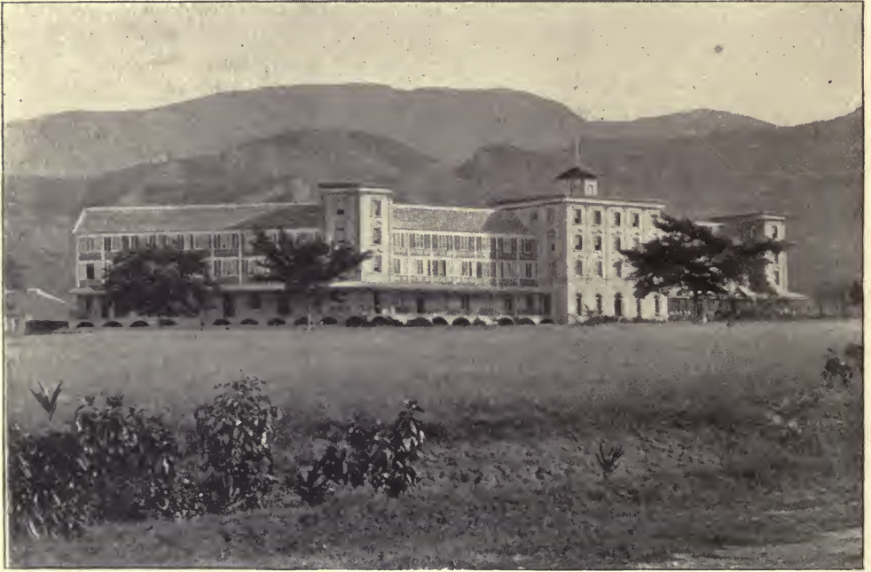
CONSTANT SPRING HOTEL, KINGSTON.

The tram-car from the Victoria Market terminus runs in a northerly direction about seven and one-half miles from Kingston, passing through the pretty