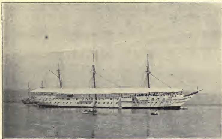
H. M. S. "URGENT."

After about an hour's drive the Falls River is reached. There is, however, no river to be seen, but the dry bed of a water-course fringed with unsightly bush, mostly of a thorny description. But those who are equal to the task of leaving their buggy and walking a mile or so up the ravine to where it emerges from those volcanic rocks that frown down upon it, will find a stream of crystal water. Following the rocky path cut along one side of it they arrive at the foot of a romantic looking waterfall, roaring down a cañon whose adamant walls tower hundreds of feet above.