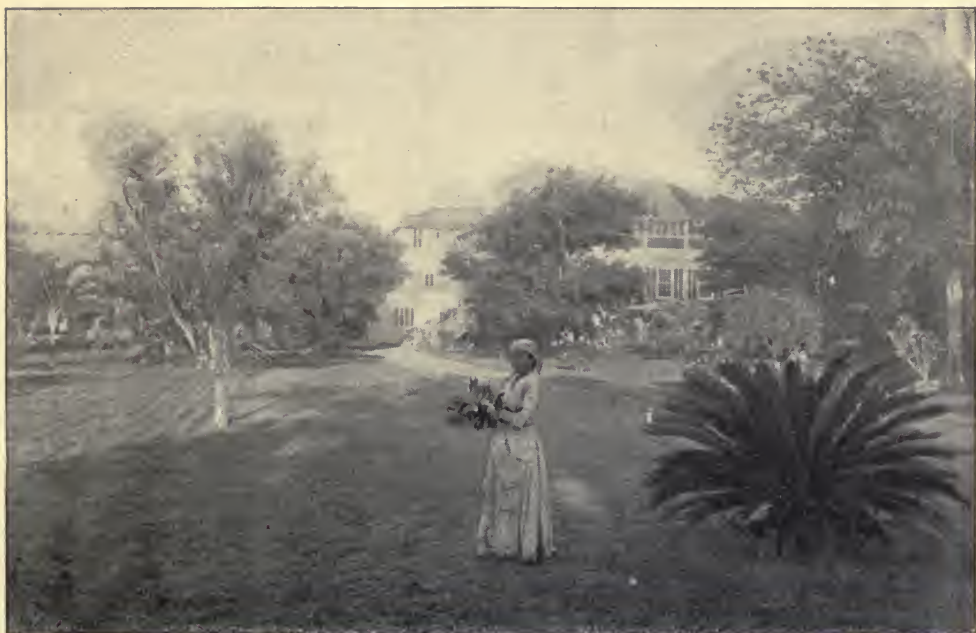
KING'S HOUSE AND GROUNDS.

loveliness and beauty of situation; in fact, no more delightful voyage could possibly be suggested than this around the Island of Jamaica. It occupies but four days, through waters always smooth; and every few hours a fresh port is made where passengers may land, returning to the steamer, or, if they prefer it, journeying overland to meet her at another port. Frequent opportunities are also afforded in the same manner for the return overland to Kingston on horseback, or by conveyances which are always to be hired at reasonable prices at the various ports of call.