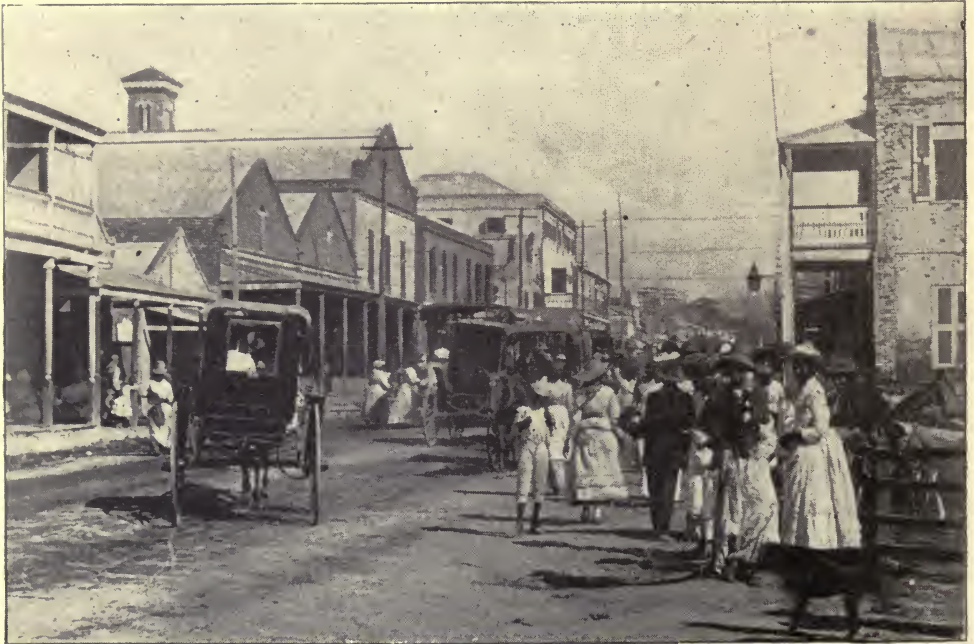
STREET VIEW, KINGSTON.

The Kingston Markets are well worth a visit. Here may be seen turtle, meat, poultry, fish, many of which are remarkable for the startling beauty of their colour, together with heaps of tropical fruits and vegetables, brought down overnight, mainly on women's heads, from distant parts of the Island. The noise, the bustle, the clatter of tongues, the seeming confusion, the spontaneous out-flow of good nature all combine to make a visit to a Kingston market, especially on Saturday morning, a sight and a scene which will not readily be forgotten. Of the two Kingston markets the Victoria Market is situated at the southern end