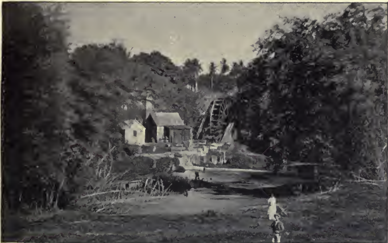
MARTHA BRAE, FALMOUTH.