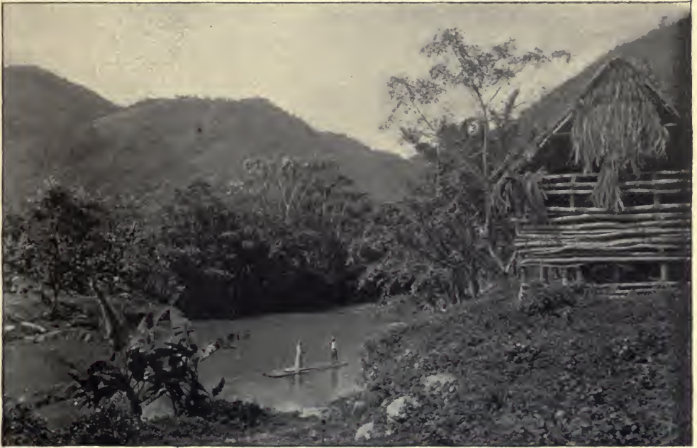
FERRY ON RIO COBRE RIVER.

bined with equability. A ride of a few miles into the hills will bring one from the torrid zone to the temperate—from an average temperature of nearly 80^{\circ} to one of 65^{\circ} or 70^{\circ} . But whatever district one may select, whether a warm one or a cool one, he will find the temperature very nearly constant, the extreme range for any one month being seldom over 25^{\circ} Fahrenheit, while that for the entire year, at Kingston, is but 35^{\circ} ; and in some parts of the Island the excursions of the mercury are even more restricted than this. As regards humidity, also, there is the same choice of climate open to the invalid or the pleasure seeker, who may select a place of residence with a humid or a dry atmosphere as suits best his inclinations or the necessities of