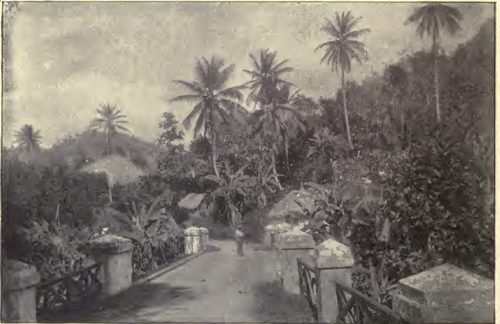
ON THE ROAD TO CASTLETON.

An outjutting promontory of coral rock, carpeted with green turf, divides the bay into two harbours. On this spit of land stands the picturesque remains of an ancient Fort, and behind it the old barracks. From the further margin of each harbour the hills rise step by step, profusely covered with tropical vegetation and plumed with many a tall cocoanut, among which the white walls and the green windows and the red roofs of the houses look out