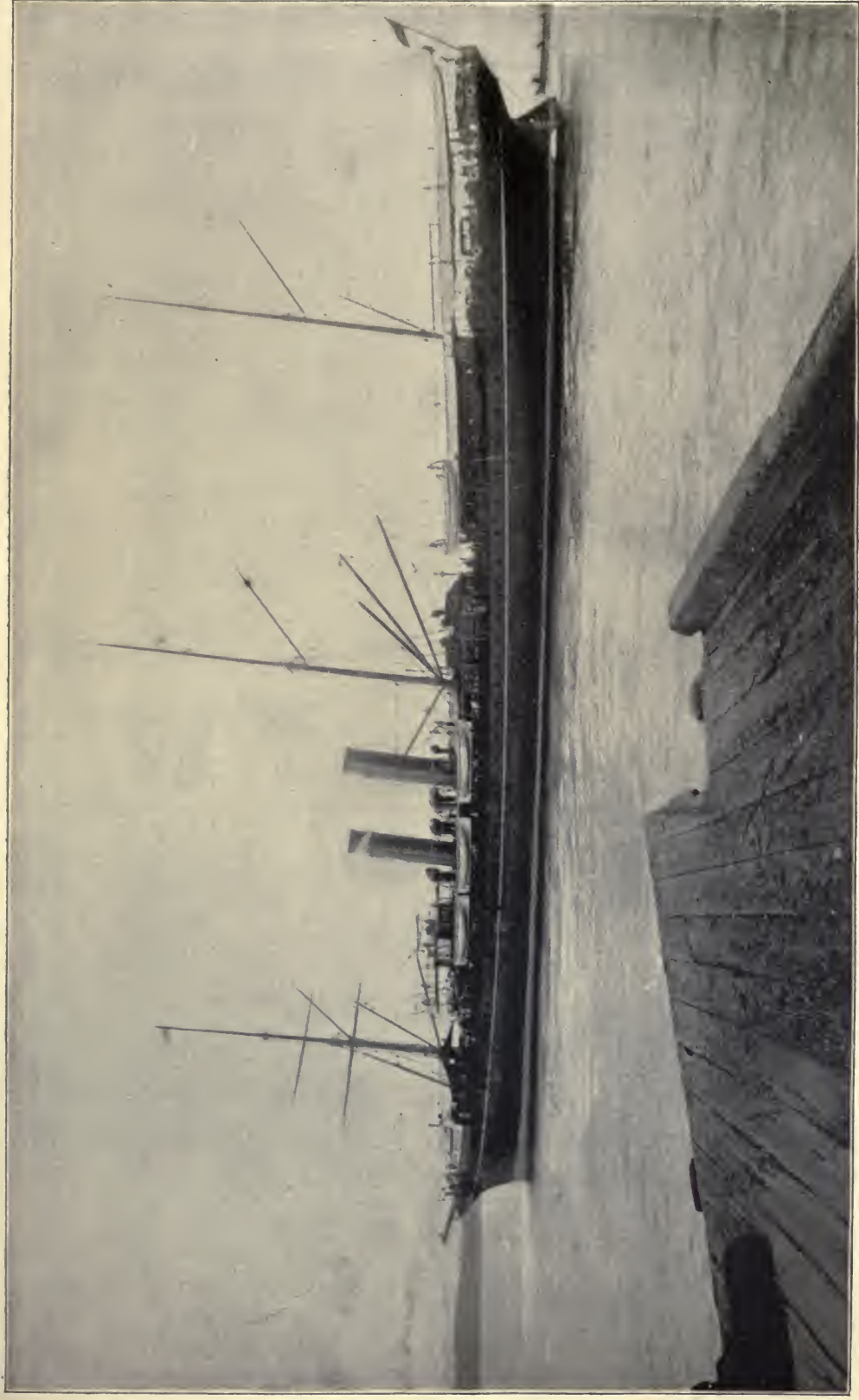
ROYAL MAIL STEAM PACKET COMPANY'S STEAMSHIP "ORINOCO."