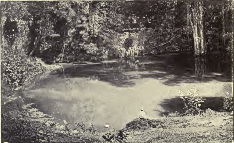
RIVERHEAD, STEWART TOWN.

although there is even here a choice, as cases with scanty expectoration are most benefited in those districts where there is considerable moisture in the atmosphere, while those in which there is free or even profuse secretion are more quickly relieved in the neighbourhood of Kingston where the humidity of the air is at a minimum. Patients with nervous prostration receive more benefit from a stay near the seashore than they do in the uplands, and the same is in a measure true of dyspeptics, especially of those in whom the gastric trouble is partly nervous in its origin. Sufferers from Bright's disease do well, as a rule, in all parts of the Island except possibly in the most elevated regions where in the winter months the thermometer is apt to fall a little too low after the sun goes down, and where, especially on the northern slope, there is at times a little too much rain to be agreeable. The same remarks will apply also in the case of