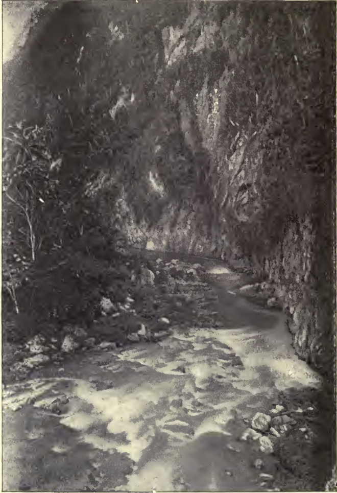
IN BOG WALK, RIO COBRE RIVER.

following day, failing to find either sufficient food or fresh water, he sailed eastward to another harbour, since known as Don Christopher's Cove. His forlorn and desperate condition is thus described by his greatest historian: "His ships, reduced to mere wrecks, could no longer keep the sea, and were ready to sink even in port. He ordered them, therefore, to be run aground within a bow-shot