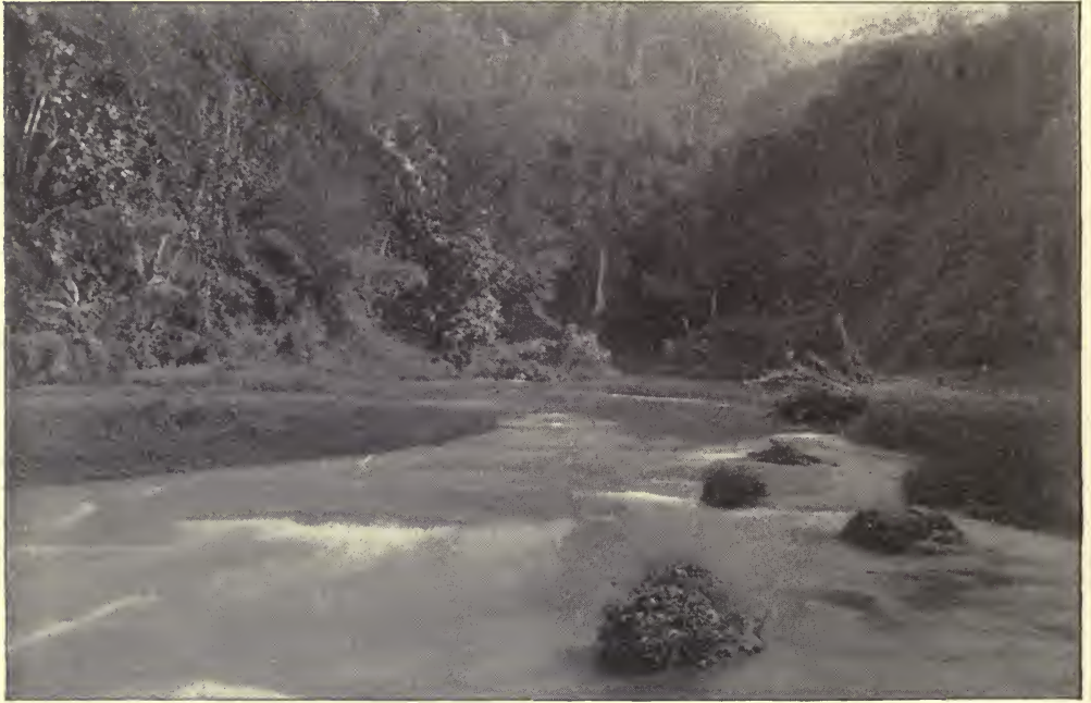
RIO COBRE RIVER.

Thus ended the first visit of Columbus to Jamaica; his second visit was paid under very different circumstances.