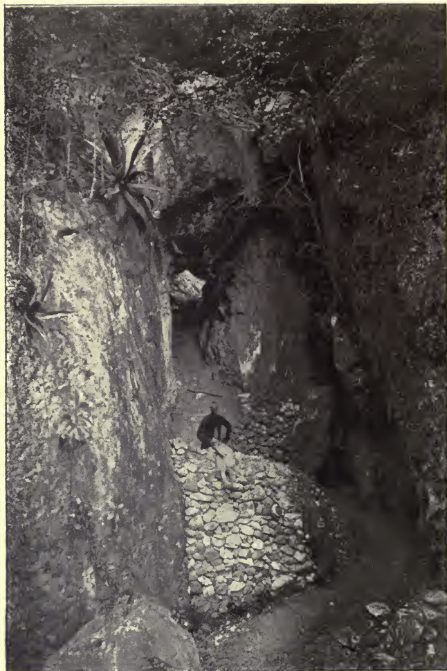
ROADWAY, CANE RIVER.

the island, while the exciting life of the pirate, or privateer, increased the wealth of Kingston and of Port Royal. Existence, amid the stirring scenes and thrilling incidents of this sort, could surely be neither dull nor uneventful. The space, however, at our disposal compels us to hurry over this period thus briefly and to pass on to the great event which influenced Jamaica more even than war, hurricane or legislative squabbling could do; we refer to the Agitation