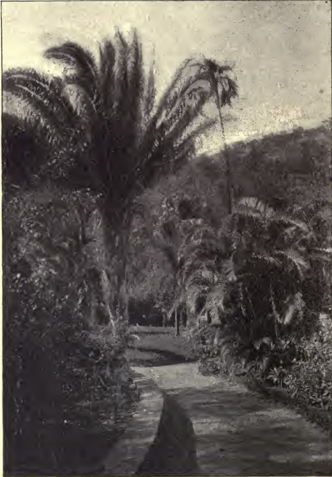
PALMS IN CASTLETON GARDENS.

But all of these are exceedingly practical creatures, and owing no doubt to the lack of brilliant-hued winged insect life which skims across the surface of the