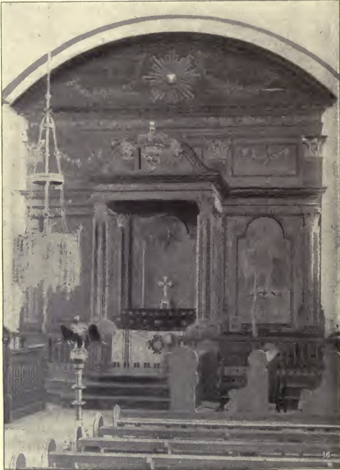
THE ALTAR, PARISH CHURCH, KINGSTON.

produce nothing but discontent and rebellion." Thus on the 1st of August, 1834, slavery ceased and the apprenticeship system commenced. Pecuniary compensation, amounting to £5,853,975, was paid to Jamaica owners in consideration of the manumission of 255,290 slaves, while 55,780 slaves, consisting of children, old people and runaways, were excluded from the compensation. The apprenticeship system was not allowed to run its allotted time, for in