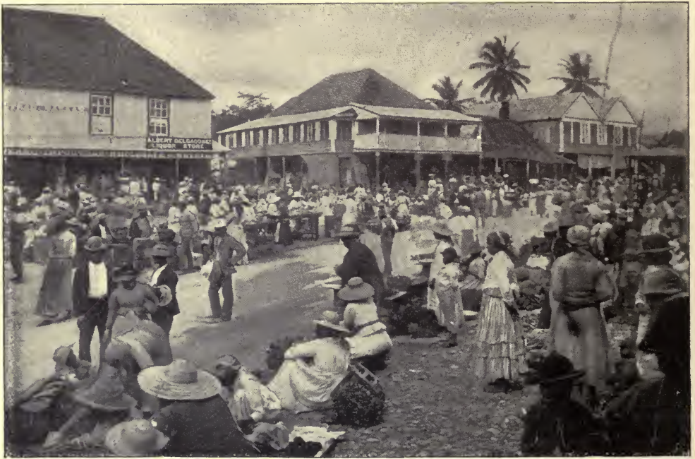
LINSTAAD MARKET PLACE.

The acreage of Jamaica consists in all of 3,692,587 acres. Of this in round figures 3,000,000 acres are available for cultivation of various kinds, the cultivation varying with the elevation above the sea-level of the latter number of acres, and nearly two-thirds, as shown by the returns of the revenue department, are in the possession of individuals or trusts. Thus there is room for fresh enterprise and increased colonisation.