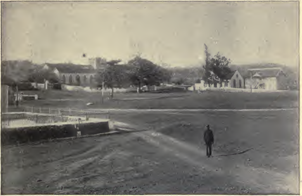
THE SQUARE, MANDEVILLE.

The population of Jamaica, according to the census of 1891, is 639,491, an increase of about 60,000 since the census of 1881, and of 130,000 since that of 1871. The capital and chief city is Kingston, the largest and most important, as well as the healthiest, seaport town of the British West Indies. It is a city of 48,500 inhabitants, situated on gently sloping ground on the shores of a large and nearly landlocked harbour. The land on which the city lies is a gravel bed, and as it has a slope to the sea of about ninety feet to the mile the natural drainage is excellent. The water supply is drawn from two rivers at a distance of several miles from the city, and as regards freedom from contamination is above reproach.