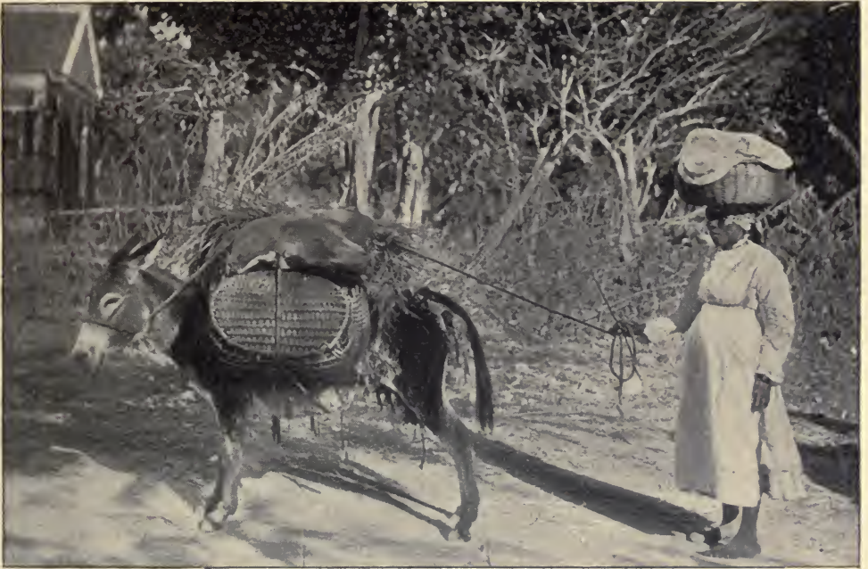
GOING TO MARKET, JAMAICA.

yielding plants will grow in many places now apparently uncultivable. As a winter vegetable garden for New York and other large American cities, Jamaica has hardly been seriously experimented on. While nature has done much, man has done little. Sugar and rum, once almost the only commodities largely exported, have been in recent years left behind by bananas, and there is no reason why other fruit industries, many of them requiring less capital and involving less risk than bananas, should not hold prominent rank in foreign markets. Industry, care and personal supervision of work bring their reward in the rich soil of Jamaica to an extent not exceeded in any other agricultural country.