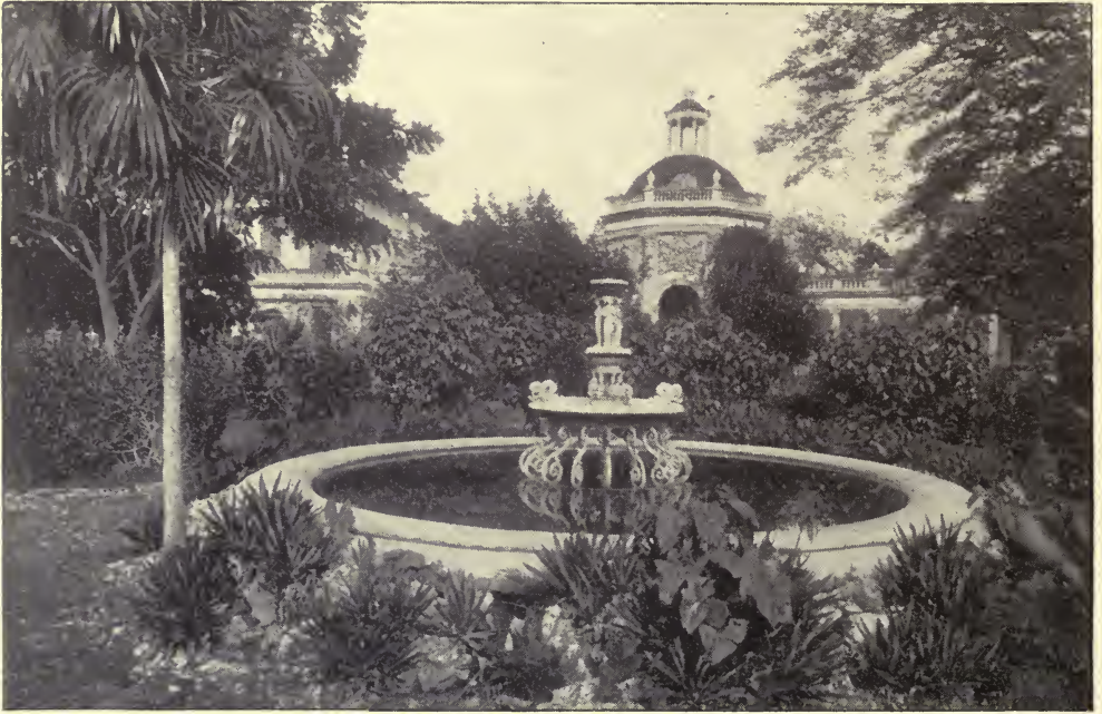
GARDENS, SPANISH TOWN.

Ridge throws out two large spurs that trend northward, and that in their turn, as above described, again shoot out cross ridges. Two of these converge at a height of 3,700 feet and fall in almost a sheer precipice of adamant rock 900 feet high into a river that roars along in the narrow gorge at their feet. The river is formed by the junction of two others that gush out from behind the ridges, and where they meet the eternal beat of the plunging waterfall has hollowed out a cauldron in the iron rock, which it keeps full of seething, but ice-cold water. Here you have the mysterious "Nanny's Pot." This spot can scarcely be surpassed on the face of the earth for wild and romantic beauty. On one hand the Stony River, the principal stream, which flows along