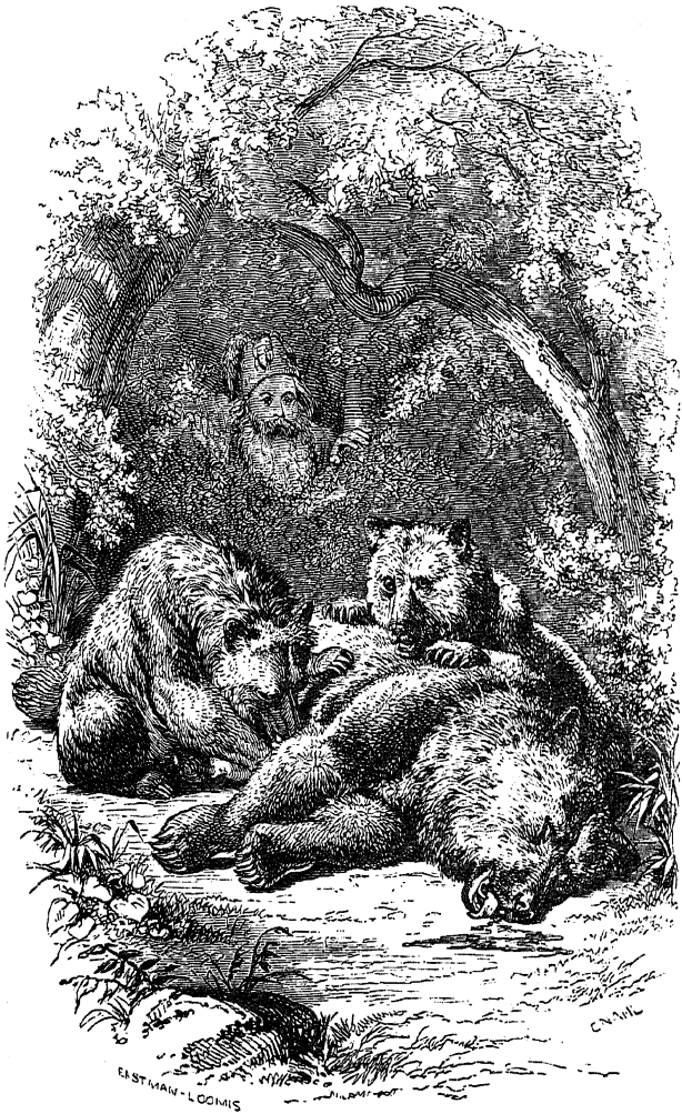
THE DEAD GRIZZLY AND HER CUBS.