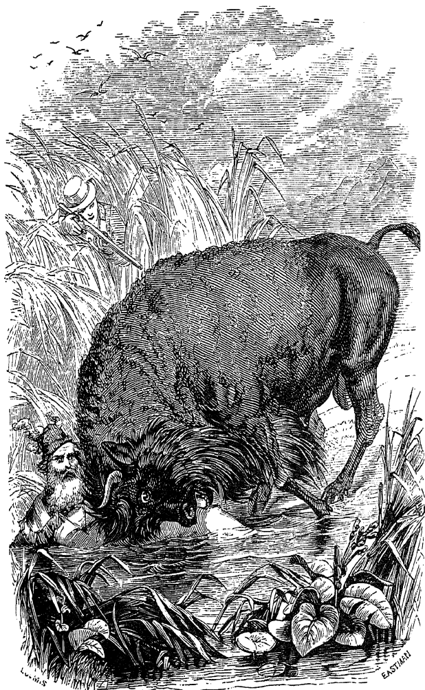
ADAMS AND THE BUFFALO.