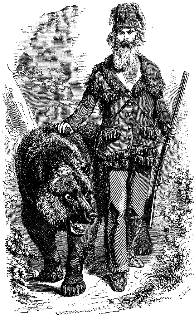
ADAMS AND BEN FRANKLIN.