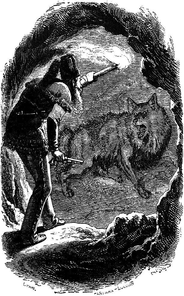
ADAMS AND THE WOLF.