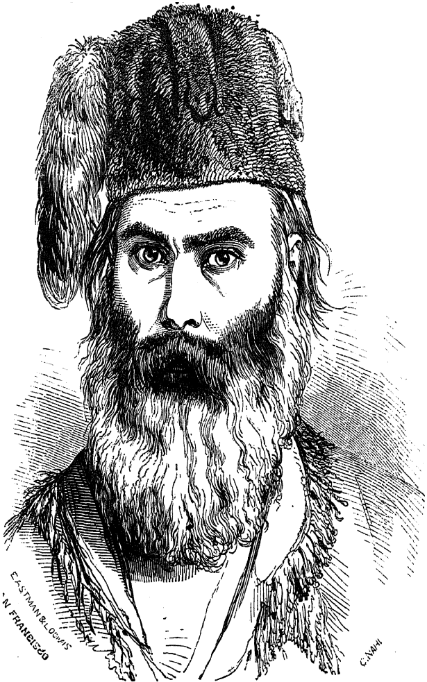
JAMES CAPEN ADAMS.