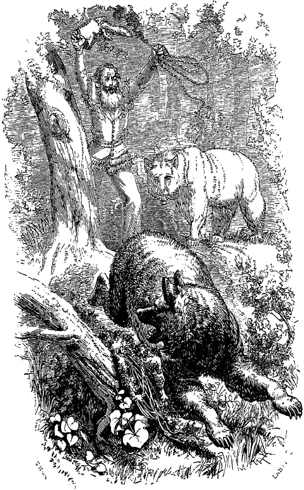
THE FRIGHTENED GRIZZLY.