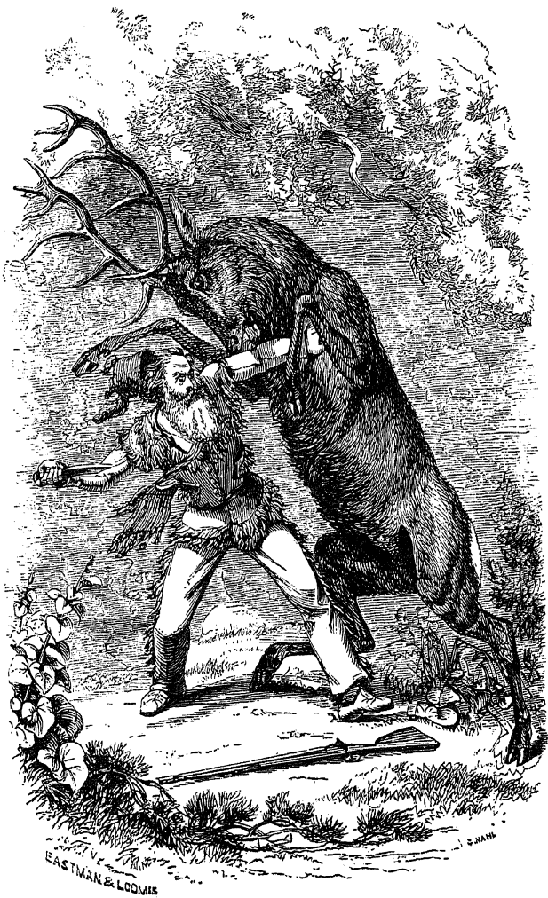
ADAMS AND THE ELK