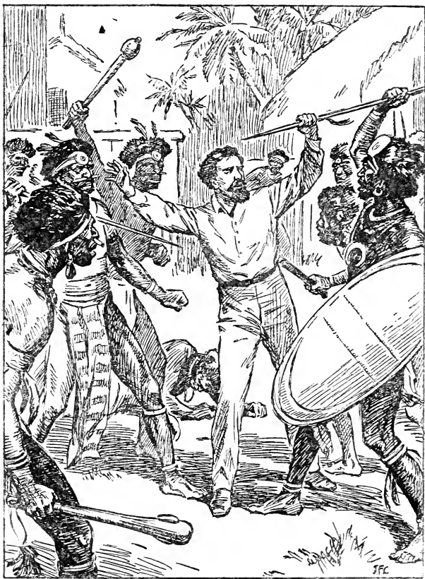
Stopping a fight.