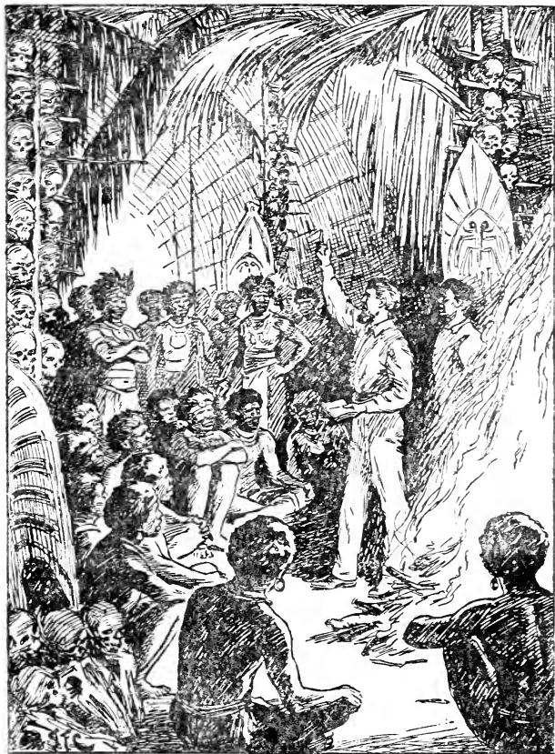
Preaching to cannibals in one of their temples.