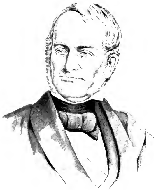
James G. Birney.