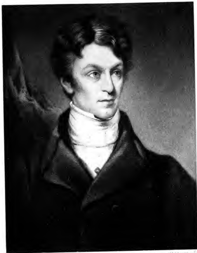
James Martineau 1847