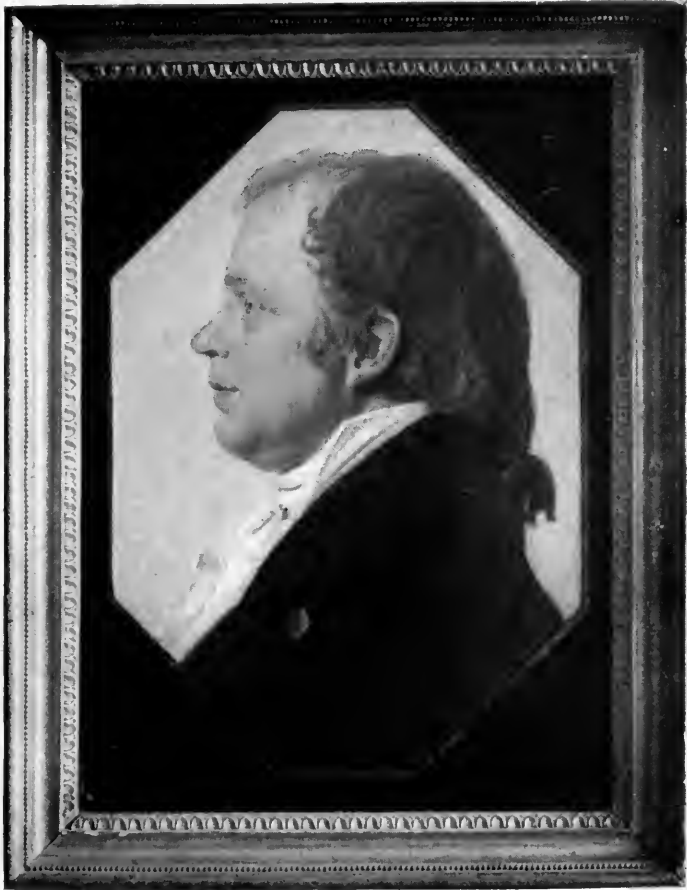
DR. JAMES McHENRY

Much reduced from painting owned by the heirs of Dr. James McHenry