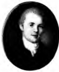
DR. JAMES McHENRY

Reproduced in original size from miniature owned by the heirs of Dr. James McHenry