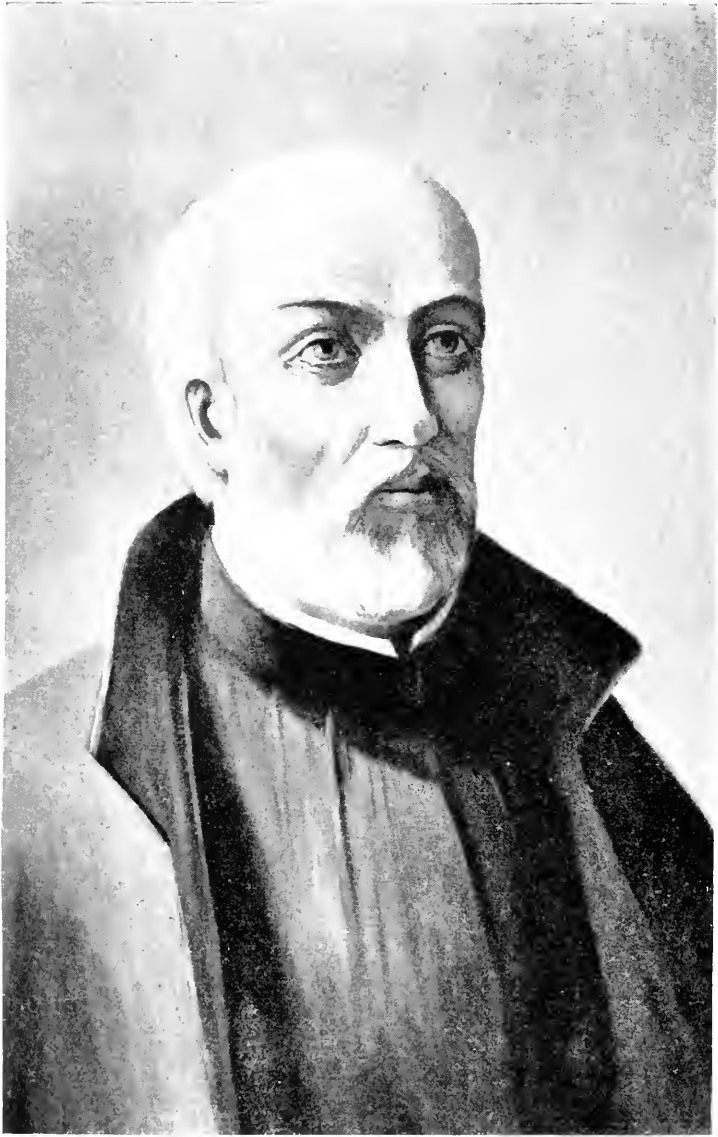
JEAN DE BRÉBEUF, S.J.