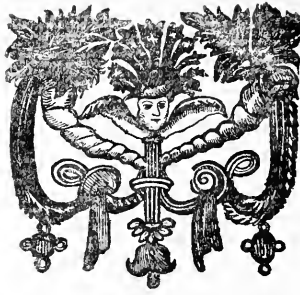
ILLUSTRATION TO VOL. XXX