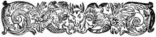
ILLUSTRATION TO VOL. XXXVII