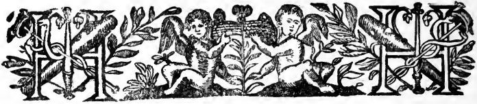
ILLUSTRATION TO VOL. LIII