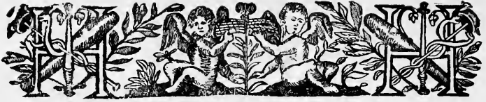
ILLUSTRATION TO VOL. LIII