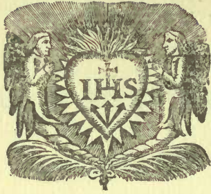
ILLUSTRATION TO VOL. LIV