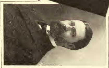
EDWIN R. A. SELIGMAN Columbia University