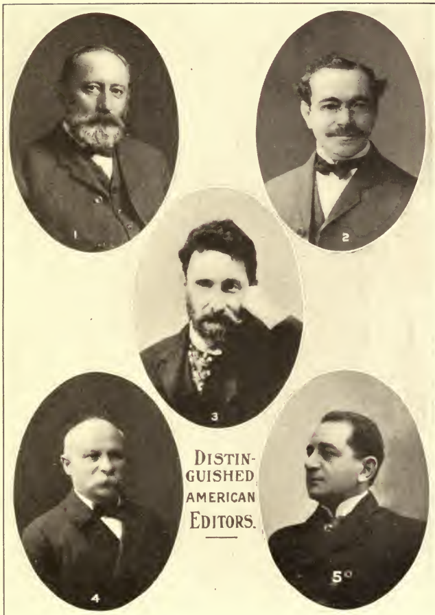
1. FABIAN FRANKLIN Baltimore News