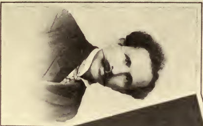
MORRIS ROSENFELD The Yiddish Poet