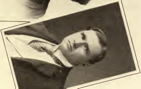
WALTER DAMROSCH Conductor