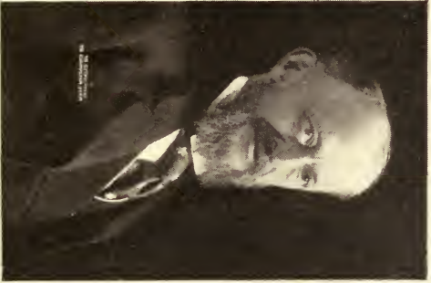
OSCAR S. STRAUS