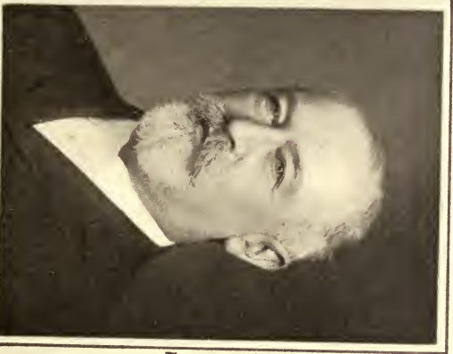
JACOB H. SCHIFF