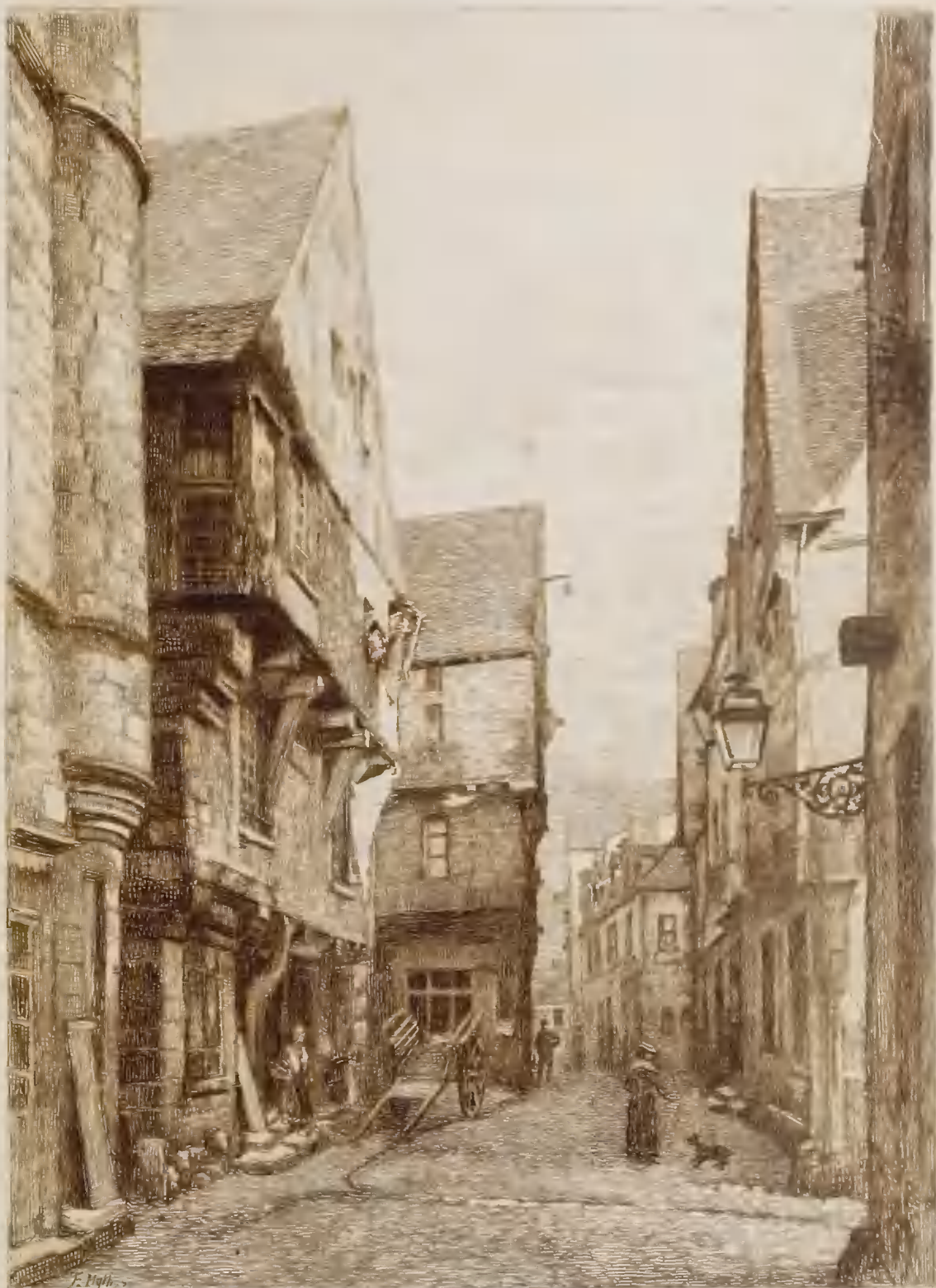
STREET IN CHINON