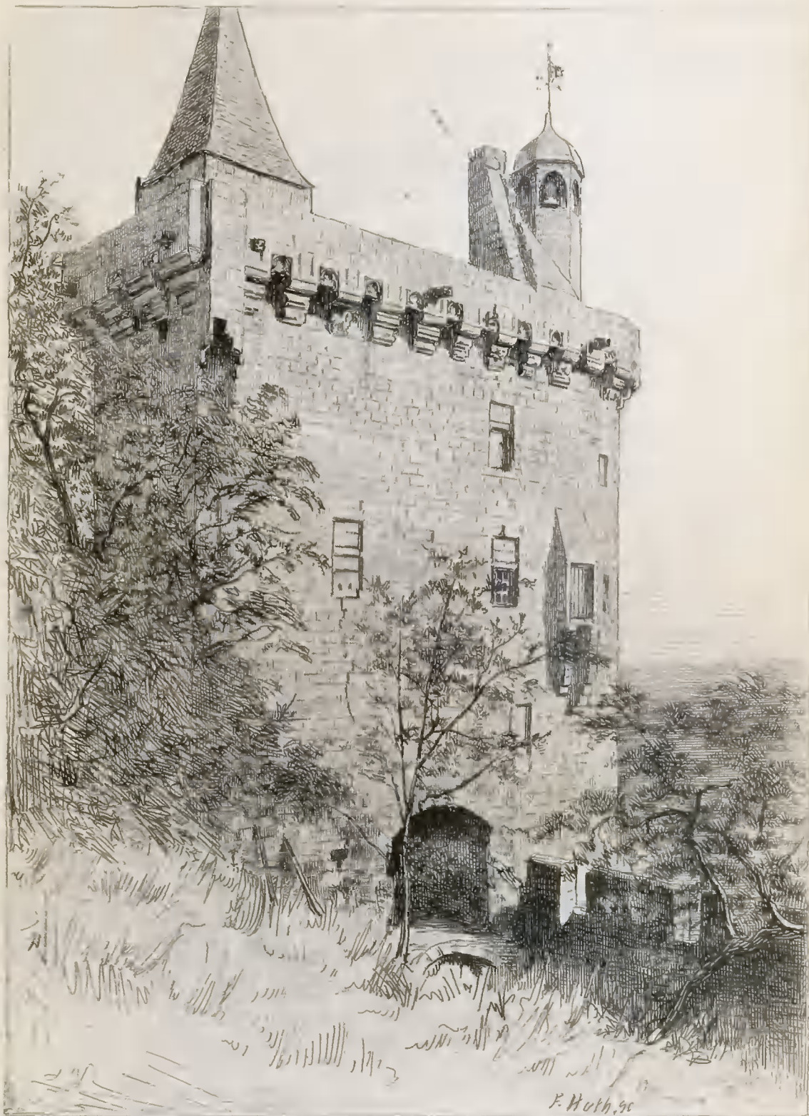
TOUR D'HORLOGE - CHINON.