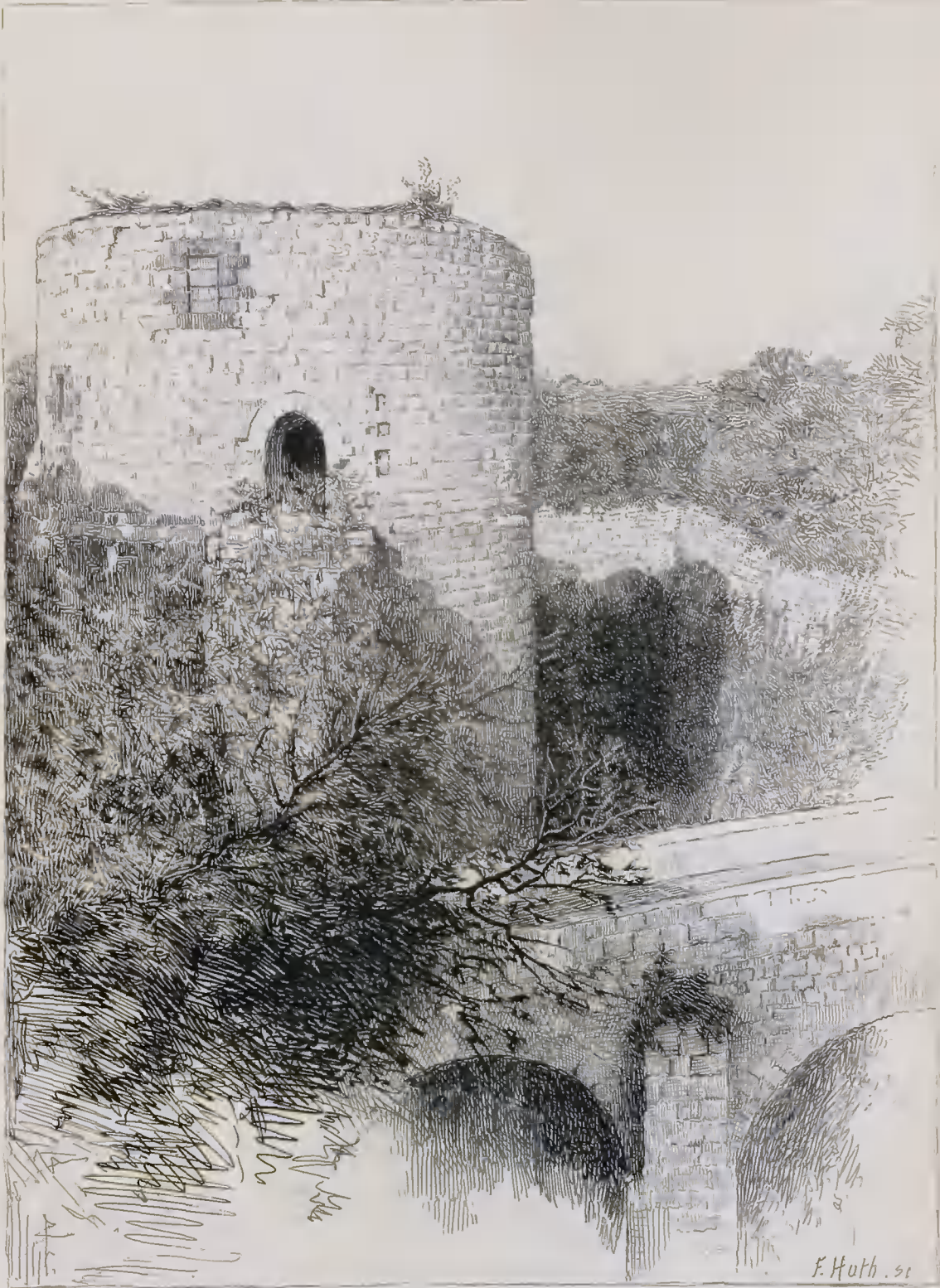
TOUR COUDRAY - CHINON.