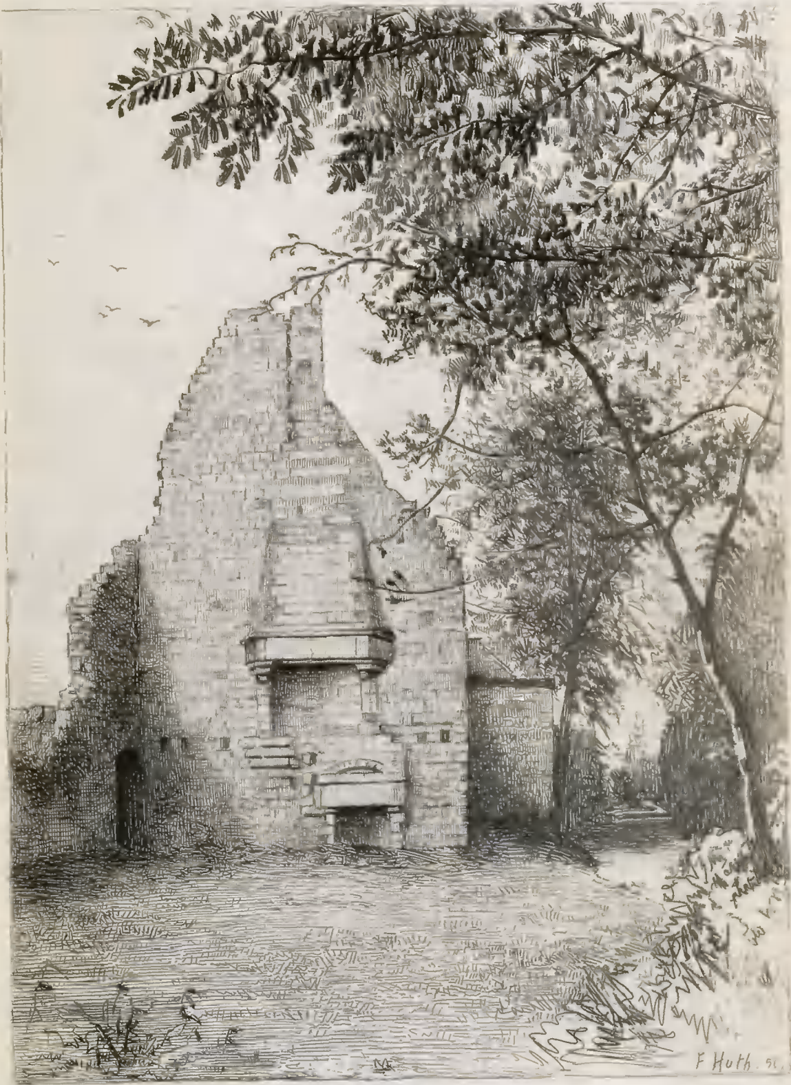
HALL OF AUDIENCE—CHINON