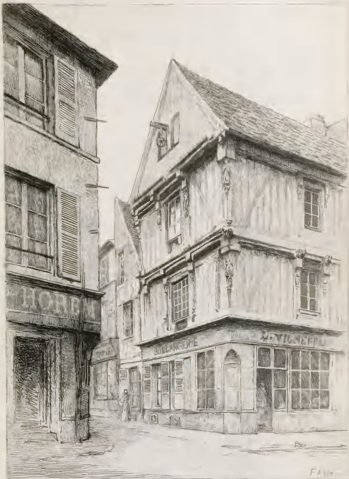
XV CENTURY HOUSE - COMPIÈGNE.