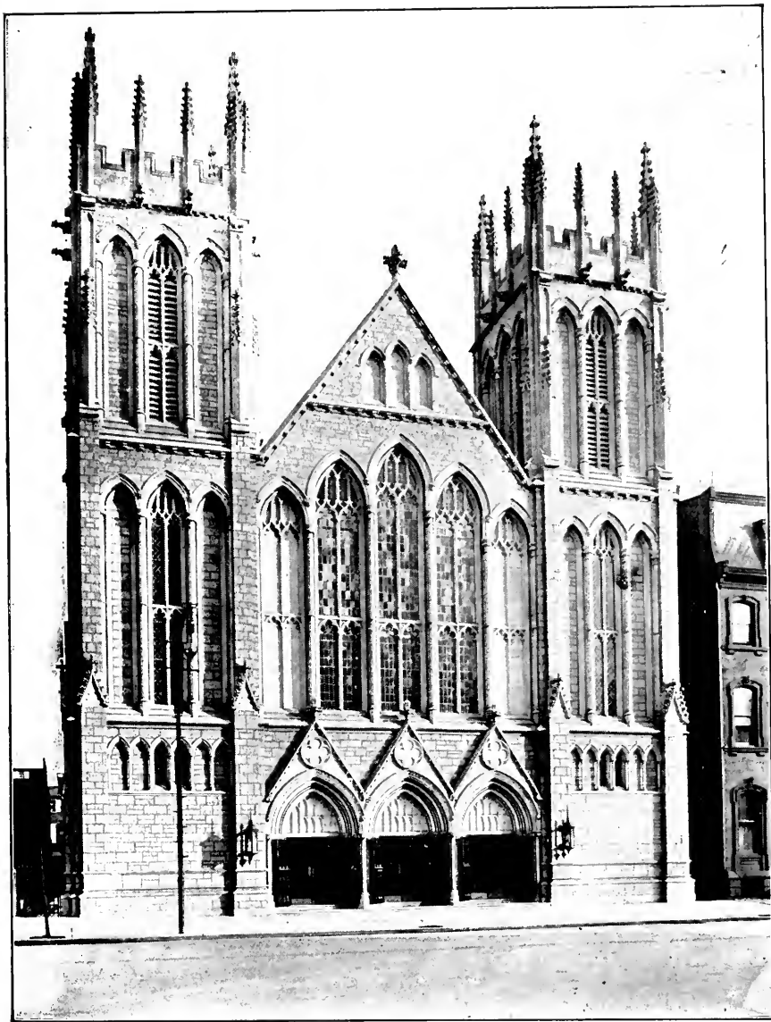
THE CHAMBERS-WYLIE MEMORIAL CHURCH.