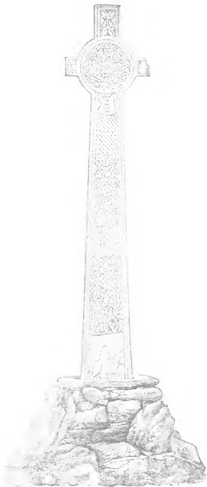
MACLEAN'S CROSS IONA, ARGYLSHIRE