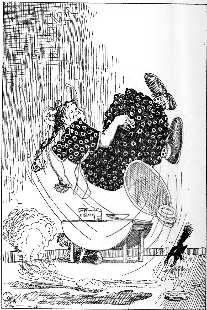
"She met the spilt pie unawares."