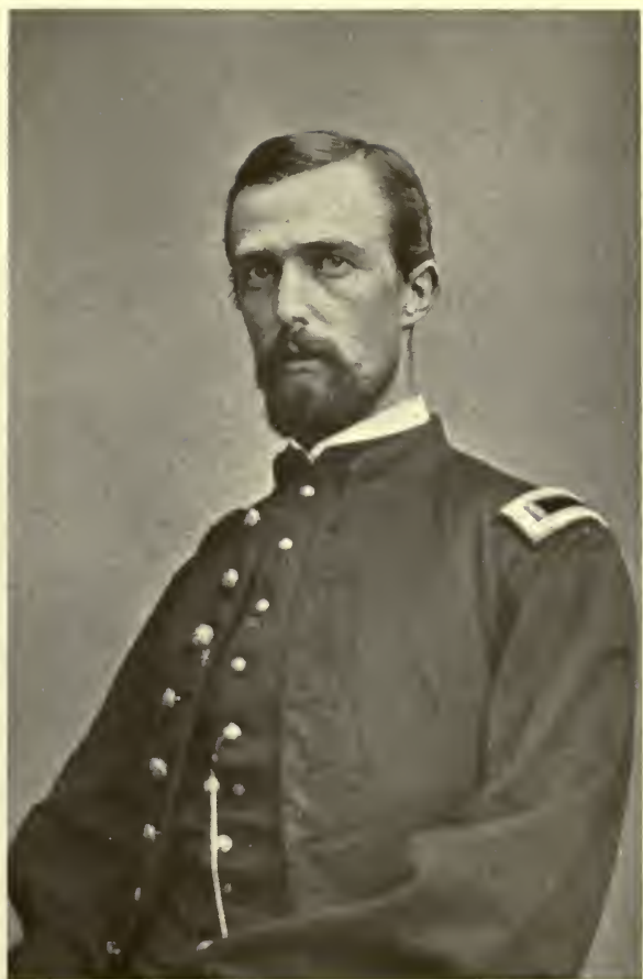
JOHN SHAW BILLINGS 1863—ÆT. 25