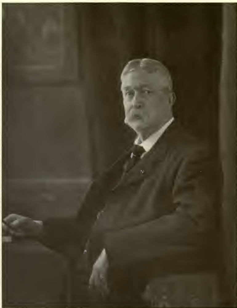
JOHN SHAW BILLINGS 1908—ÆT. 70