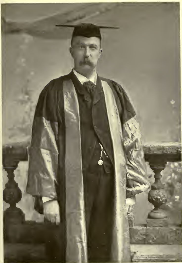
JOHN SHAW BILLINGS 1889—ÆT. 51