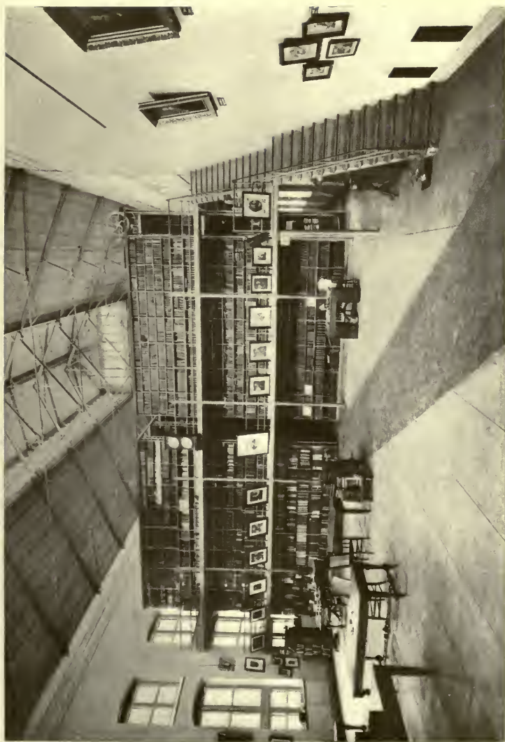
THE ARMY MEDICAL LIBRARY, WASHINGTON, D. C.