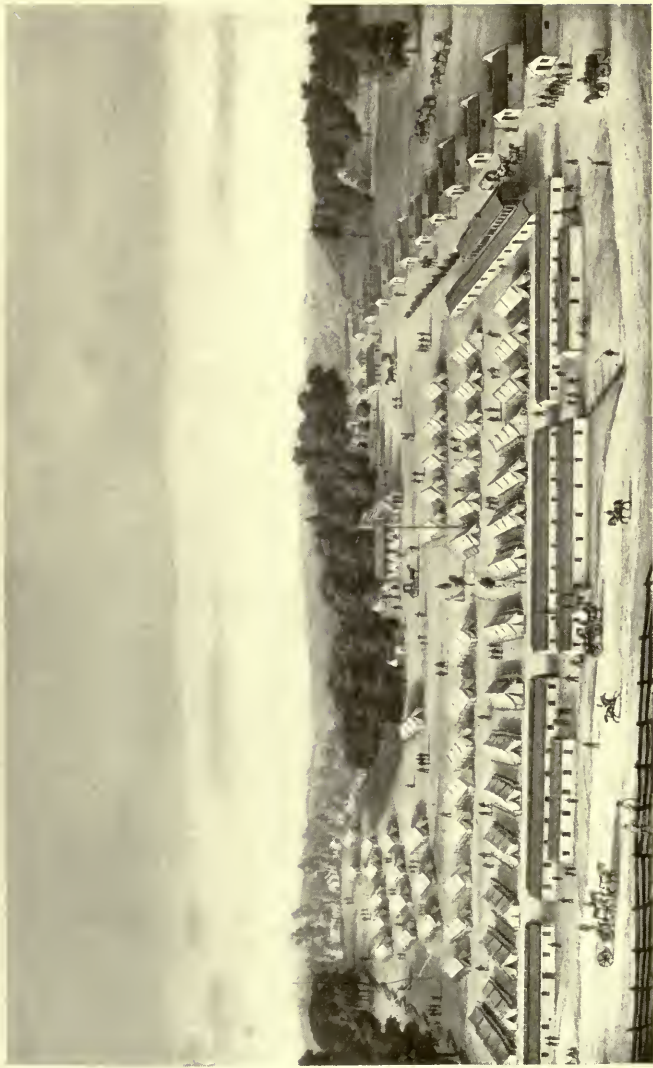
CLIFFEURE HOSPITAL, WASHINGTON, D. C.—1862