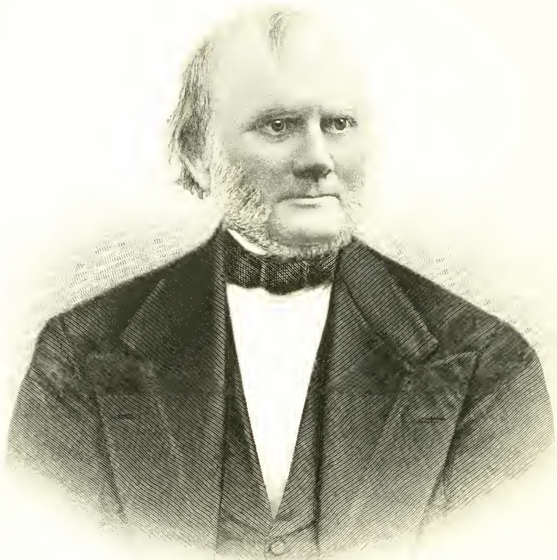
John Taylor Gilman.