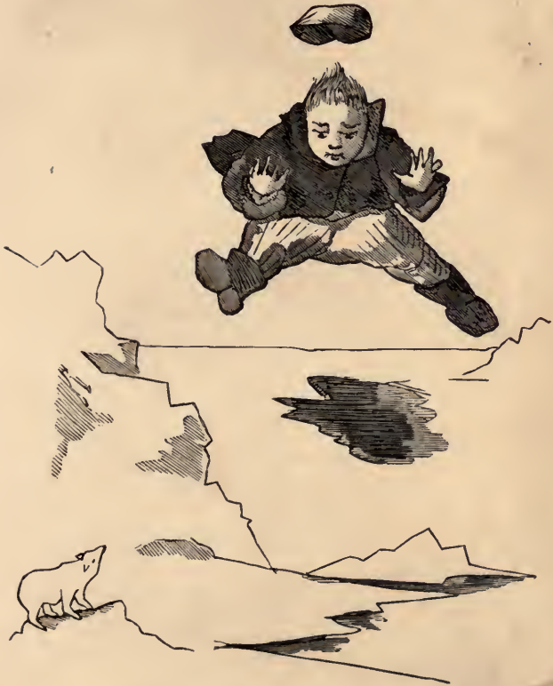
JOHN WHOPPER AT THE NORTH POLE.