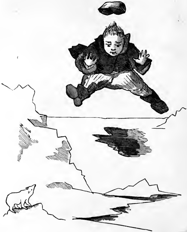
JOHN WHOPPER AT THE NORTH POLE.