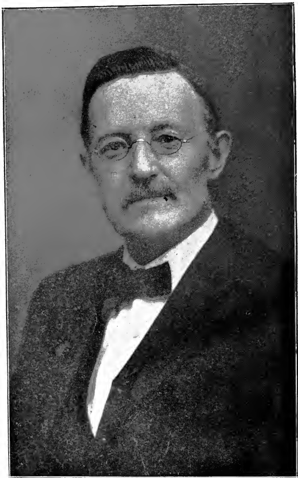
BISHOP COLLINS DENNY