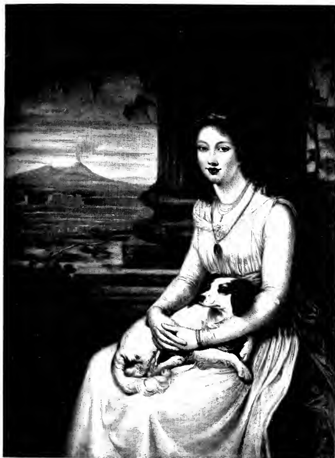
Elizabeth, Lady Holland.