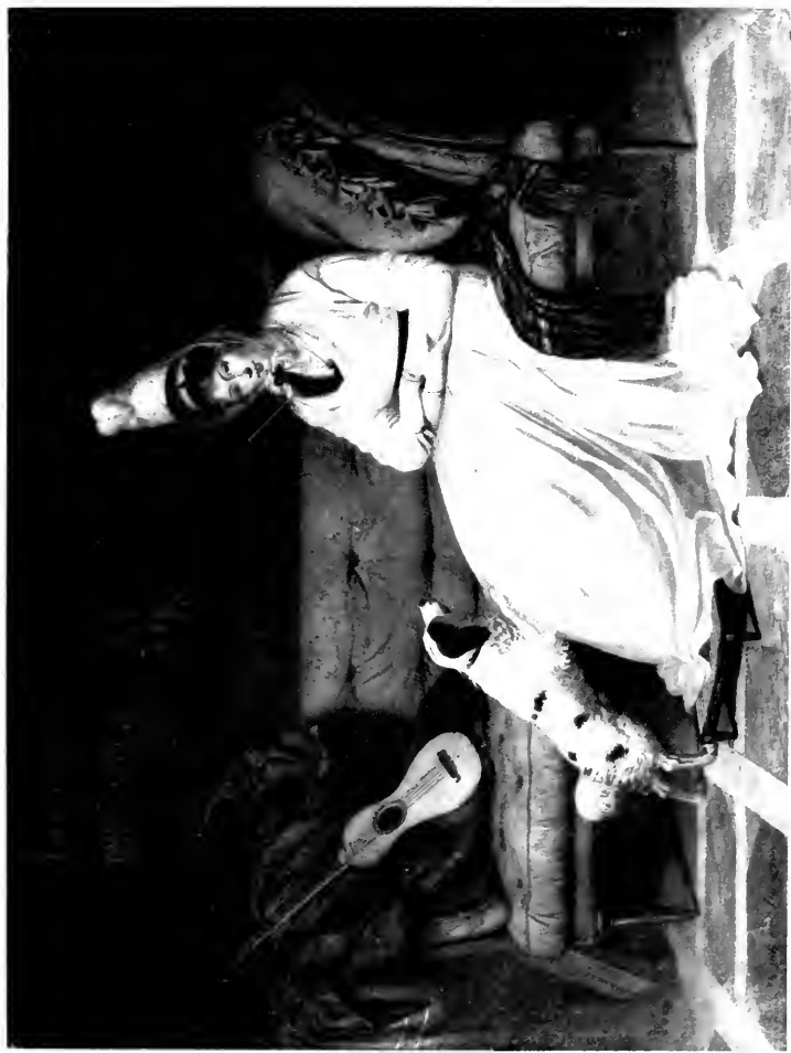
Elizabeth third Lady Holland 1795