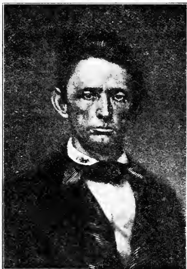
WILLIAM G. BROWNLOW Methodist Preacher, Editor, Governor and U. S. Senator Chairman committee calling famous convention.