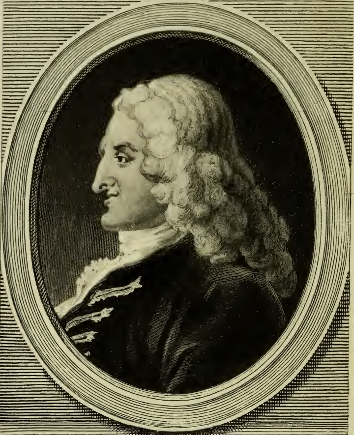
HENRY FIELDING, ESQ.