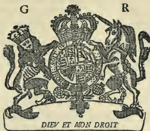
[Royal arms used in the session laws of May and July, 1715.]

A COPY of the printed Journals of the House of Representatives of his Majesty's Province of the Massachusetts-Bay in New England for the session which began at Boston on May 25, 1715, was given to Samuel Sewall by the printer, Bartholomew Green, on July 12, three weeks after the Governor had in angry mood prorogued that body. Stung by a slighting comment passed by Governor Dudley on their proceedings, the members of the House determined to print the full Journal of the session, as the best means of defending themselves. Thus began a practice of printing the Journals of the House which was continued in an almost unbroken series till the Revolutionary War. The convenience of having the record in such a form would alone have justified the publication; as time passed, the political advantages were also recognized, and the long controversies arising between the Governor and the House, or between the Council and the House, led to many papers, worthy to be called state papers, being spread upon the pages of the Journals. Such publications were intended more for the constituents of the House than for any effect they could produce upon those immediately engaged in the controversies; and, in the absence of an active press, the political questions received their discussion in messages, addresses, declarations, or the more formal proclamations, — the most final of all expressions of opinion.