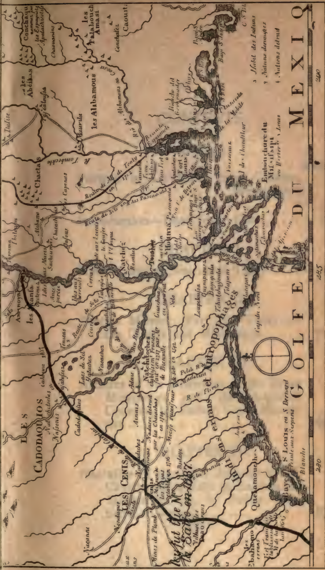
Adapted from the map of Guillaume Déisle (d. 1728), published in Paris, 1718.