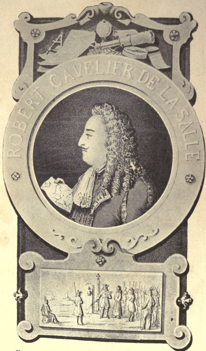
From a portrait in Gravier's "Découvertes de la Salle."