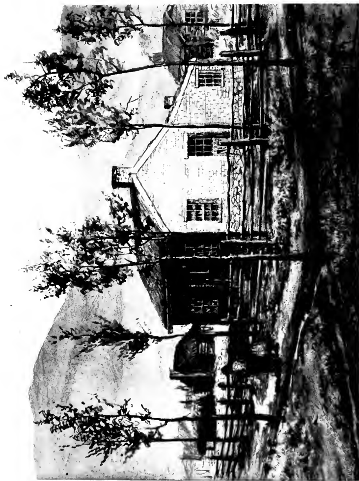
HOUSE WHERE THE FIRST SUNDAY SCHOOL WAS HELD, SALT LAKE CITY, UTAH, DECEMBER 9, 1849.