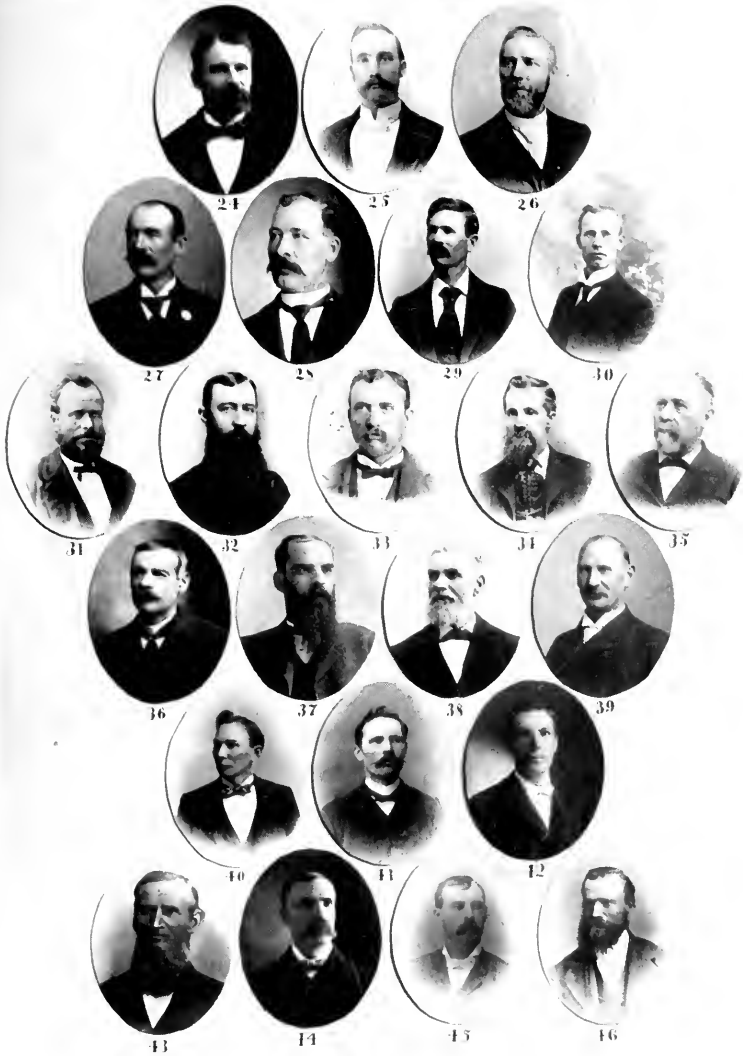
STAKE SUNDAY SCHOOL SUPERINTENDENTS.