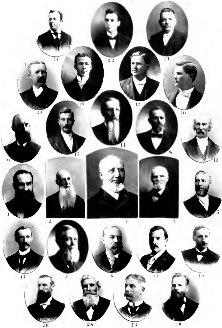
DESERET SUNDAY SCHOOL UNION BOARD AND AIDS.