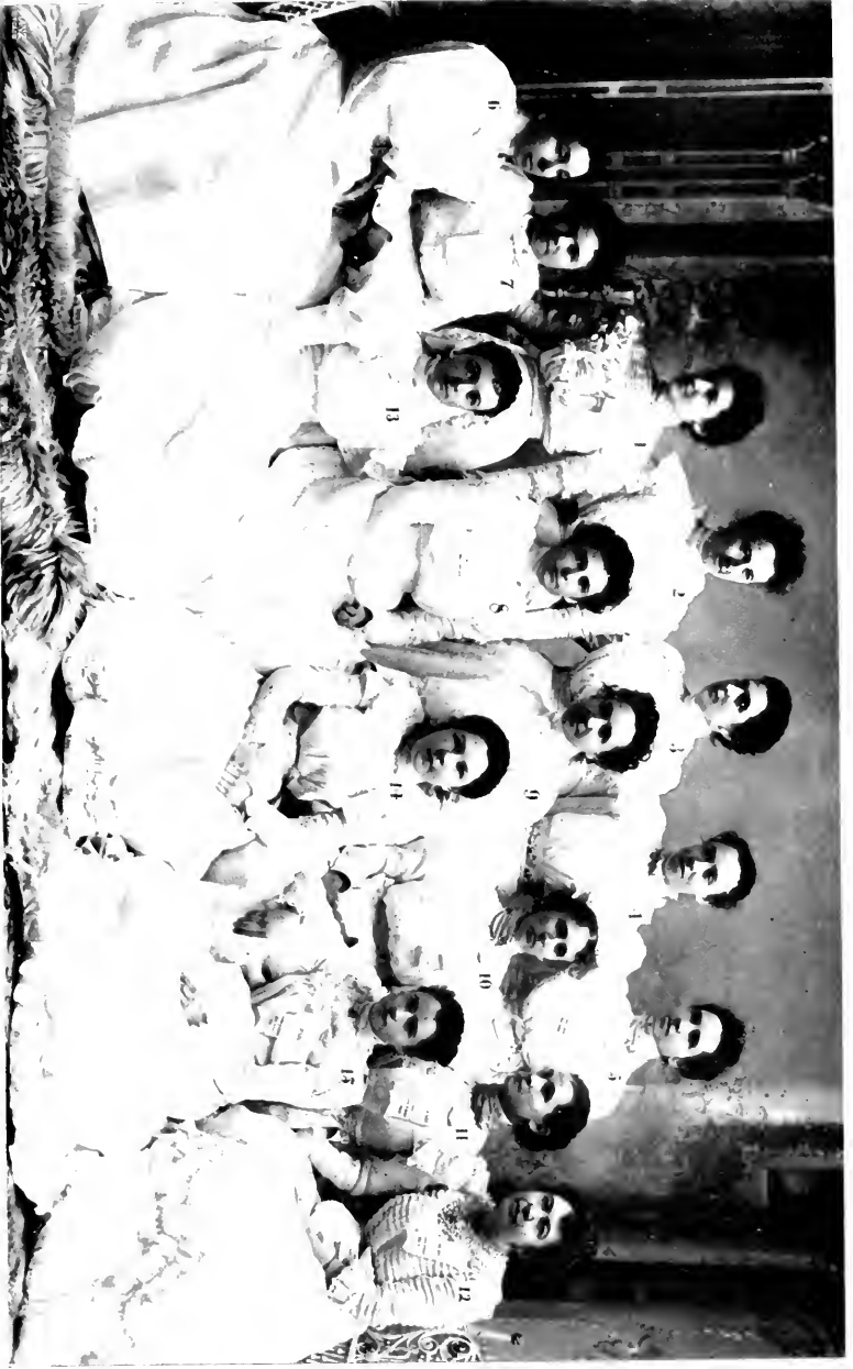
DAUGHTERS OF MEMBERS OF THE FIRST SUNDAY SCHOOL.