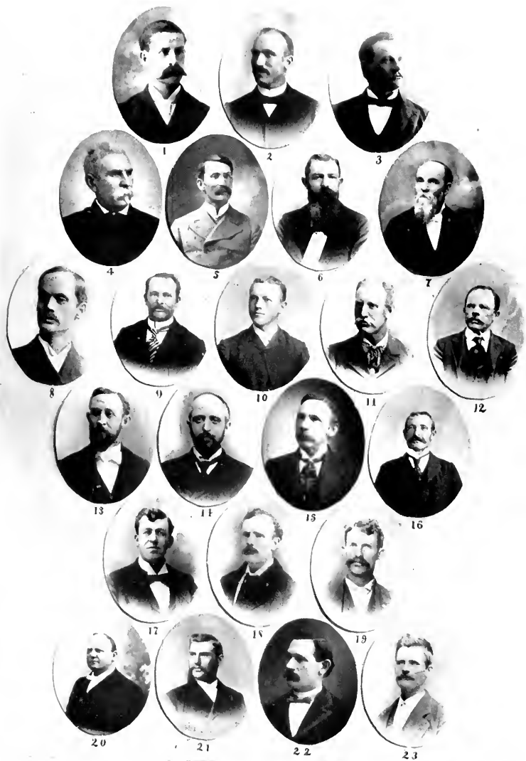
STAKE SUNDAY SCHOOL SUPERINTENDENTS.