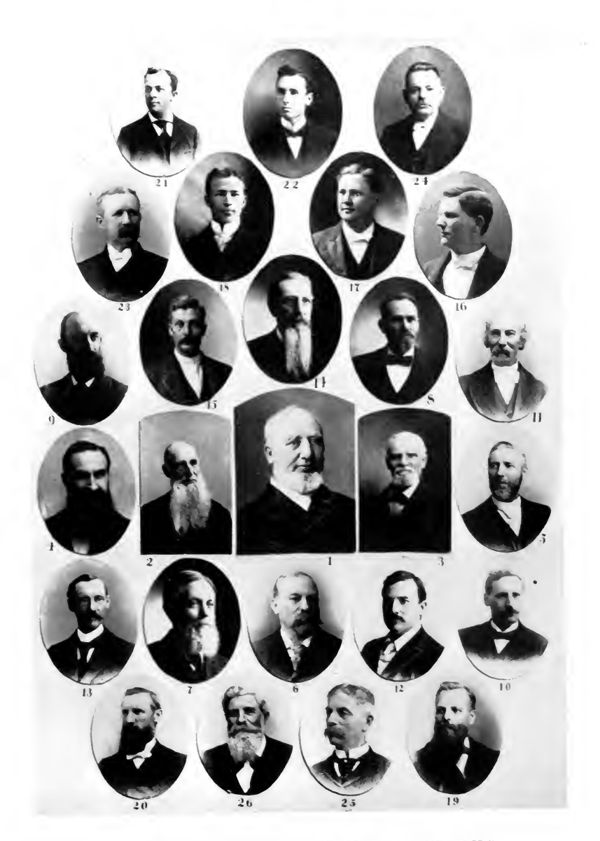
DESERET SUNDAY SCHOOL UNION BOARD AND AIDS.