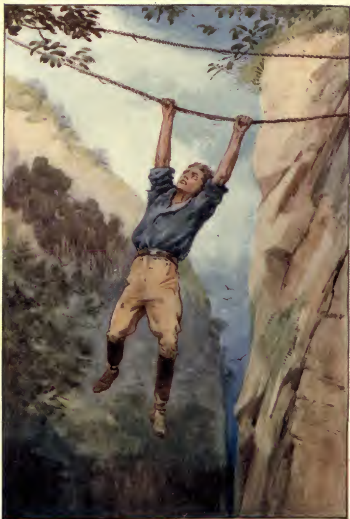
“With swimming brain . . . he worked his way along hand over hand.”