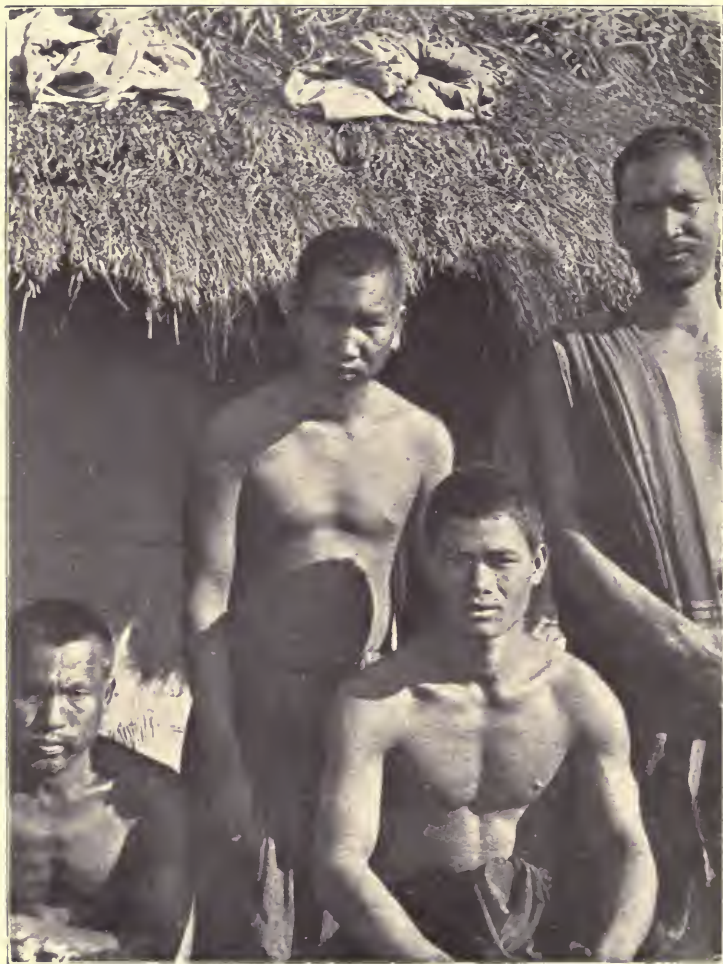
GROUP OF KACHÁRI MEN (Kamrup District).