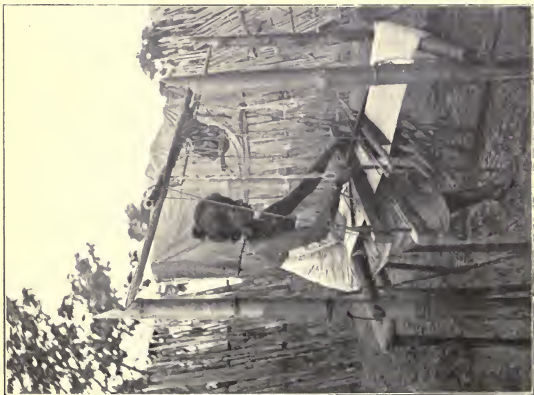
KACHARI WOMEN WEAVING (Kamrup).