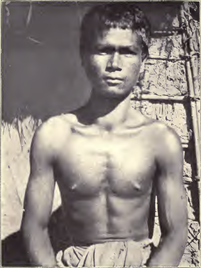
KACHÁRI MAN (Kamrup District).