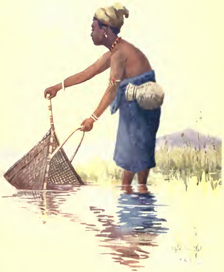
KACHARI GIRL FISHING