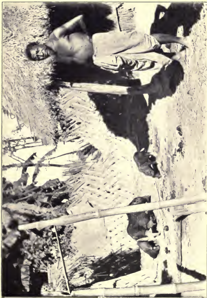
KACHARI VILLAGE INTERIOR (Kamrup District).