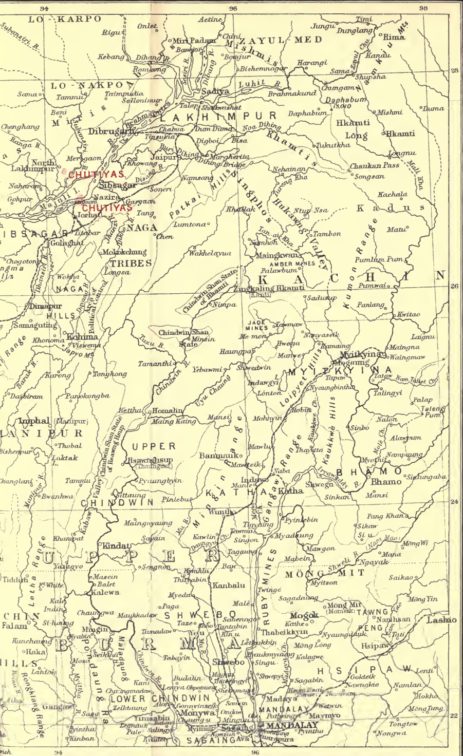
The Bodo Races coloured thus