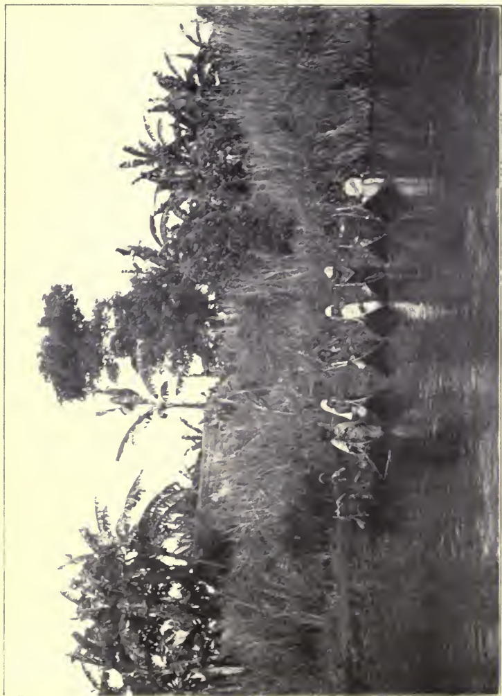
KACHÁRI WOMEN FISHING (Kamrup).