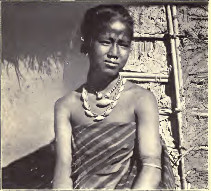
KACHÁRI GIRL. (Kamrup District).