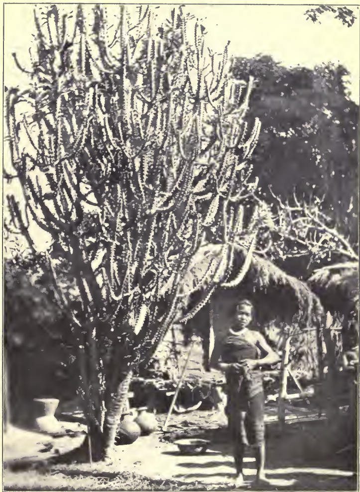
SIJU TREE ( Euphorbia splendens).