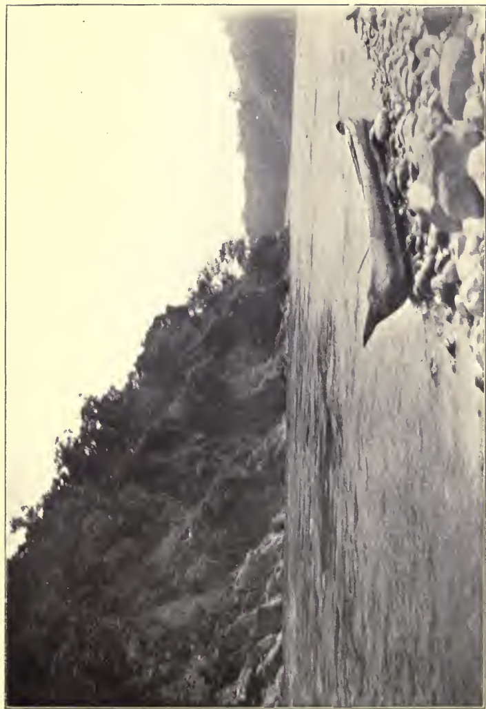
GORGE OF THE RIVER MANAS