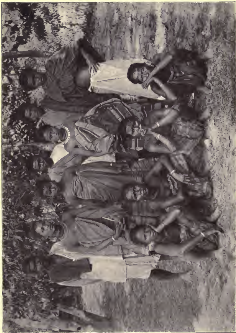
GROUP OF MECHEES (Goalpara District).