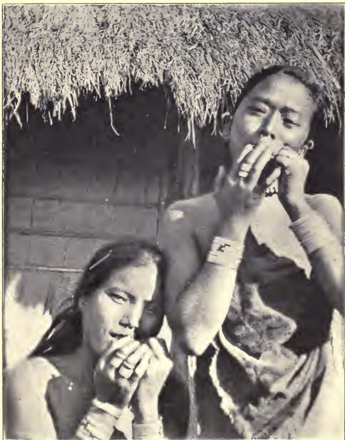
KACHARI GIRLS PLAYING JEW'S HARP (Gongina).