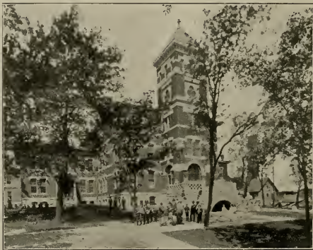
STATE SCHOOL FOR THE BLIND.