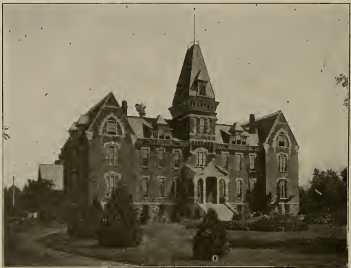
MAIN BUILDING, BOYS' INDUSTRIAL SCHOOL.

of Refuge" in what is now known as Madison square; Boston followed with a similar institution in 1826, and Philadelphia opened a reform school in 1828. In 1900 there were 56 such schools in the United States.