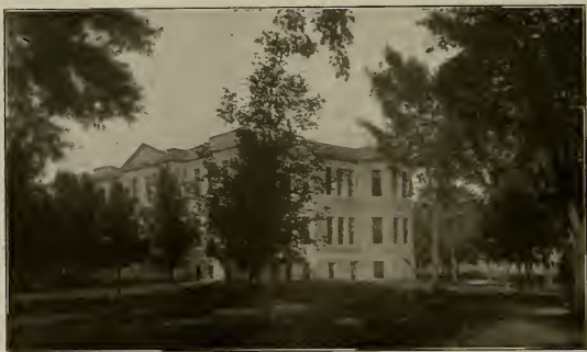
LIBRARY, BAKER UNIVERSITY.