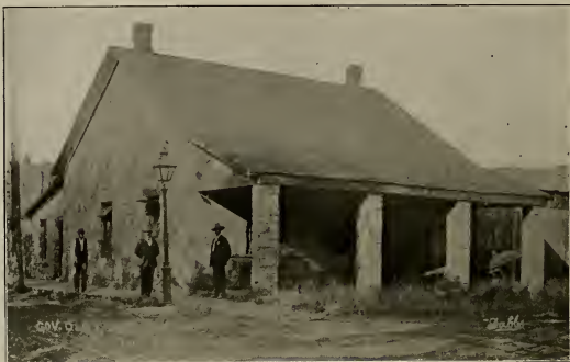
OLD GUARD HOUSE, FORT SCOTT.

to Fort Scott. A plaza or parade ground of about two acres was laid off in the center. On the northwest side of this plaza were the officers' quarters, consisting of four large double houses, each two stories high, with attic, while on the other sides were the quarters for the men, stables, hospital, guard-house, etc., and a well about 100 feet deep was