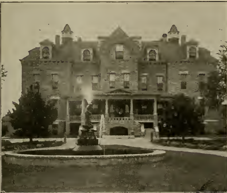
GIRLS' INDUSTRIAL SCHOOL, BELOIT.