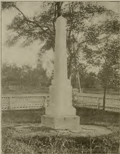
JOHN BROWN MONUMENT, OSAWATOMIE.

children. Eight of the twenty children died young, and of those who grew to maturity all were abolitionists. Five of his sons removed from Ohio to Kansas in 1854 and selected claims some 8 to 10 miles from Osawatimie, where they were joined by their father on Oct. 5,