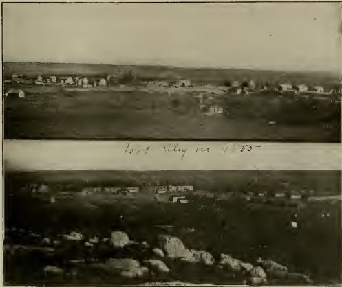
TWO VIEWS OF FORT RILEY.