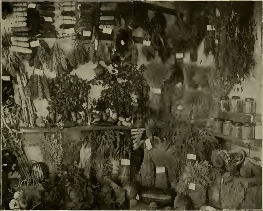
DISPLAY OF KANSAS AGRICULTURAL PRODUCTS.

of specimens of coal, building stone, fossils, gypsum, timber, etc., and made preparations for securing a collection of Kansas birds, noxious insects, and anything else that would be of interest to the agricultural industry in the state. Early in the year it was decided to hold a state fair at Leavenworth in September, but owing to the ravages of drought, grasshoppers and chinch-bugs as the season advanced, petitions from all parts of the state came to the board urging that the fair be abandoned,