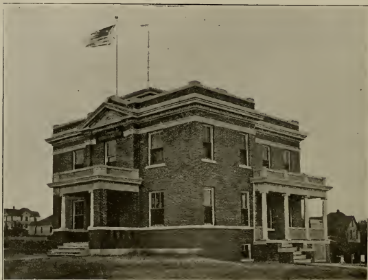
SIGNAL SERVICE ON WEATHER BUILDING, DODGE CITY.

The Dodge City of the present day is as orderly a city as any in the state. It has 3 banks, 2 weekly newspapers (the Globe-Republican and the Journal-Democrat), electric lights, waterworks, a fire department, a fine sewer system, good public schools, an opera house, and its international money order postoffice has one rural route that supplies daily