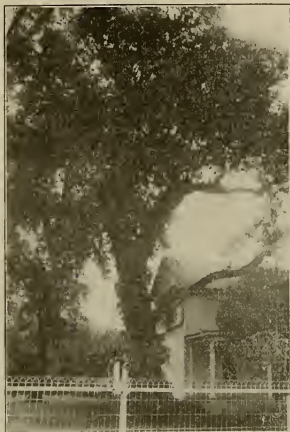
COUNCIL OAK AT COUNCIL GROVE.

There are a number of places and objects of historic interest about Council Grove. The most important of these are the Council Oak, the Custer Elm, Fremont Park, Belfry Hill, Sunrise Rock, the Hermit's Cave and the Padilla Monument.