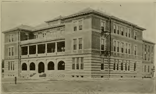
STATE HOSPITAL FOR EPILEPTICS, PARSONS.

Epileptic Hospital. —In the establishment of this institution the intention of the legislature was to make it a third insane asylum, in order to relieve the crowded condition of the hospitals at Topeka and Osawatamie. It was authorized by an act of the legislature of 1899, which provided that a site should be selected by a committee of the legislature—four senators and five representatives—and appropriated $100,000 for the erection of buildings. There was a spirited rivalry among a number of cities for the new hospital, and when the committee decided to locate it at Parsons, the citizens of Clay Center instituted injunction proceedings. The question was finally settled by the supreme court, which sustained the action of the committee, but the litigation delayed the erection of the buildings so much that the appropriation lapsed. The legislature of 1901 reappropriated the unexpended balance of the $100,000 so that the work could proceed without further delay.