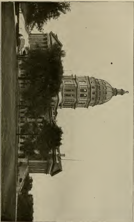
STATE CAPITOL, AT TOPEKA.