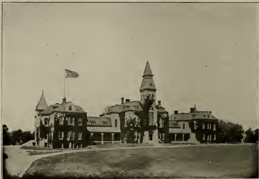
MAIN BUILDING, AGRICULTURAL COLLEGE.

scrip. The city of Manhattan, fearing the agricultural college would be consolidated with the university at Lawrence, gave $12,000 (the result of a bond election) toward the purchase.