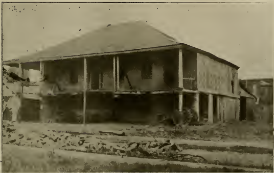
OLD GOVERNMENT BUILDING, FORT SCOTT