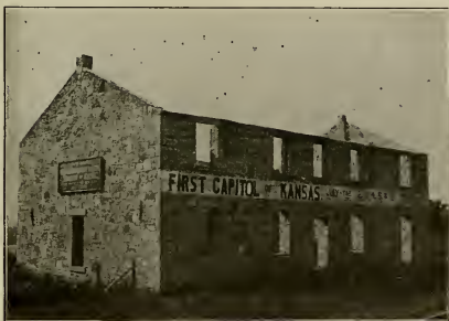
OLD CAPITOL AT PAWNEE.