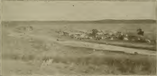
BEECHER'S ISLAND, SEPT. 17, 1905.

Arickaree, Battle of. —This action terminated the Indian wars on the plains. It was the most tragic of the many battles fought with the Indians in Kansas and Nebraska and took its name from the place where the battle which was fought—on a small island in the middle of the Arickaree, a branch of the Republican river. This island is now included in the state of Colorado, near the west line of what is now Cheyenne county, Kan.