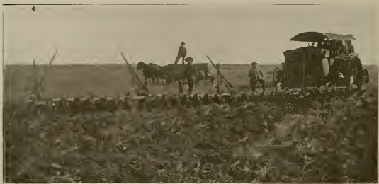
STEAM PLOW IN ACTION.

Board of Agriculture the yield and methods of culture. These reports were a new and surprising revelation and showed that western Kansas, through to the Colorado line, was bound to be adapted to successful wheat growing, many yields being reported at from 30 to 40 bushels an acre without irrigation. Another crop that sprung into prominence at this time was alfalfa. In the spring of 1891 farmers in all parts of the state who had been successful growing alfalfa without irrigation were asked to report upon their manner of preparing the soil and seeding it, the acreage they had in alfalfa, its value for hay, pasture and seed. These reports indicated that it was the most profitable crop that could be grown in Western Kansas, and had revolutionized farming in that section.