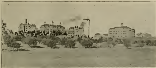
STATE HOME FOR FEEBLE-MINDED.

The board of trustees were authorized to take possession of the first state university building at Lawrence for the temporary use of