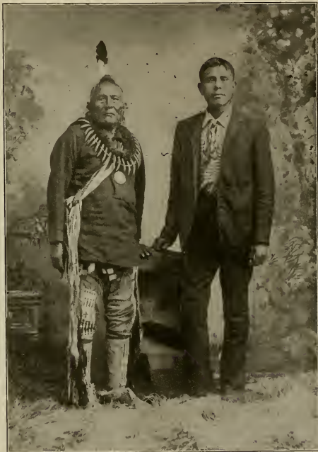
FULL-BLOOD PAWNEE INDIANS—FATHER AND SON.

means slave. As it was from this tribe that the Algonquian tribes about the great lakes obtained their slaves, some writers maintain that the word Pawnee is equivalent to the word slave, and that the tribal name resulted from the fact that so many members of it were subjected to a