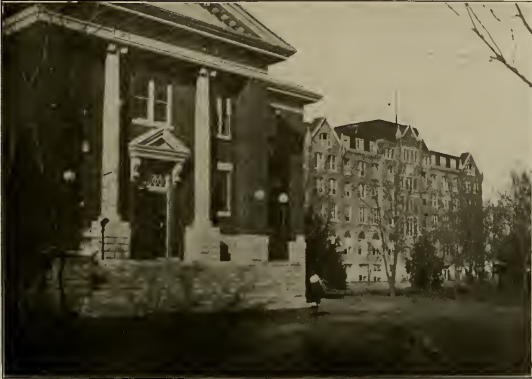
LIBRARY AND MAIN BUILDING, BETHANY COLLEGE.

paratory, normal, commercial, collegiate, a model school, art department and a conservatory that has gained a wide reputation throughout the state.