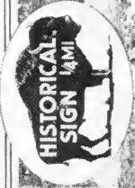
THIS HISTORICAL MARKER FOR DODGE CITY IS ONE MILE WEST OF THE CITY ON US-508. INSET SHOWS ONE OF THE APPROACH SIGNS.

ERECTED BY KANSAS HISTORICAL SOCIETY AND STATE HIGHWAY COMMISSION