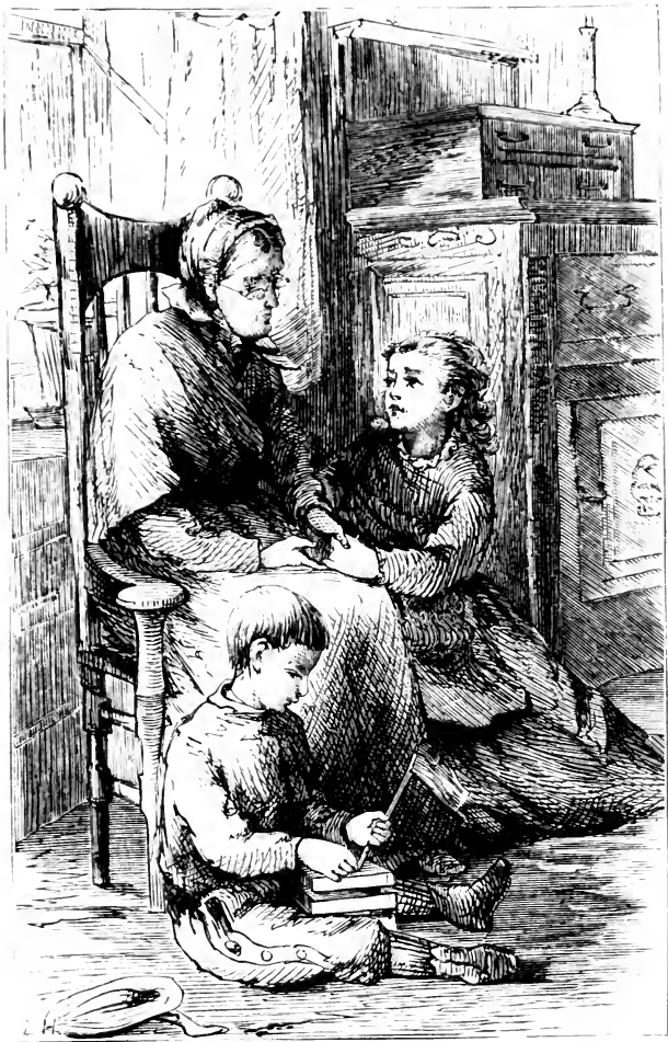
THE COMFORTER. — Page 203.