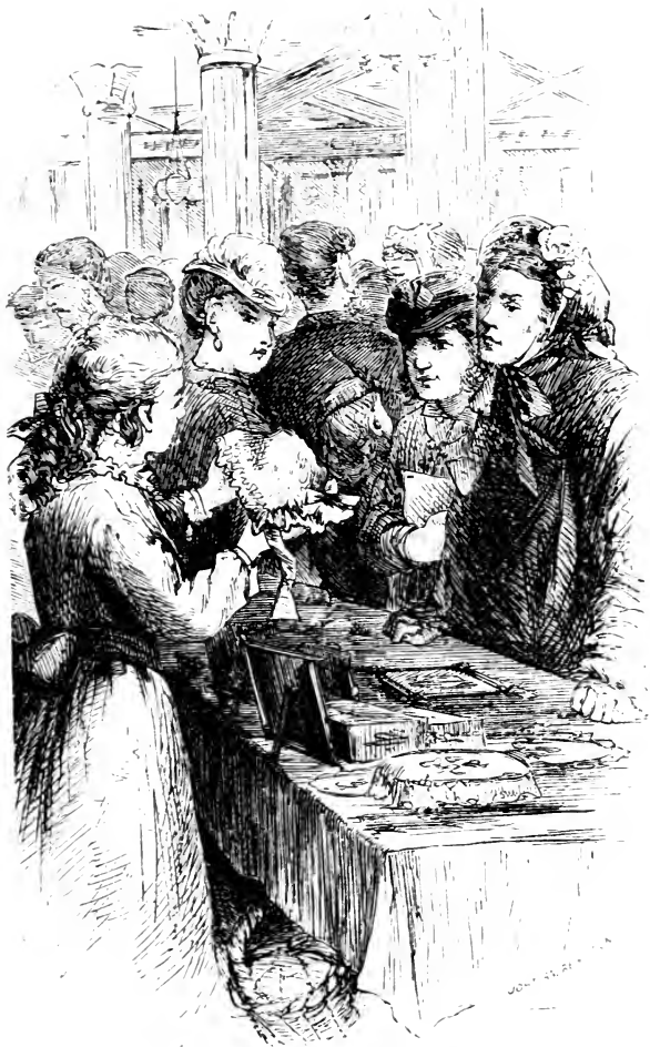
AT THE FAIR. Page 80.