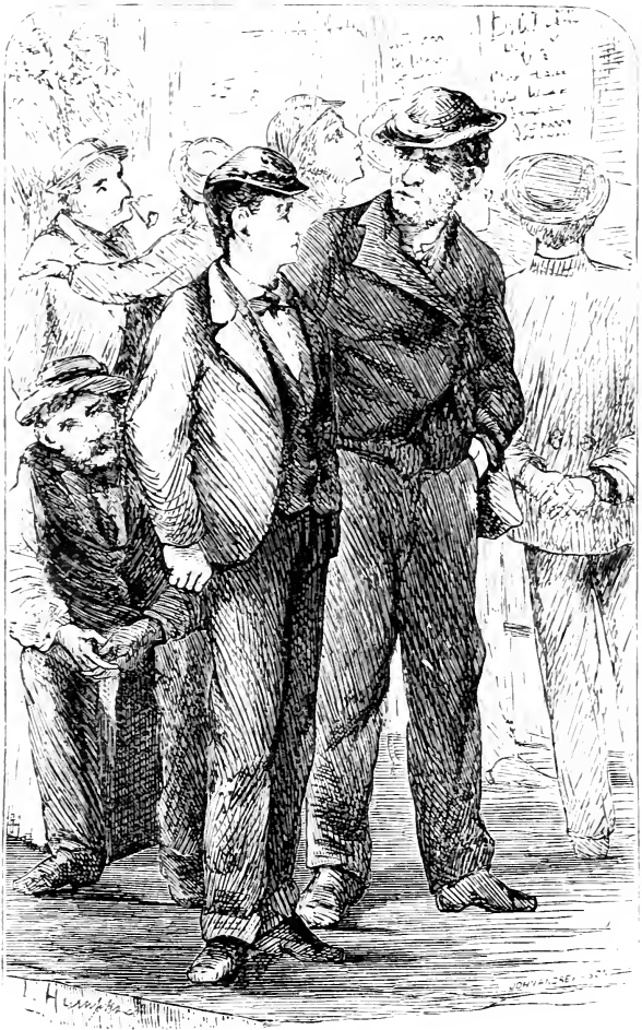
THE DRAFT. — Page 32.