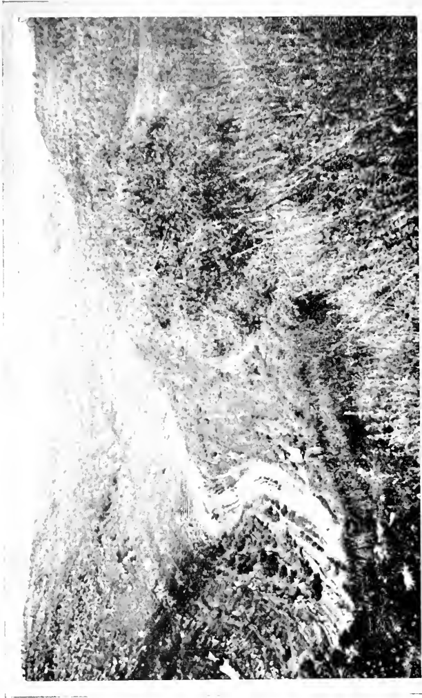
A Palestine Wadi.