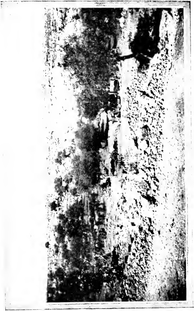
Artillery Wagon Lines among the Olives.