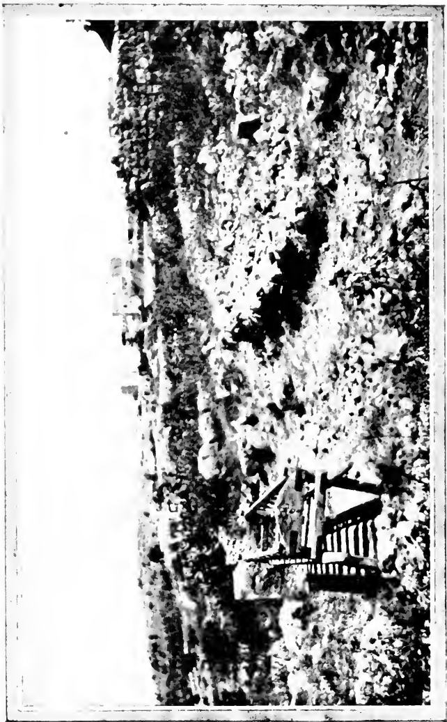
Village of Abud: public bier in foreground.