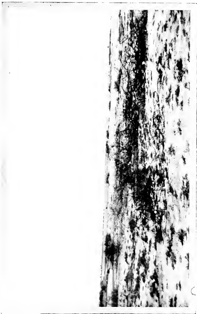
Turkish entanglements on the Simi Desert near Kantara.