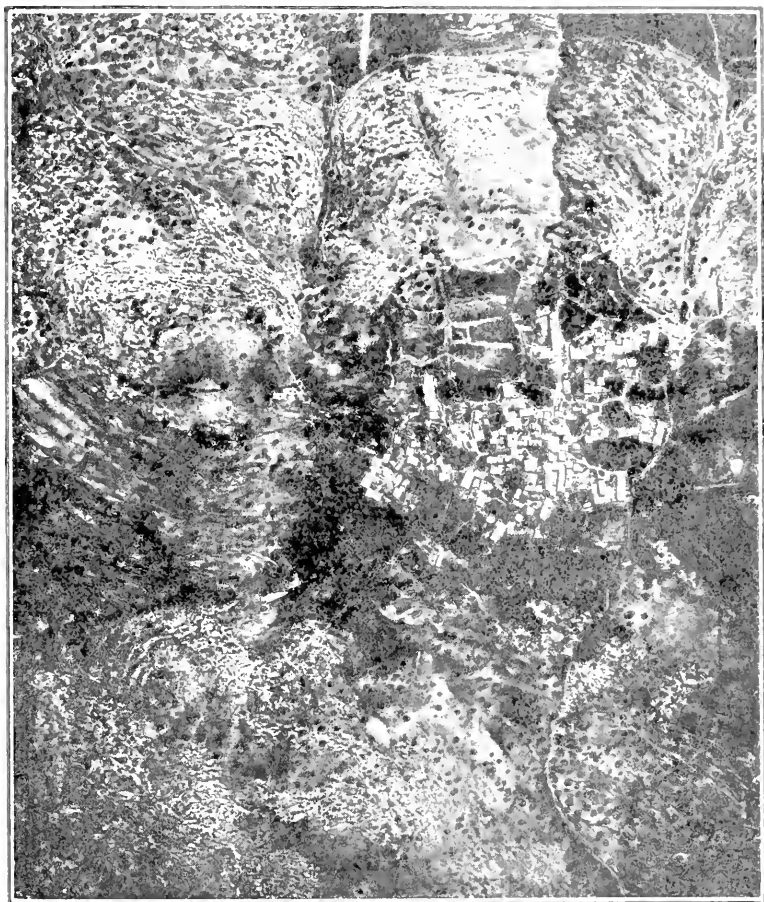
Bird's-eye View of a Hill Village. From a captured German air- photograph. The small black dots are Olive trees.