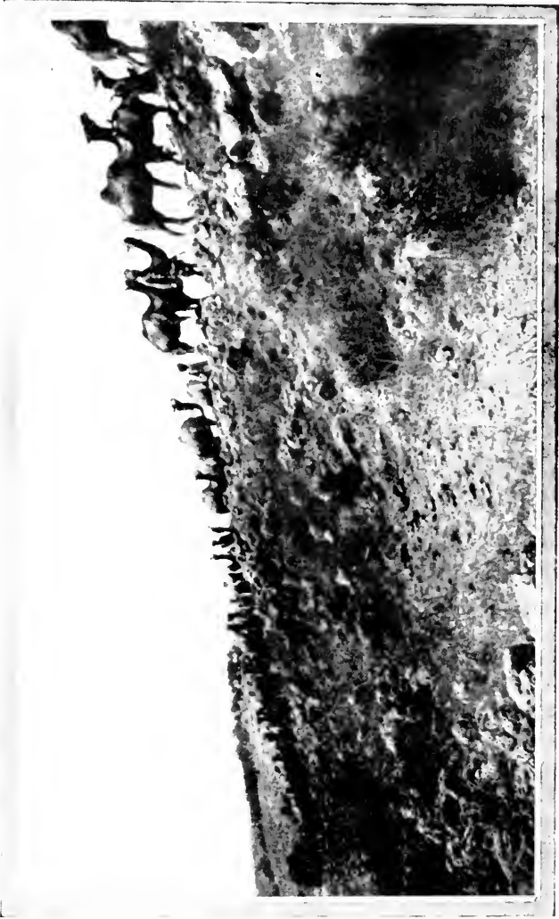
Camels on a zig-sag road among the Judaean Hills.