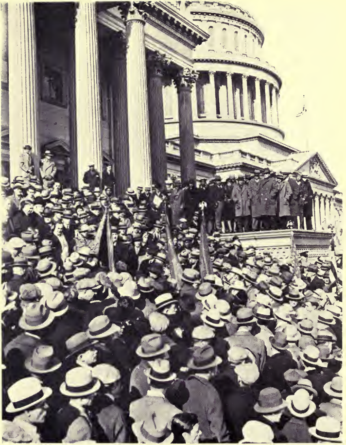
LEGIONNAIRES DEMANDING THE BONUS ON THE STEPS OF THE NATIONAL CAPITOL