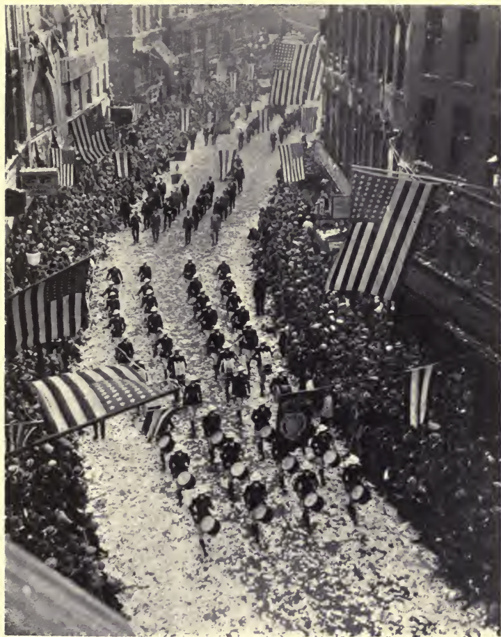
THE LEGION PARADE IN BOSTON