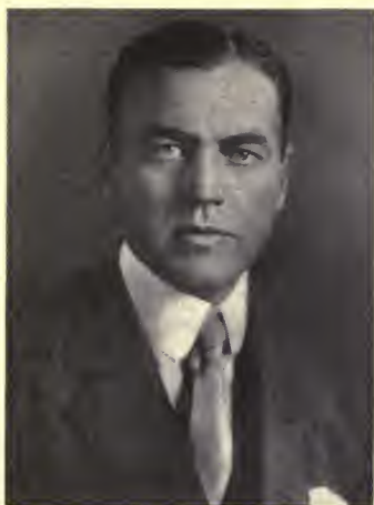
HAMILTON FISH, who wrote the Legion's Preamble, and is now a Congressman and an energetic opponent of Reds in America.