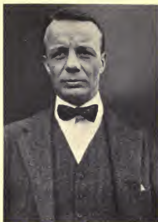
THEODORE ROOSEVELT, son of the former President, who is regarded as the father of the American Legion.