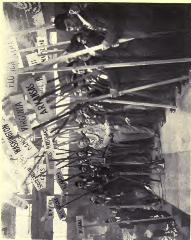
CHEERING COMMANDER-ELECT O'NEIL AT THE BOSTON CONVENTION IN 1930