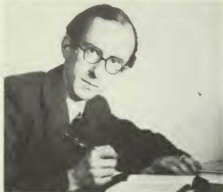
Roger Lancelyn Green at the time of the publication of his edition of "The Diaries of Lewis Carroll" (1954)

Roger Lancelyn Green, foremost Lewis Carroll scholar of our age, died on October 8, 1987, at the age of 68. His mellifluous name elicits praise in both nurseries and halls of academe. With his passing, we lose not only a great expert on Lewis Carroll but one of the most varied writers in English, a Renaissance figure, a landed gentleman who, with pen and ink (never a typewriter), produced nearly a hundred volumes of literature and history, both scholarly and popular, for young and old.