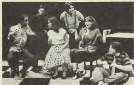
The cast of the Manhattan Project's Alice. Each actor acted out several roles.