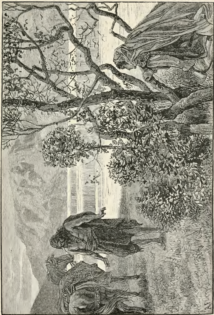
The Recovery of Owain.