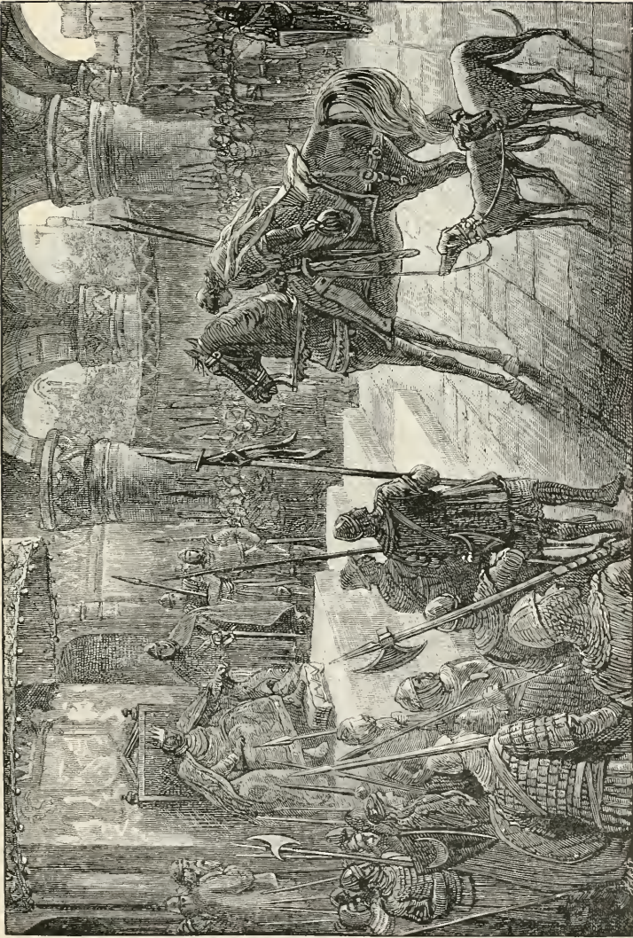
Kilhwch Riding into Arthur's Hall.