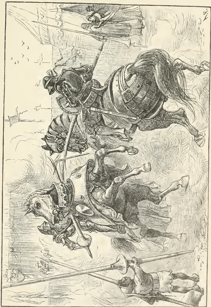
The Tournament for the Sparrowhawk.