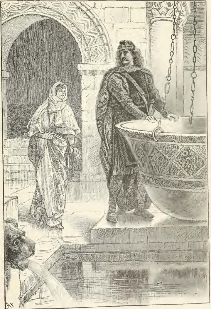
Pryderi Held Fast by the Enchanted Bowl.