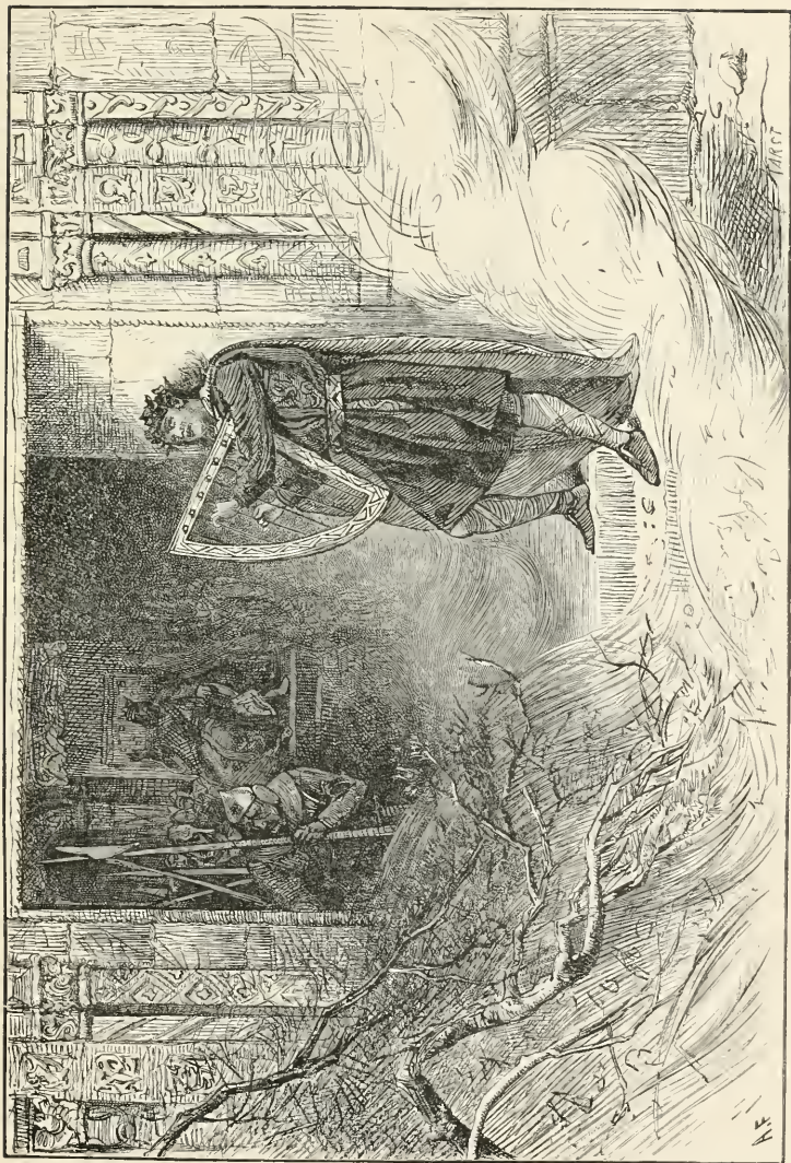
Elphin Singing before Taliesin.