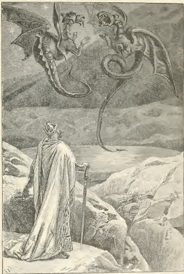
The Battle of the Dragons.