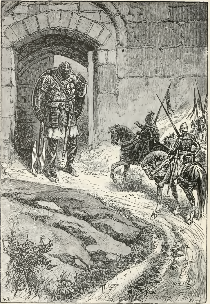
Kai and His Companions at the Castle of the Giant Gwrnach.