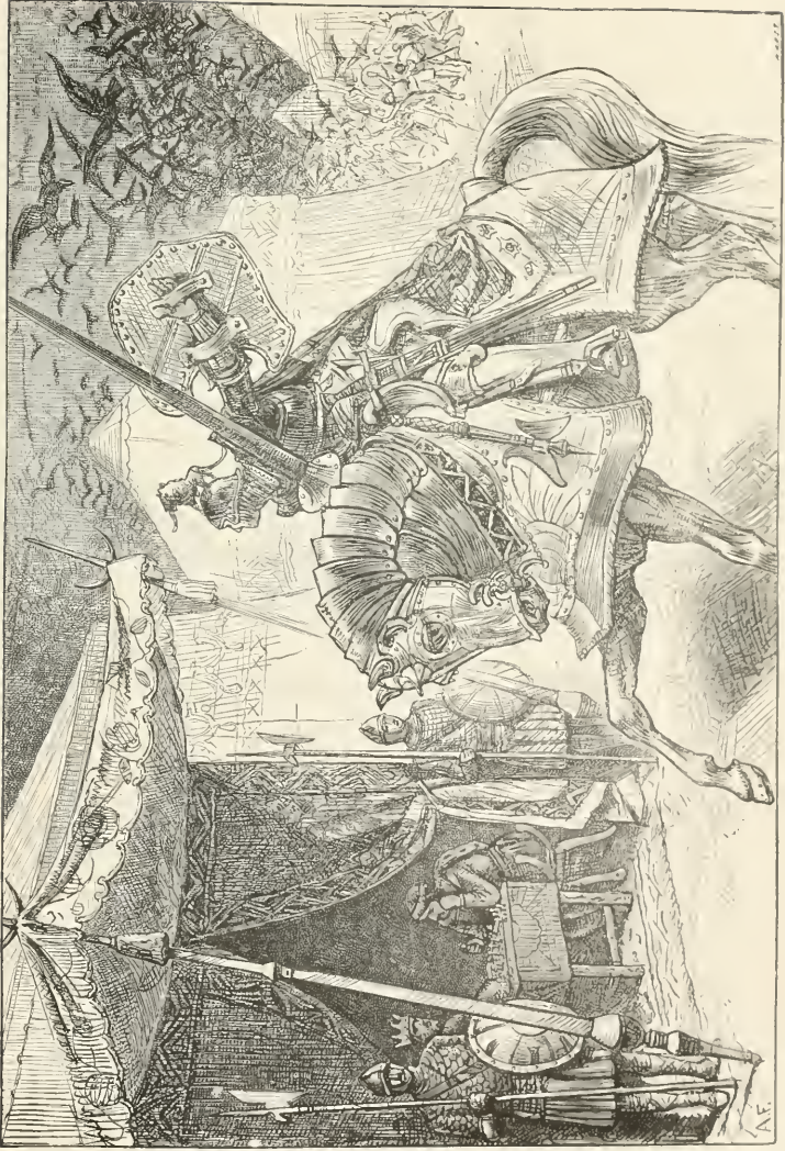
The Army of Ravens.