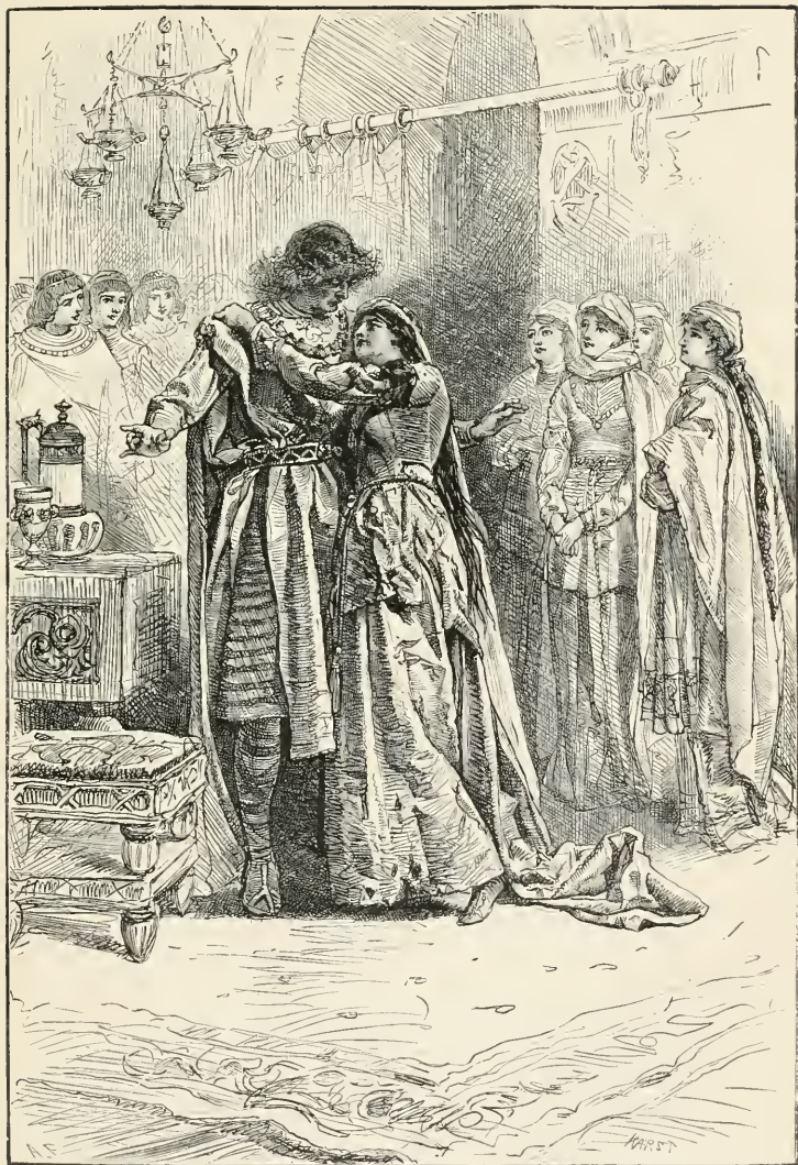
Peregrin and the Maiden.