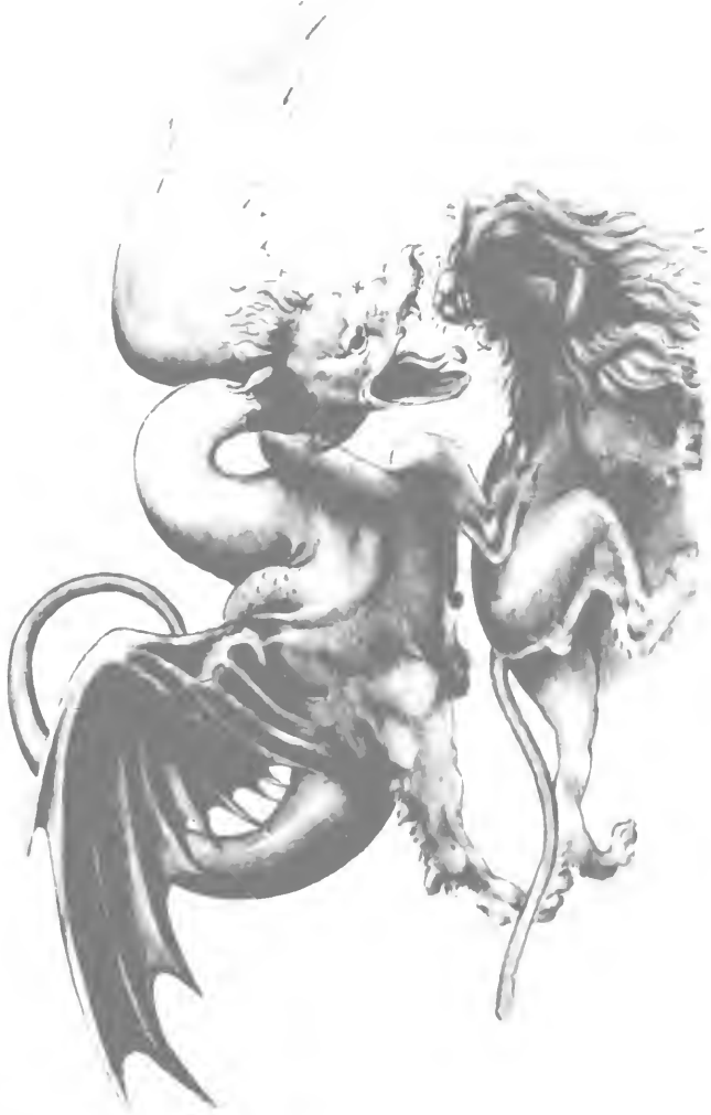
Drawing by LEONARDO DA VINCI He loved to draw strange monsters "