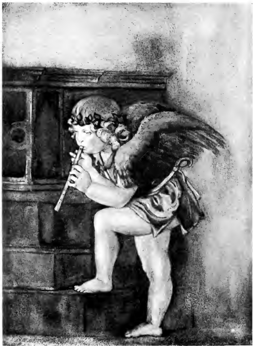
CHERUB. By GIOV. BELLINI

"Giovanni's angels are little human boys with grave sweet faces"