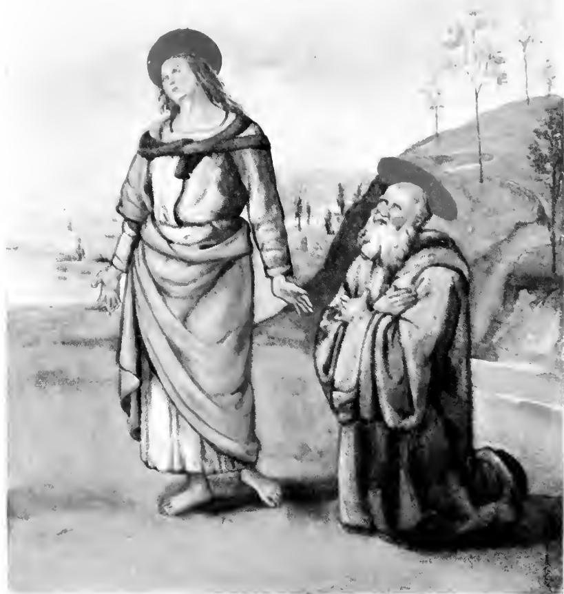
TWO SAINTS FROM THE FRESCO OF THE CRUCIFIXION By PERUGINO

"Quiet dignified saints and spacious landscapes"