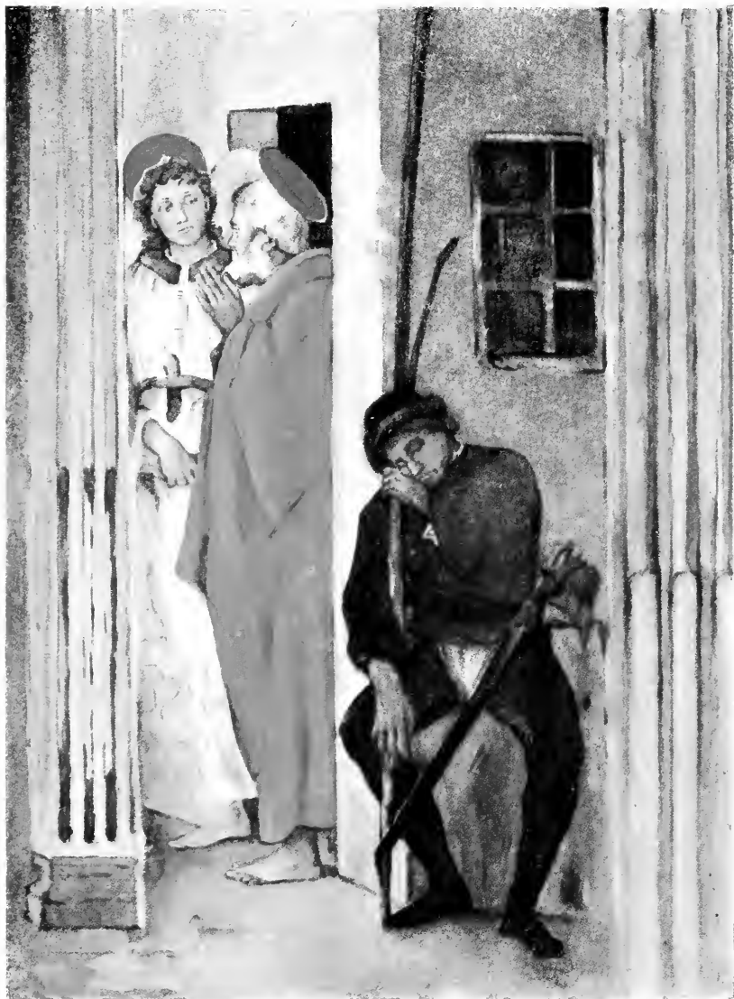
THE RELEASE OF S. PETER. By FILIPPINO LIPPI

"The tall angel in flowing white robes gently leads S. Peter out of prison"