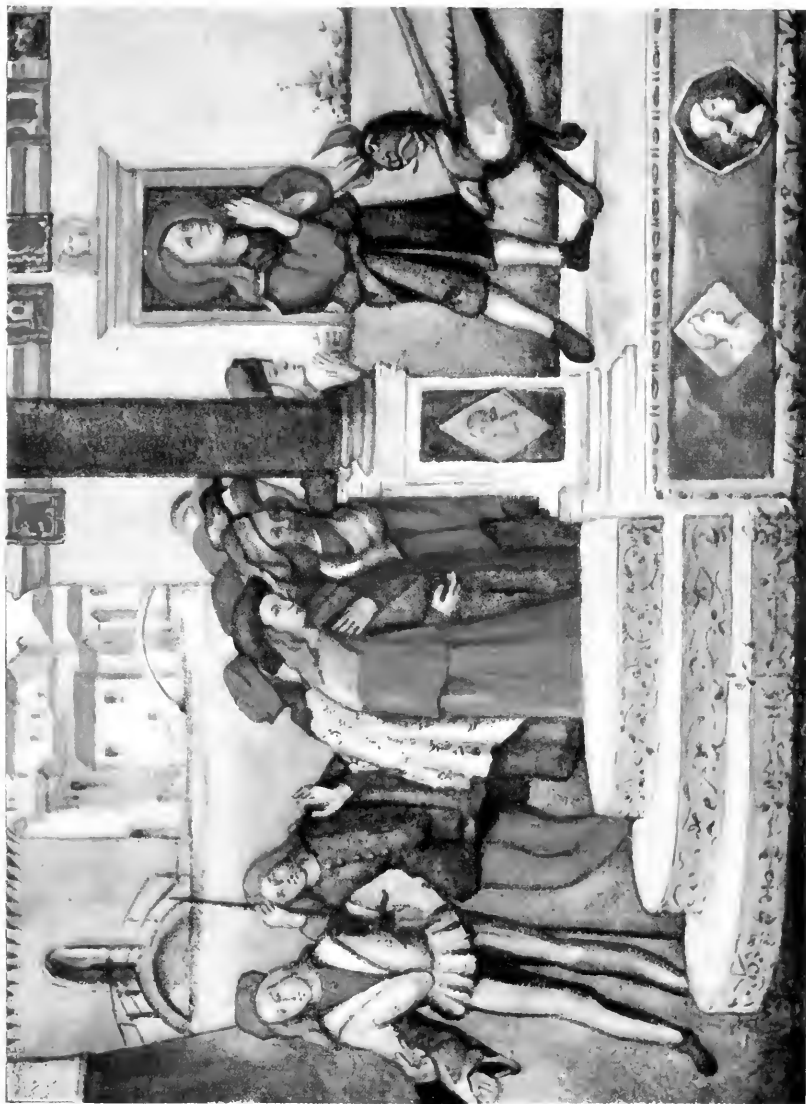
ST. TRYPHONIUS AND THE BASILISK. BY CARPACCIO

"The little boy saint has folded his hands together and looks upward in prayer."