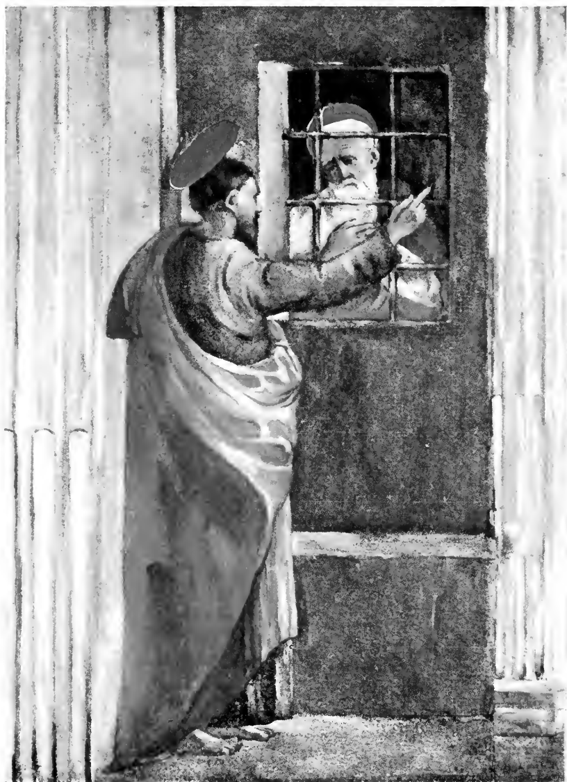
S. PETER IN PRISON. By FILIPPINO LIPPI

"The sad face of S. Peter looks out through the prison bars"