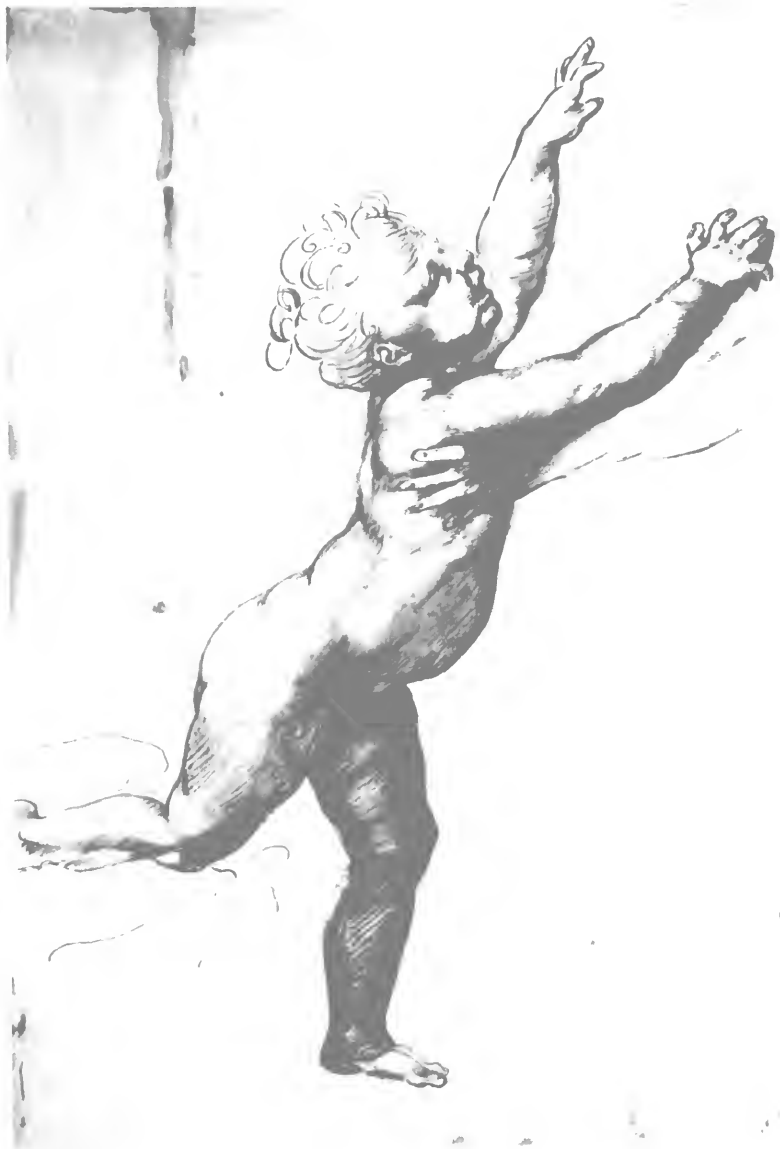
Drawing by RAPHAEL.

"Round-limbed rosy children, half human, half divine"