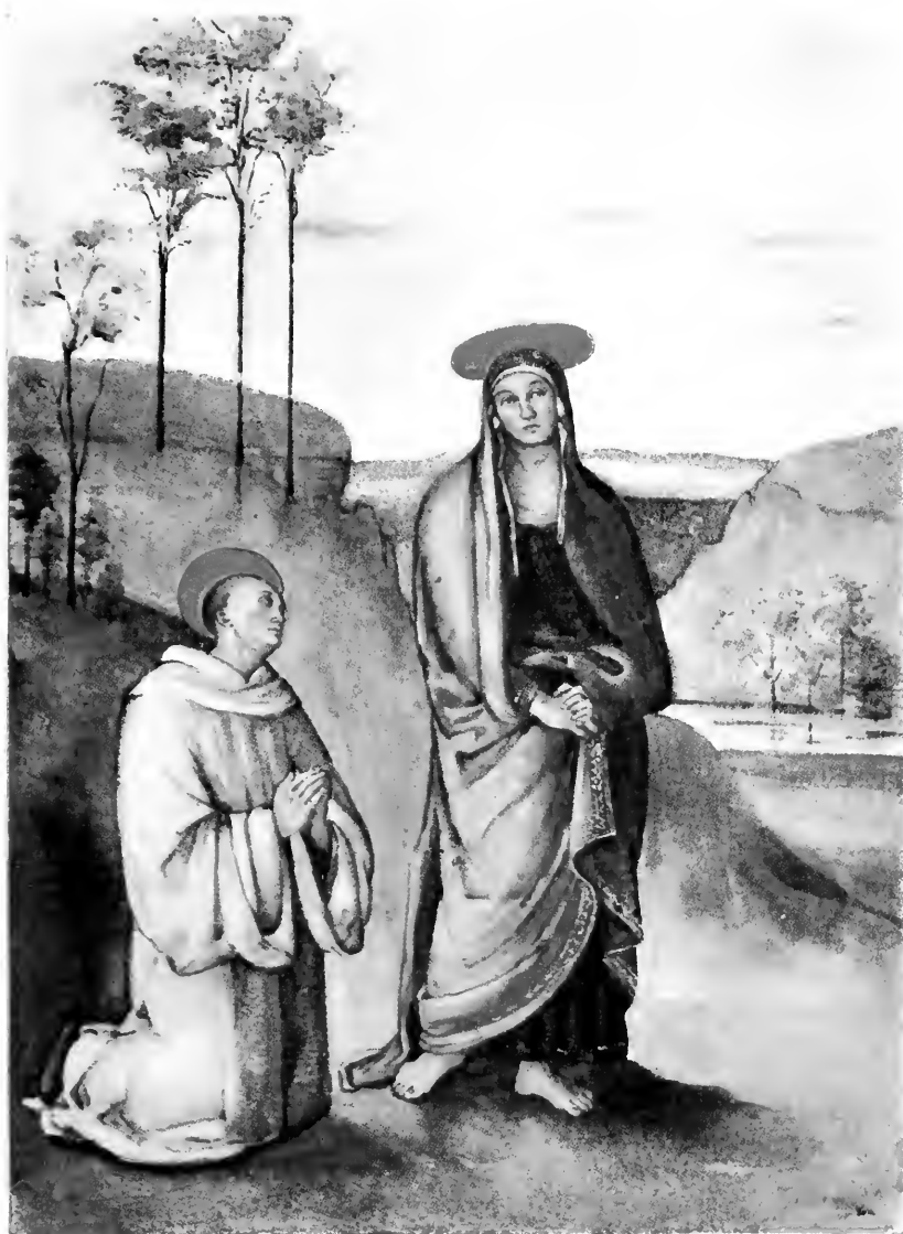
TWO SAINTS FROM THE FRESCO OF THE CRUCIFIXION By PERUGINO

"Beyond was the blue thread of river and the single trees pointing upwards"