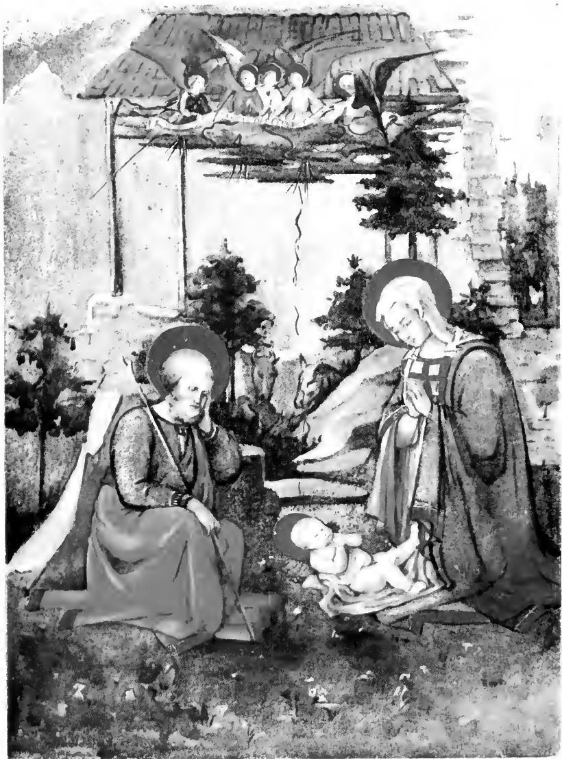
THE NATIVITY. By FILIPPO LIPPI