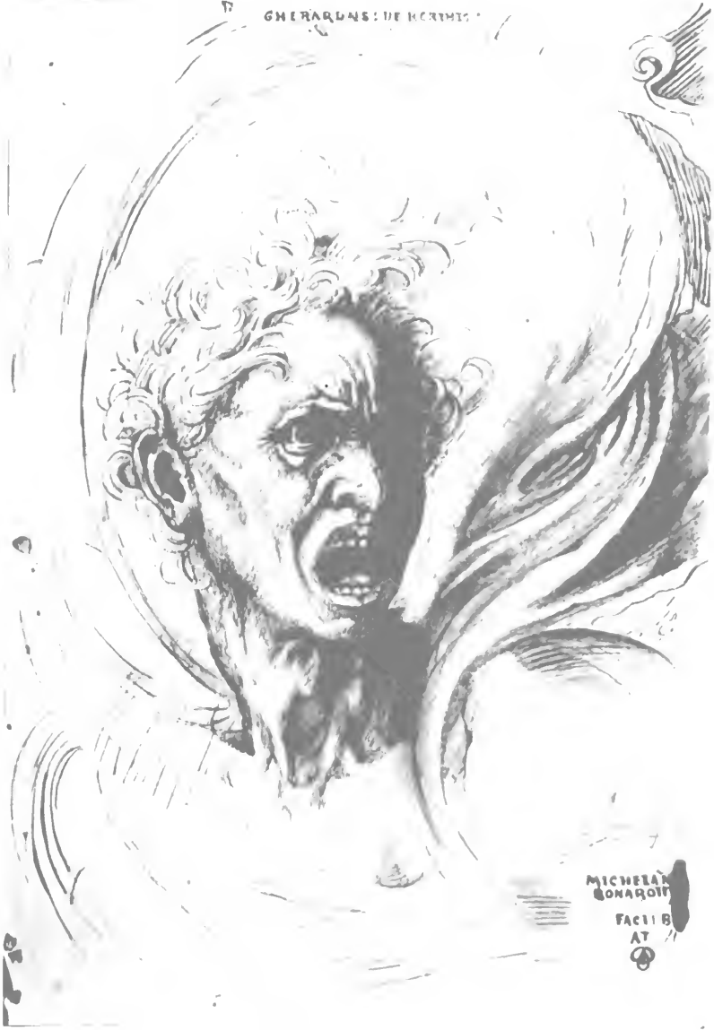
Drawing by MICHAEL ANGELO "A terrible head of a furious old man"