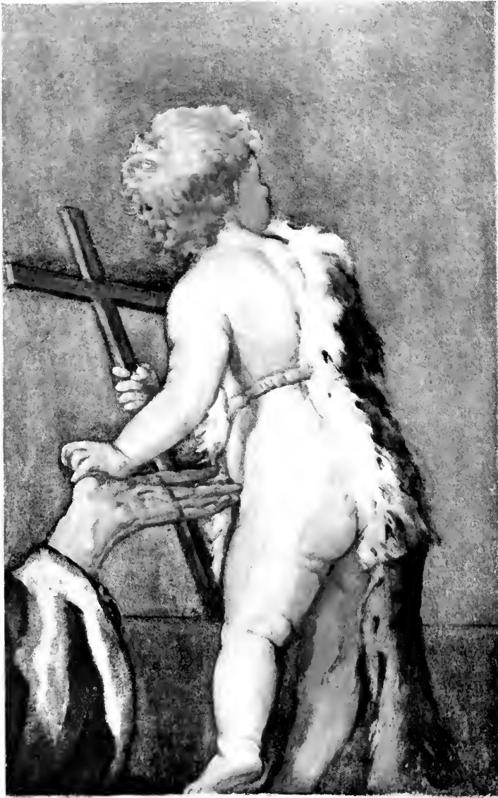
THE LITTLE S JOHN FROM THE MADONNA ENTHRONED By VERONESE

"The little S. John with the skin thrown over his bare shoulder and the cross in his hand"