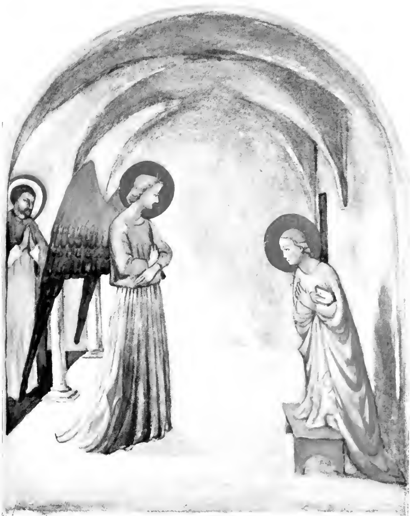
THE ANNUNCIATION. By FRA ANGELICO

"The gentle Virgin bending before the Angel messenger"