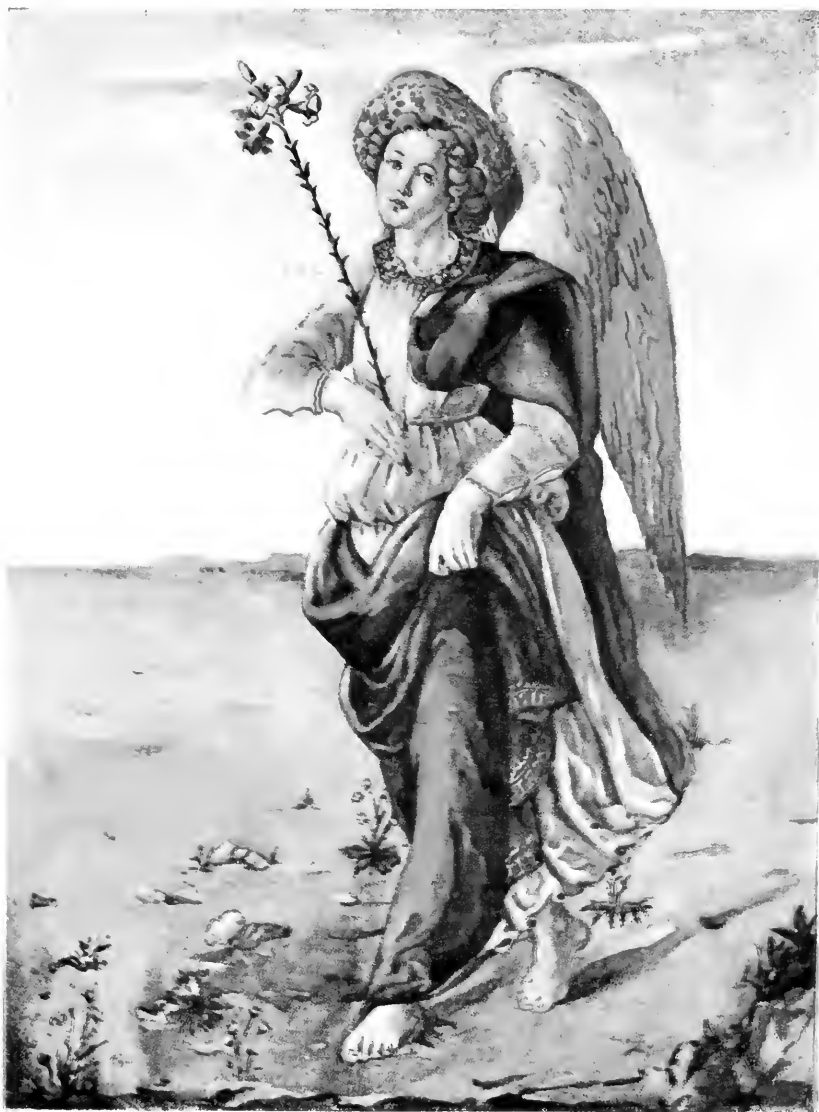
THE ANGEL FROM TOBIAS AND THE ANGEL. By BOTTICELLI

"His figures seemed to move as if to the rhythm of music"