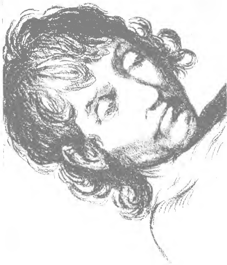
Drawing by TINTORETTO

"The head of a Venetian boy, such as Tintoretto met daily among the fisher-folk of Venice."