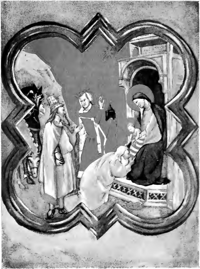
THE VISIT OF THE MAGI By GIOTTO

"The little Baby Jesus sitting on His Mother's knee"