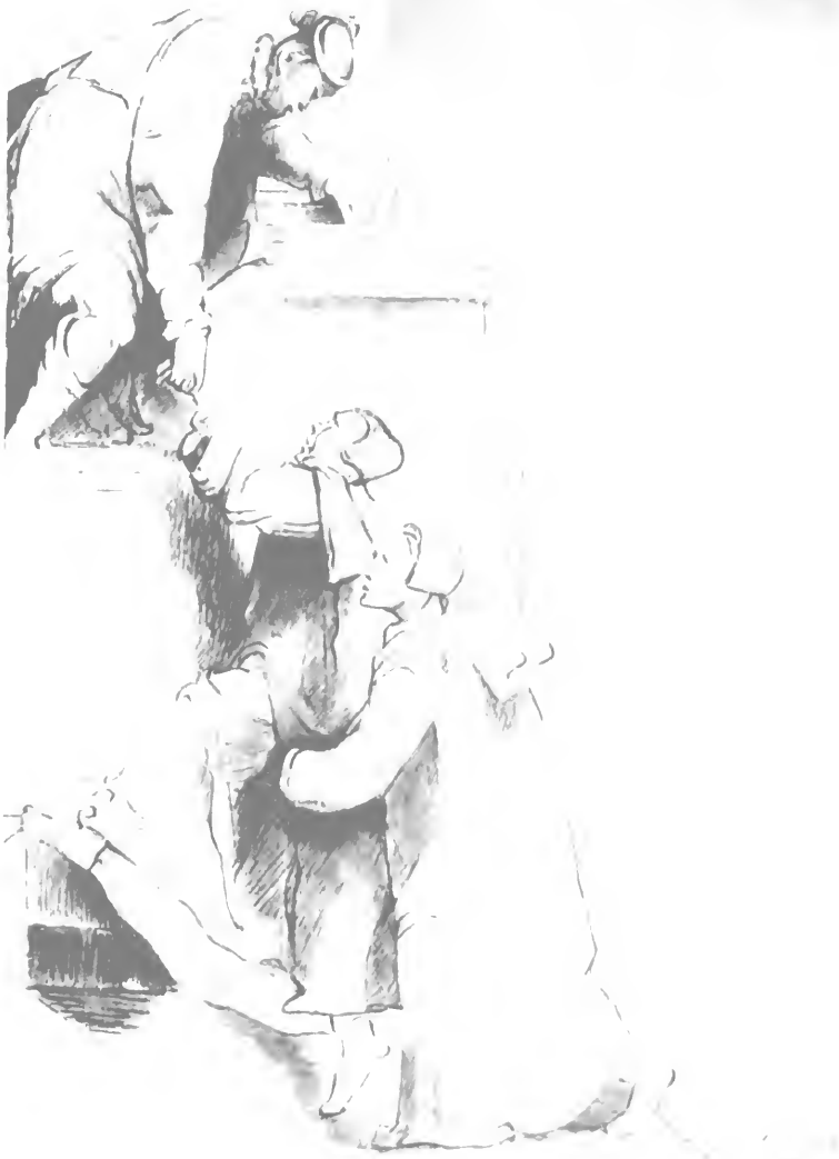
Drawing by GIORGIONE

"A man in Venetian dress helping two women to mount one of the niches of a marble palace."