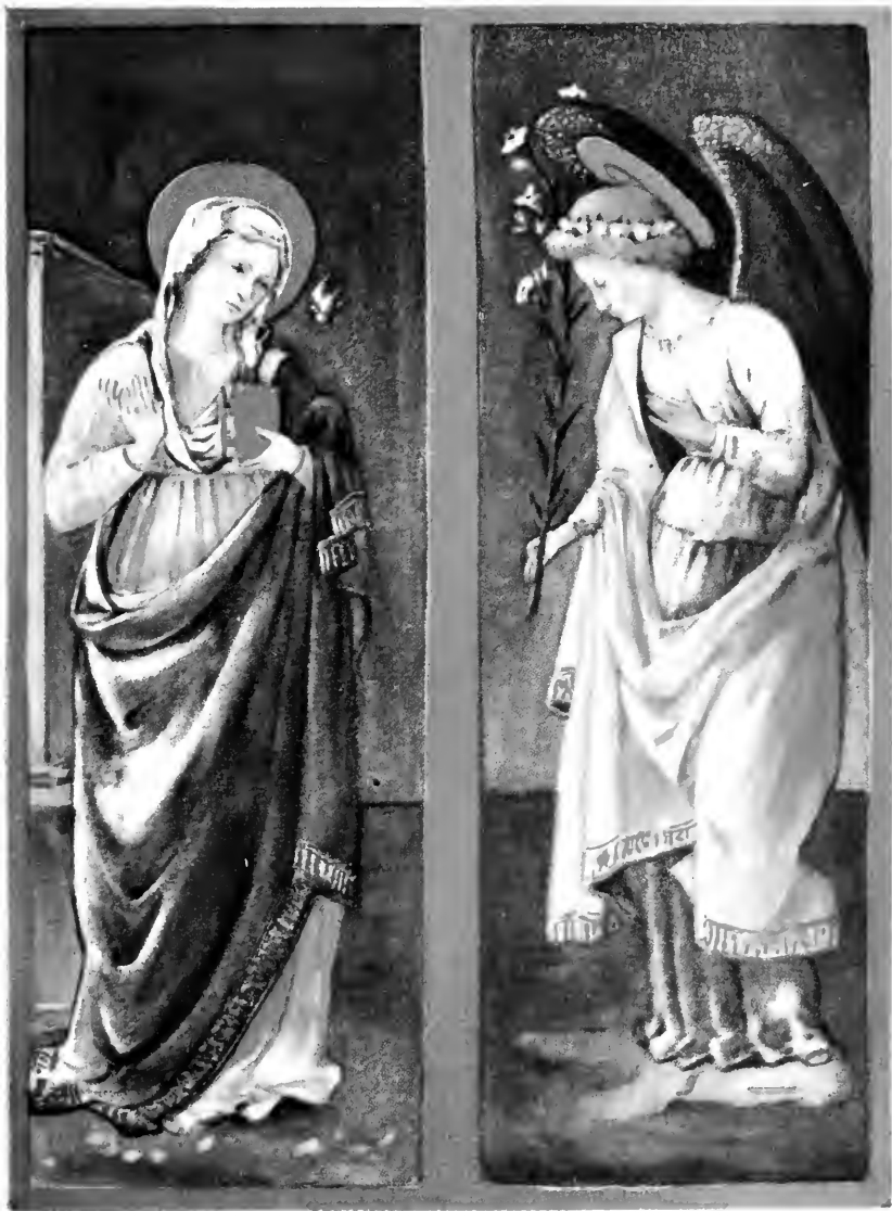
THE ANNUNCIATION. By FILIPPO LIPPI

"The Madonna with the dove fluttering near, and the Angel messenger bearing the lily branch"