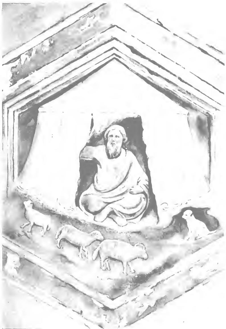
Relief in marble by GIOTTO

"The shepherd sitting under his tent, with the sheep in front"