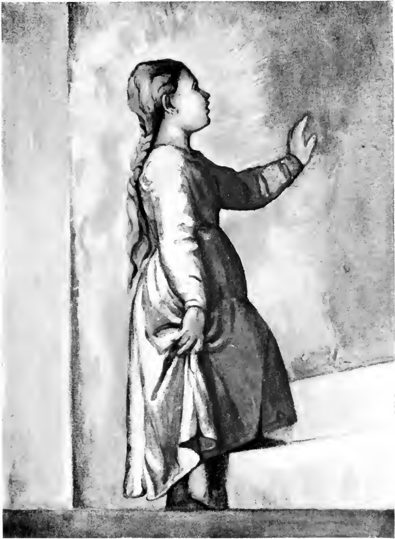
THE LITTLE VIRGIN. By TITIAN