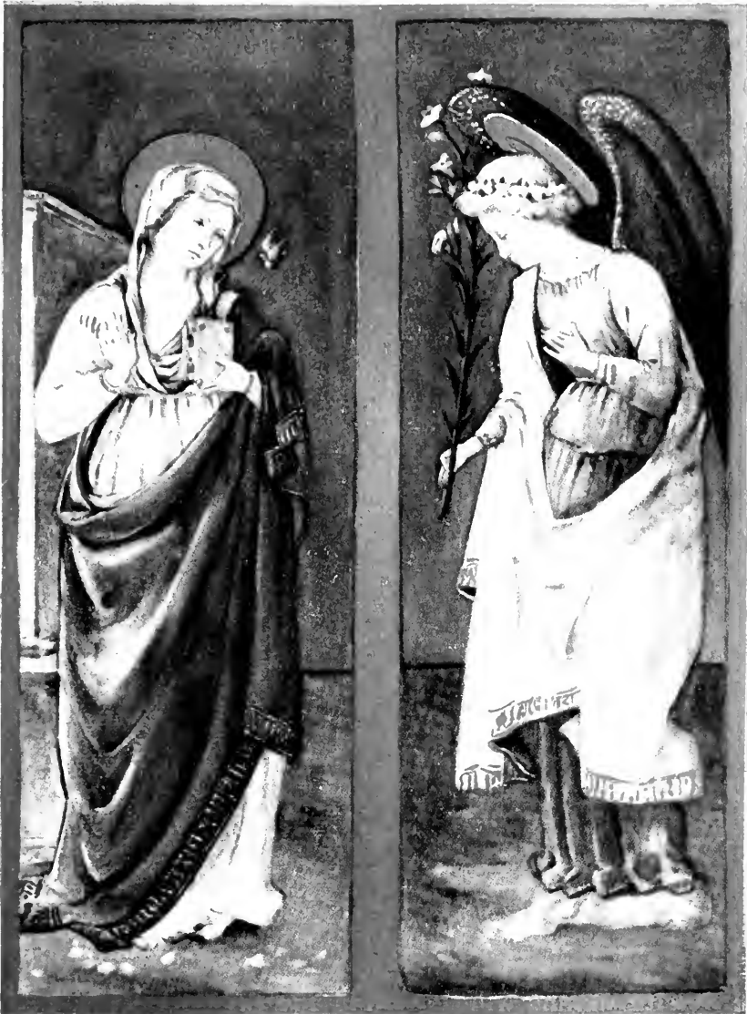
THE ANNUNCIATION. By FILIPPO LIPPI

"The Madonna with the dove fluttering near, and the Angel messenger bearing the lily branch"