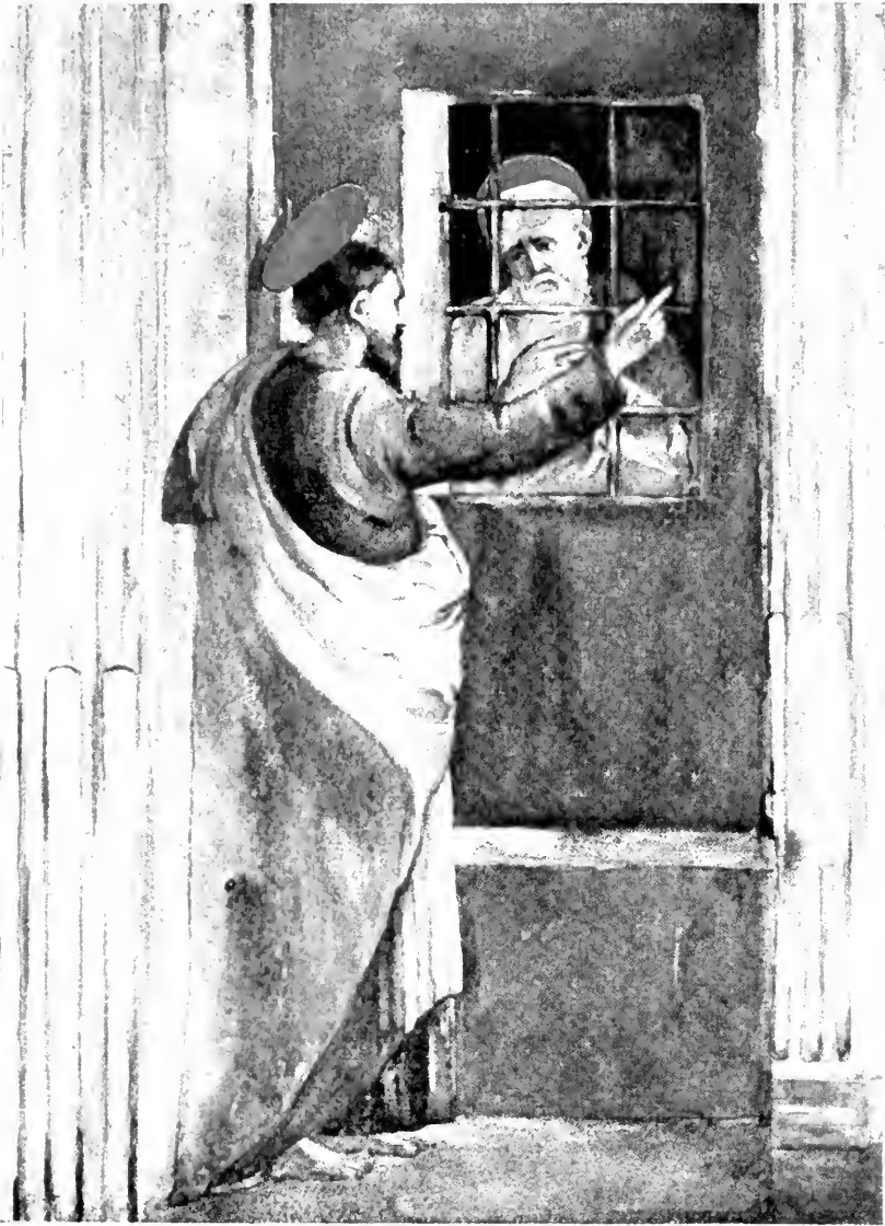
S. PETER IN PRISON. By FILIPPINO LIPPI

"The sad face of S. Peter looks out through the prison bars"