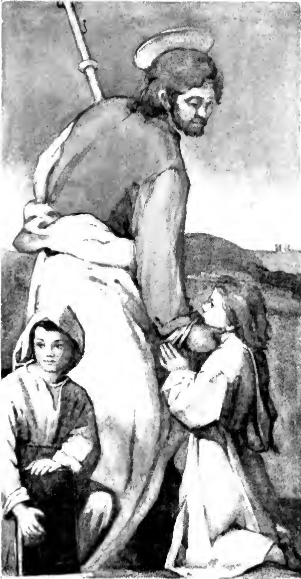
S. JAMES. By ANDREA DEL SARTO

"The kind strong hand of the saint is placed lovingly beneath the little chin"