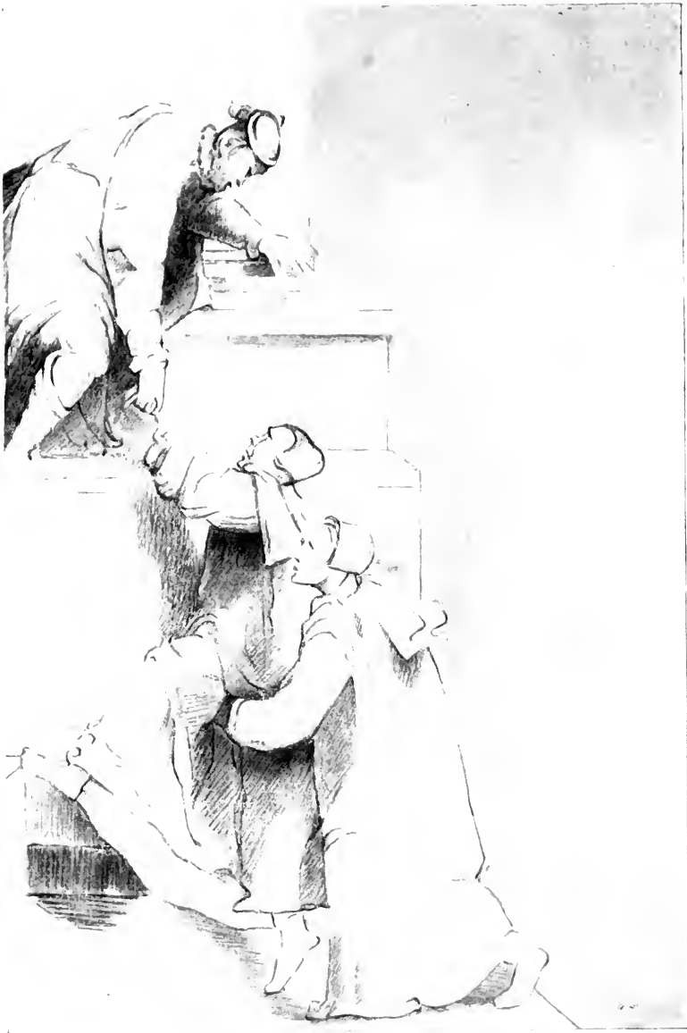
Drawing by GIORGIONE

' A man in Venetian dress helping two women to mount one of the niches of a marble palace "