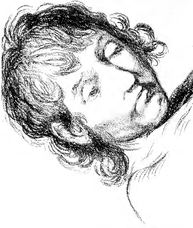
Drawing by TINTORETTO

"The head of a Venetian boy, such as Tintoretto met daily among the fisher-folk of Venice."