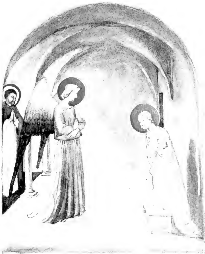
THE ANNUNCIATION. By FRA ANGELICO

"The gentle Virgin bending before the Angel messenger"