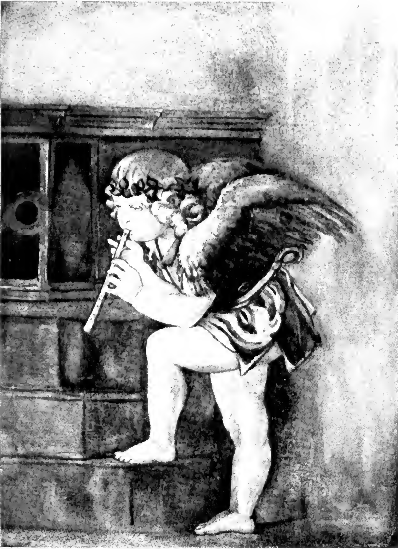
CHERUB. By GIOV. BELLINI

"Giovanni's angels are little human boys with grave sweet faces"