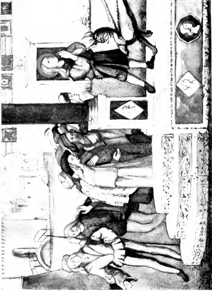
ST. TRYPHONIUS AND THE BASILISK. By CARPACCIO

"The little boy saint has folded his hands together and looks upward in prayer."