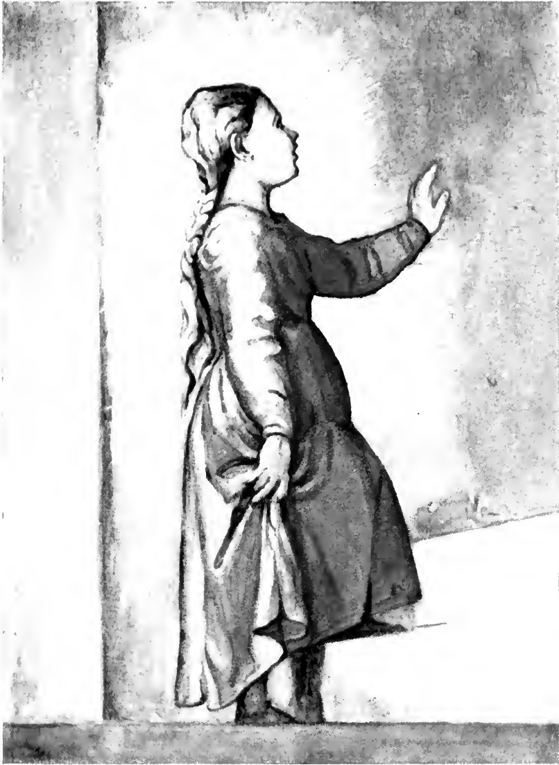
THE LITTLE VIRGIN. By TITIAN