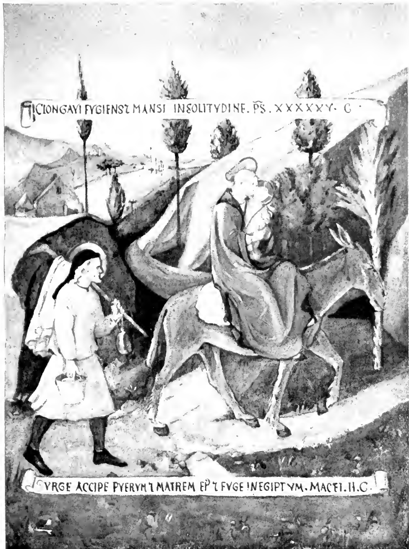
THE FLIGHT INTO EGYPT. By FRA ANGELICO

"The Madonna in her robe of purest blue holding the Baby close in her arms"