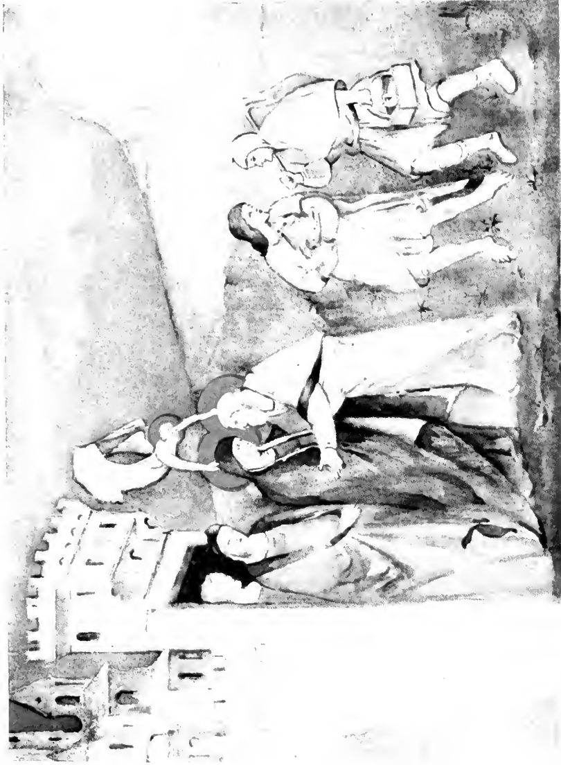
THE MEETING OF ANNA AND JOACHIM. BY GIOTTO

"Two homely figures outside the narrow gateway."