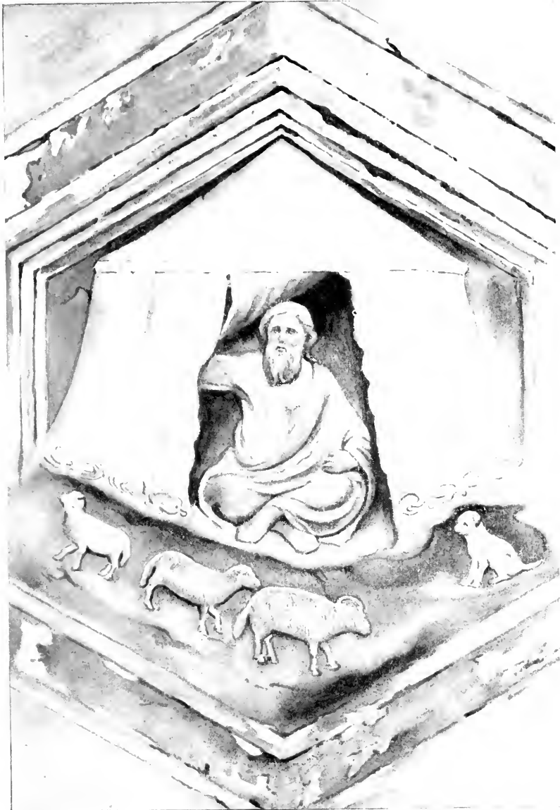
Relief in marble by GIOTTO

"The shepherd sitting under his tent, with the sheep in front"