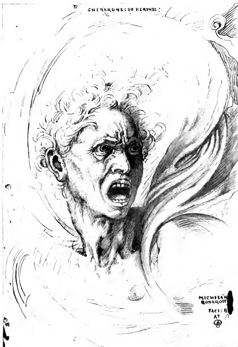
Drawing by MICHAEL ANGELO "A terrible head of a furious old man"