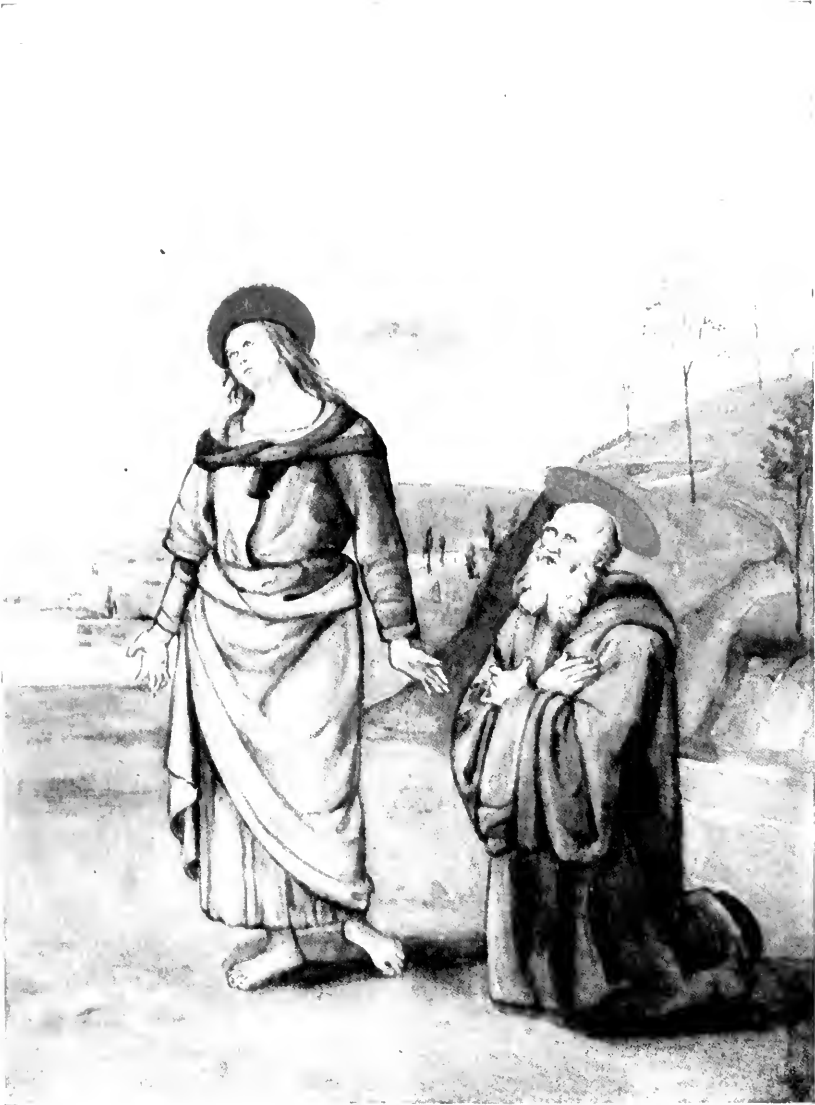
TWO SAINTS FROM THE FRESCO OF THE CRUCIFIXION By PERUGINO

"Quiet dignified saints and spacious landscapes"