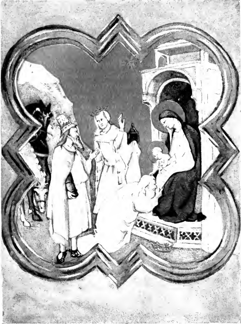
THE VISIT OF THE MAGI. By GIOTTO

"The little Baby Jesus sitting on His Mother's knee"