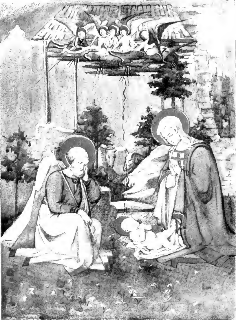
THE NATIVITY. By FILIPPO LIPPI