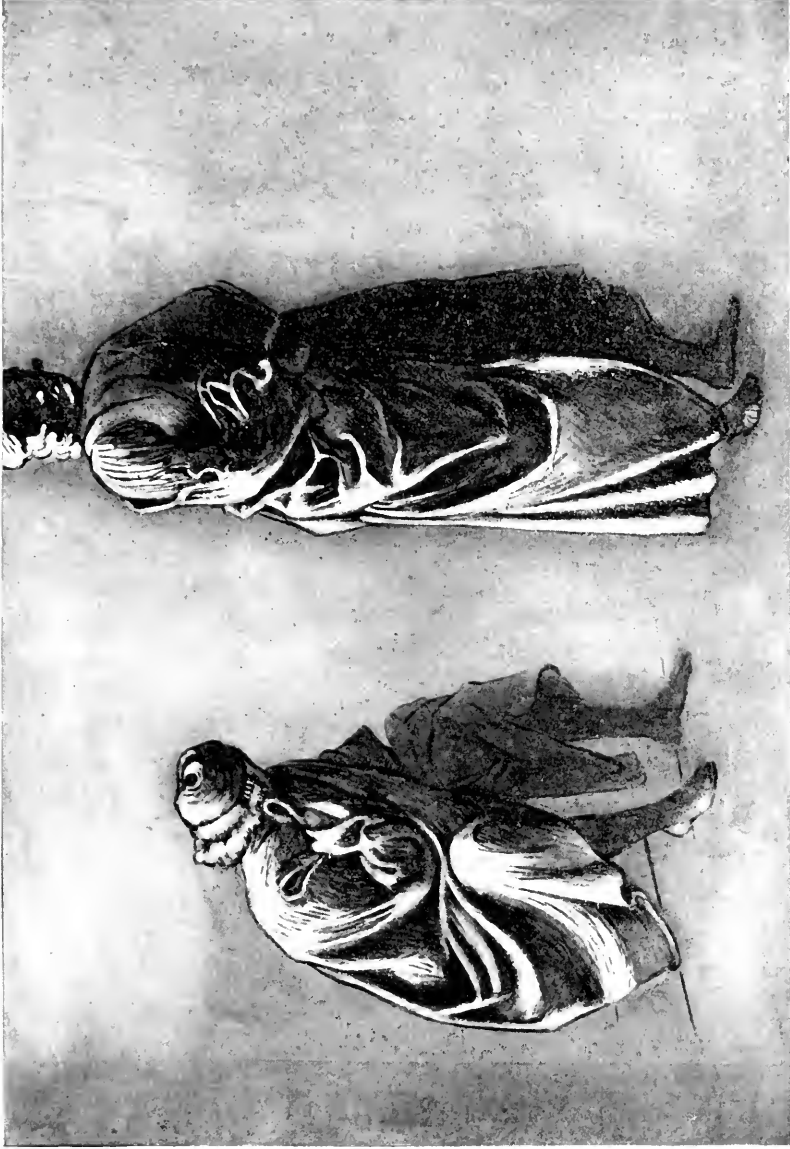
Drawing by GHIRLANDAIO