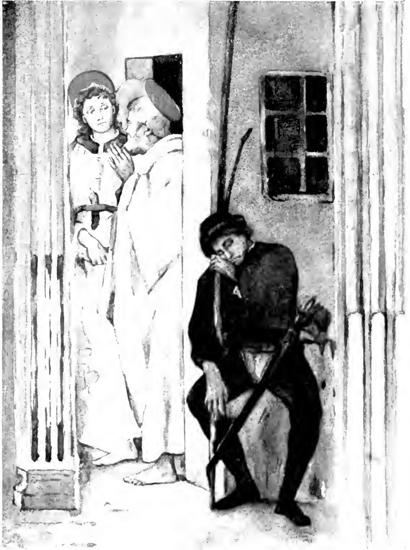
THE RELEASE OF S. PETER. By FILIPPINO LIPPI

"The tall angel in flowing white robes gently leads S. Peter out of prison."