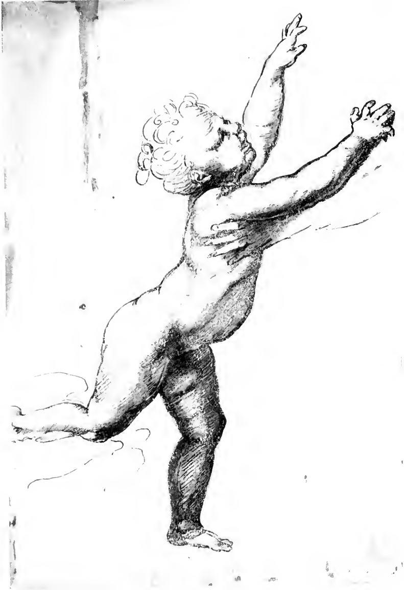
Drawing by RAPHAEL

"Round-limbed rosy children, half human, half divine"