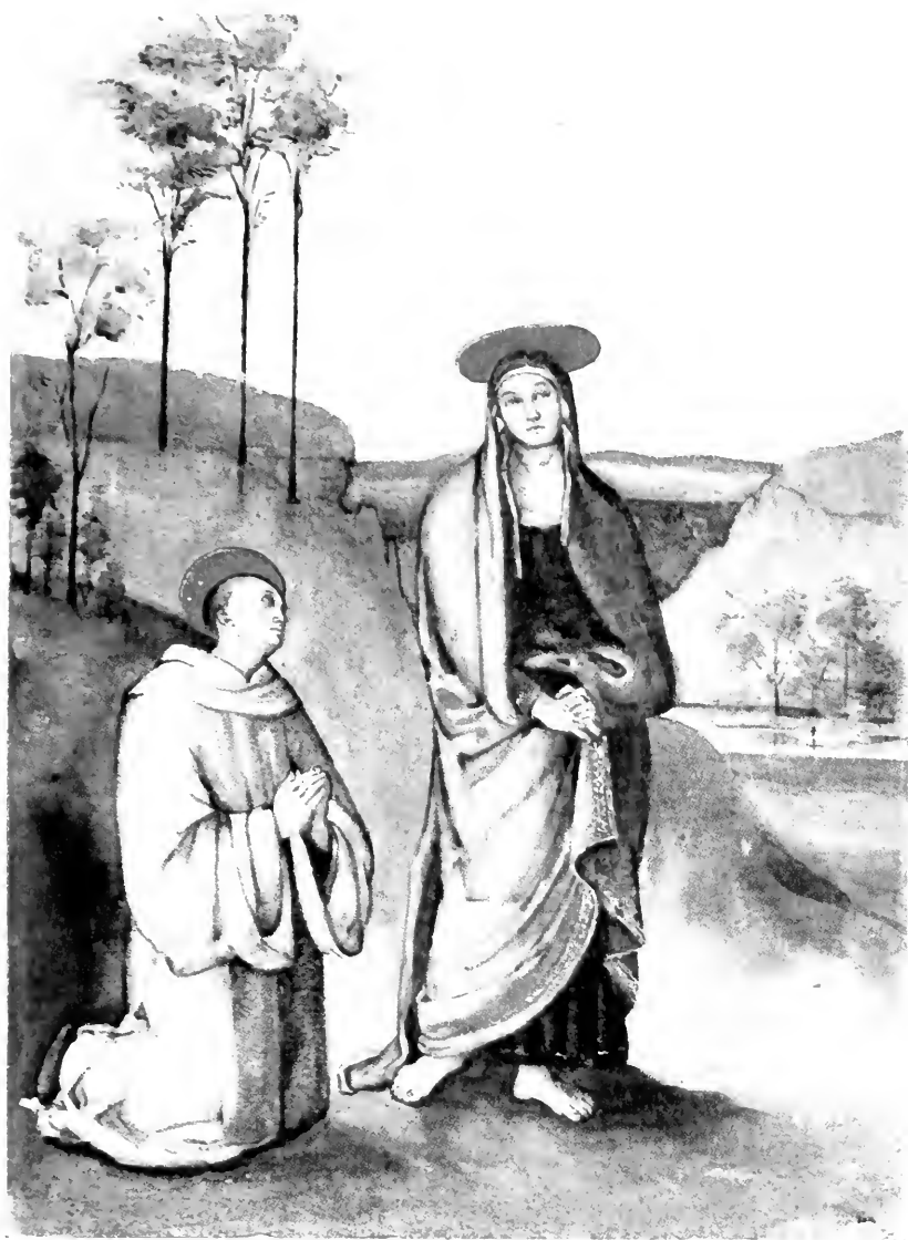
TWO SAINTS FROM THE FRESCO OF THE CRUCIFIXION By PERUGINO

"Beyond was the blue thread of river and the single trees pointing upwards"