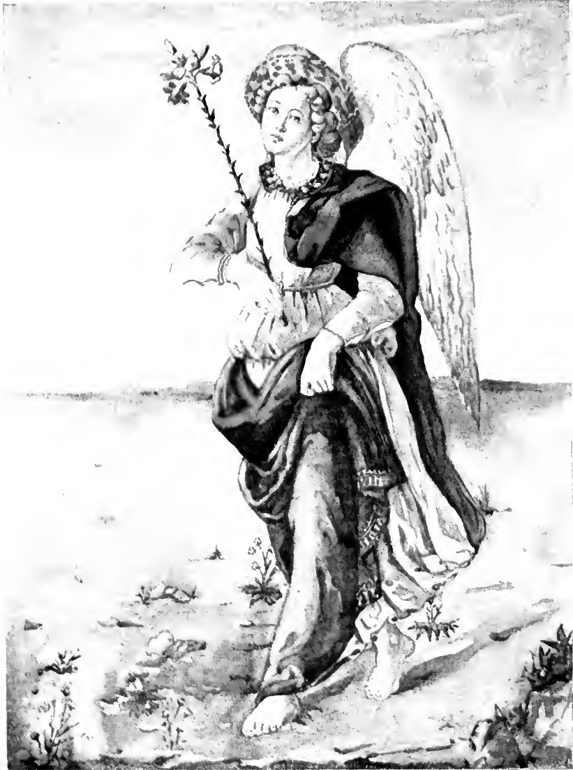
THE ANGEL FROM TOBIAS AND THE ANGEL. By BOTTICELLI

"His figures seemed to move as if to the rhythm of music"