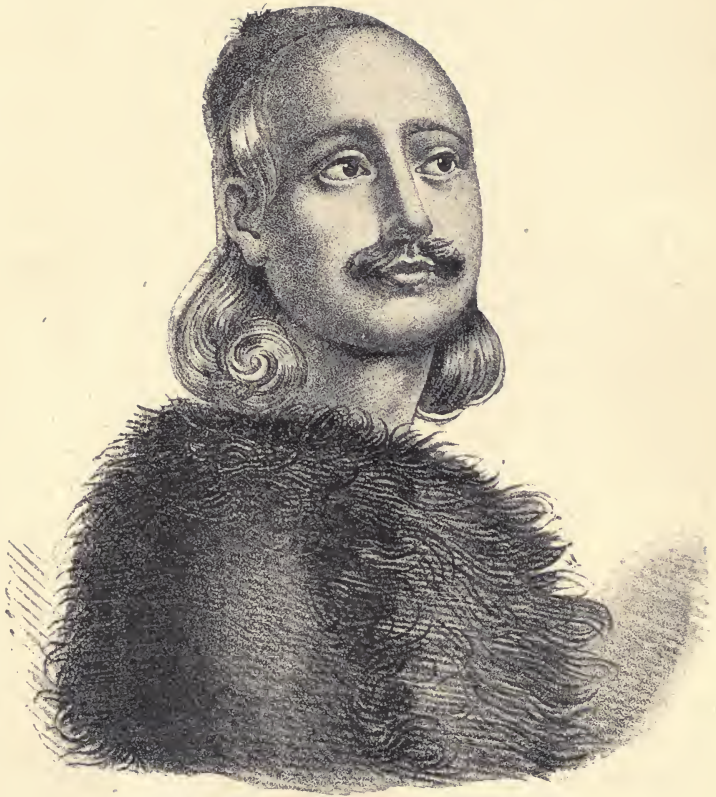
MARKOS BOTZARES, A SOULIOTE CHIEF.

Surnamed "The Leonidas of the Revolution," killed during the Siege of Missolonghi.