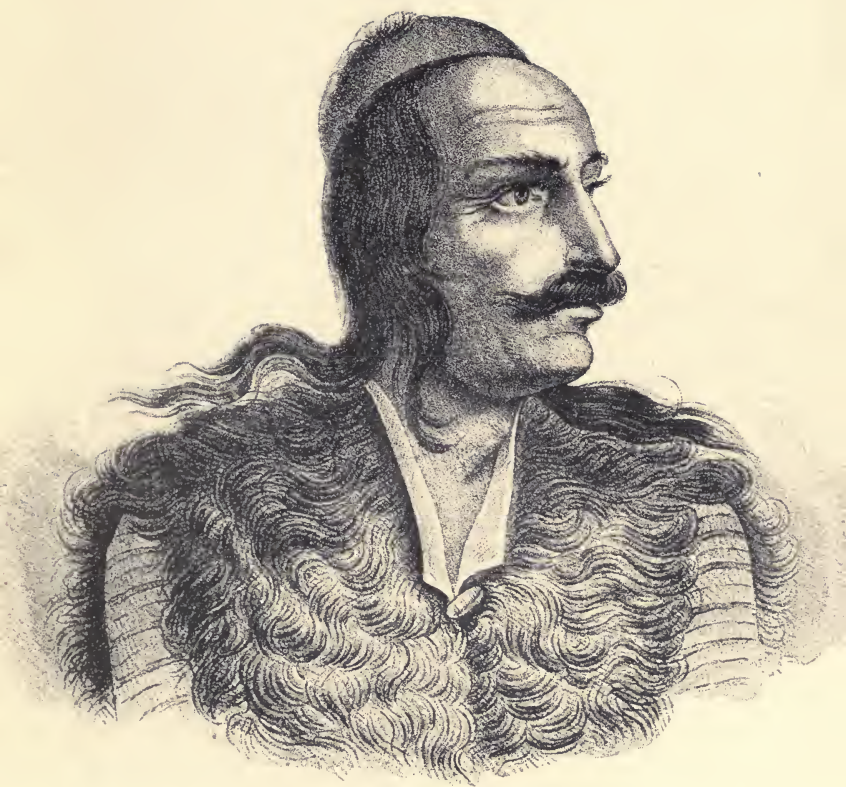
NIKETAS THE TURKOPHAGE.