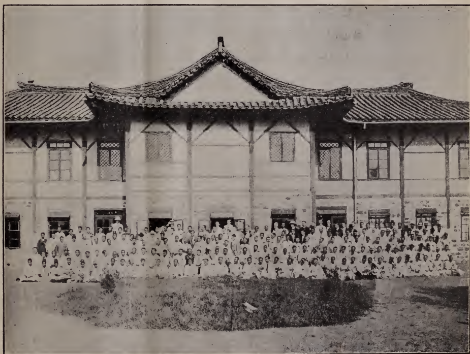
THE FIRST GENERAL ASSEMBLY OF THE PRESBYTERIAN CHURCH IN KOREA.